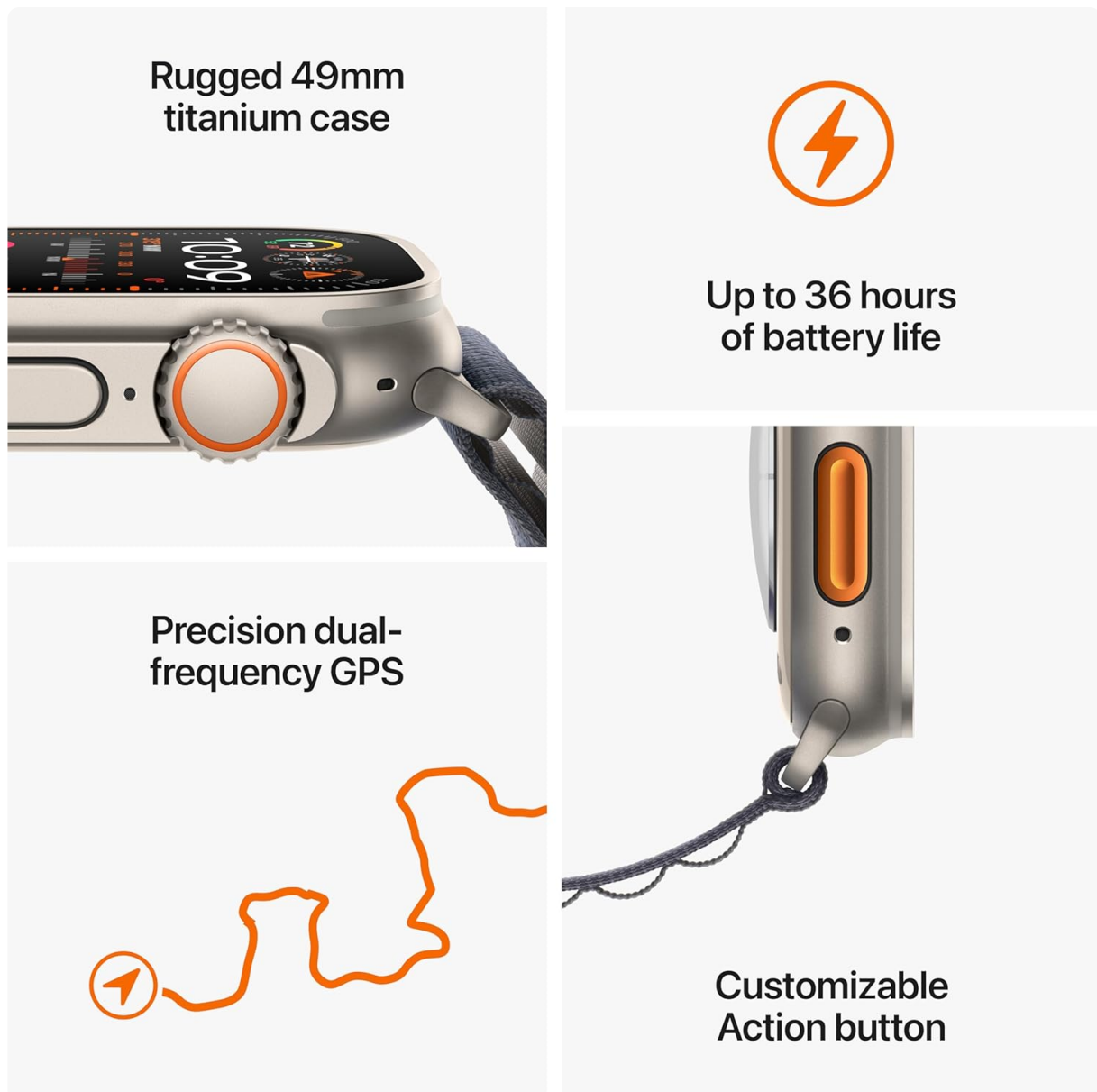
Image: An infographic detailing the rugged 49mm titanium case, 36-hour battery life, precision dual-frequency GPS, and