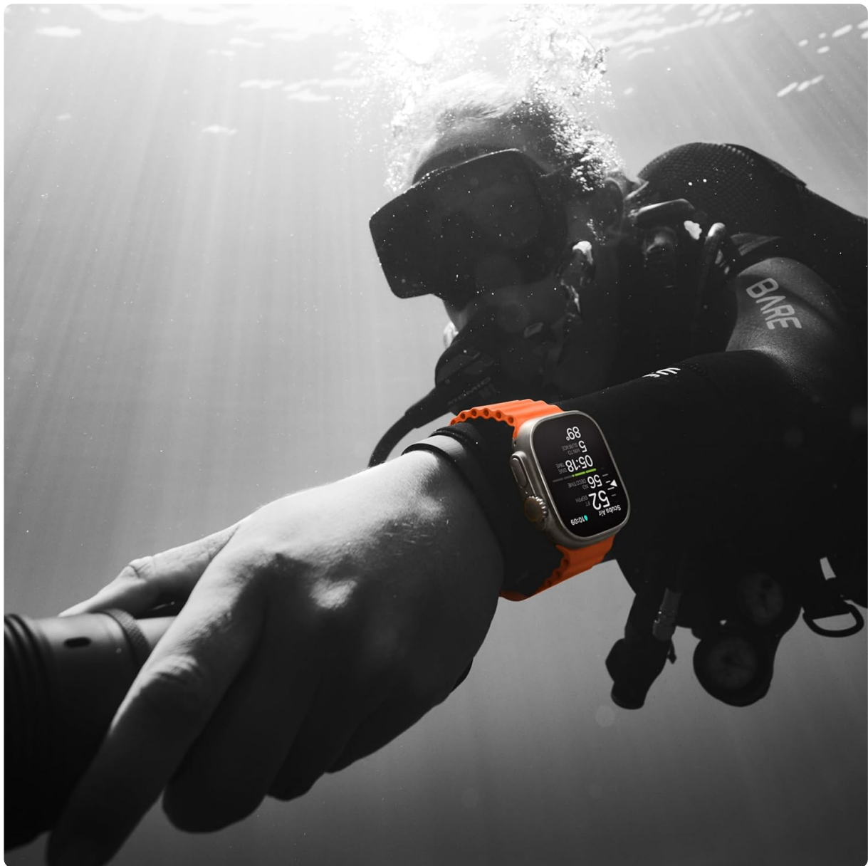
Image: An underwater shot of a diver wearing the Apple Watch Ultra 2, highlighting its water resistance and suitability for diving activities.