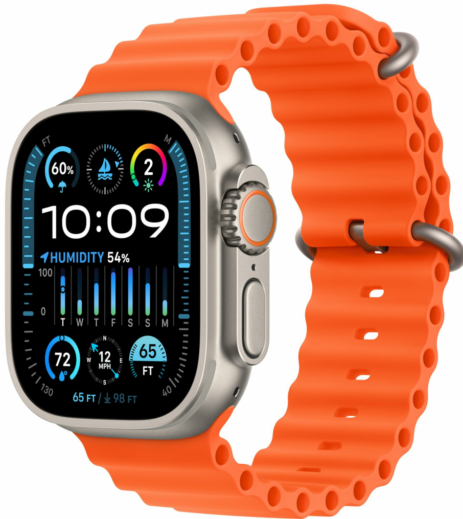
Image: Apple Watch Ultra 2 with an orange Ocean Band, showing a detailed watch face with time, humidity, temperature, and activity rings.