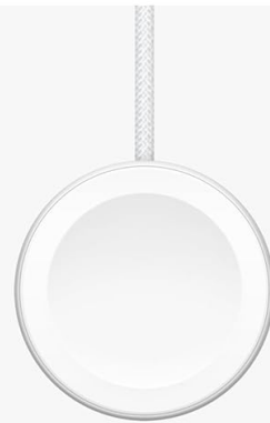
Image: A visual representation of the Apple Watch Ultra 2, an Ocean Band, and a USB-C Magnetic Fast Charging Cable, illustrating the package contents.