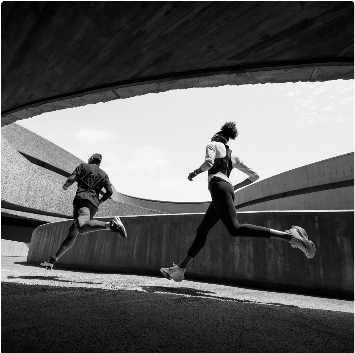
Image: Two people are shown running in an outdoor, urban environment, illustrating the watch's use for fitness and activity tracking.