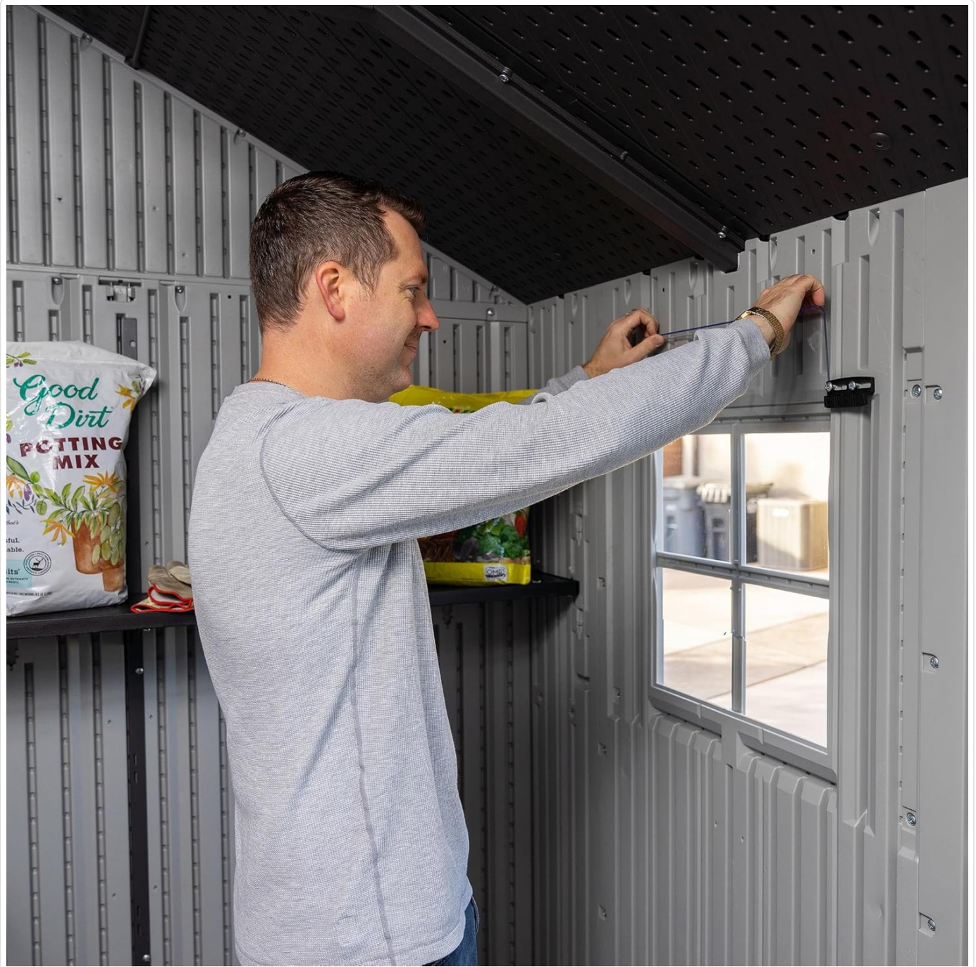
Image: A person adjusting a shelf inside the shed, illustrating the customizable storage options.