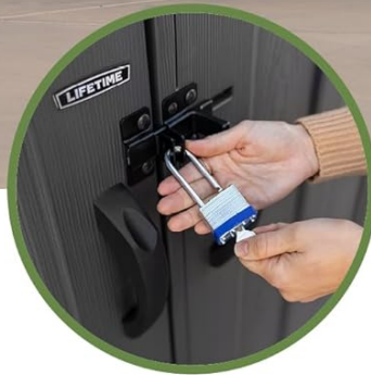
LOCKABLE DOORS (LOCK NOT INCLUDED)