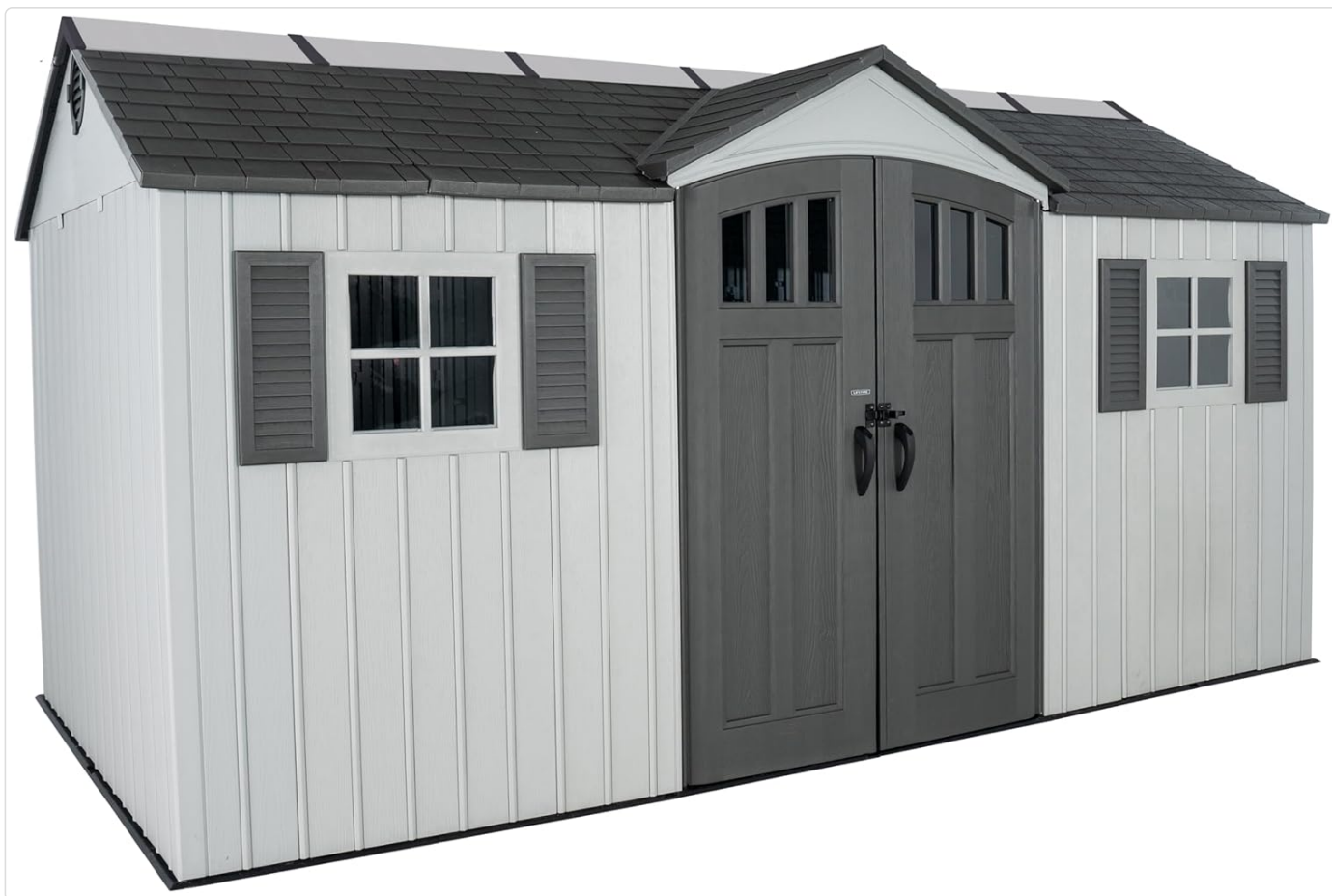
Image: The Lifetime 15 x 8 Foot Outdoor Storage Shed in Gray, showcasing its overall design and size.

Your browser does not support the video tag.