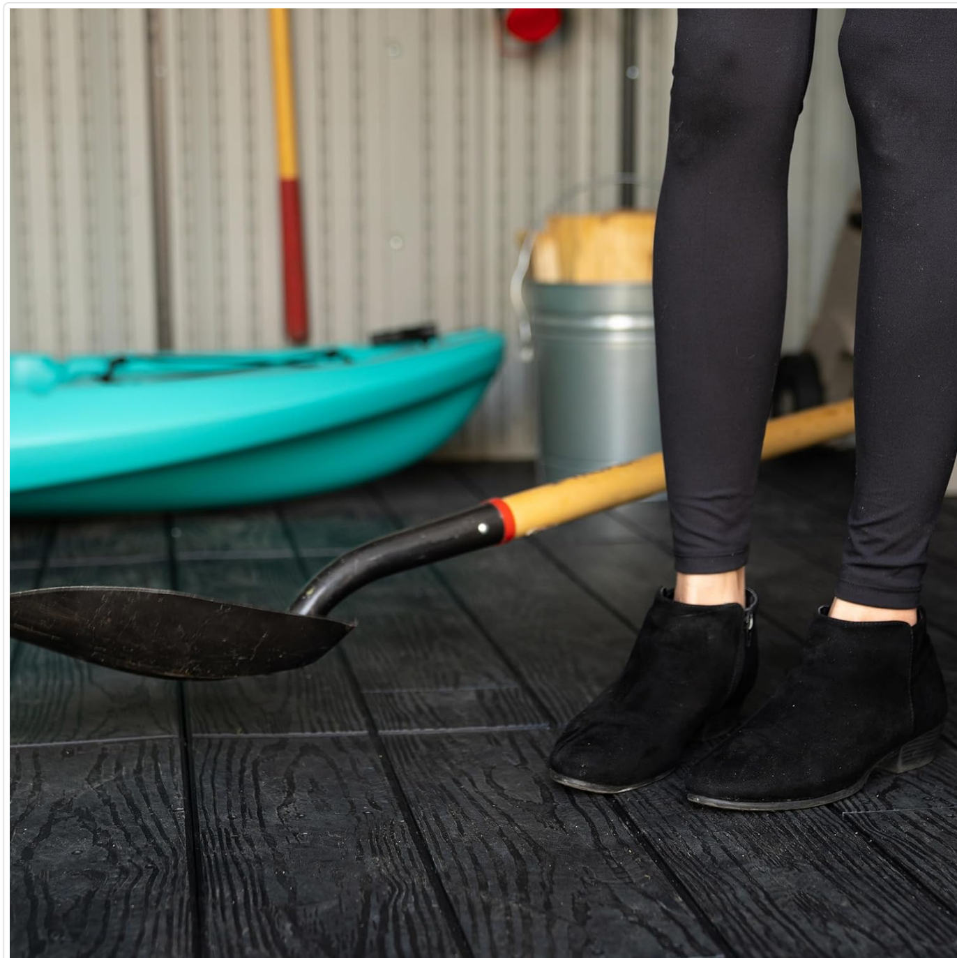
Image: A detailed view of the shed's impact-resistant, slip-resistant high-density polyethylene floor.