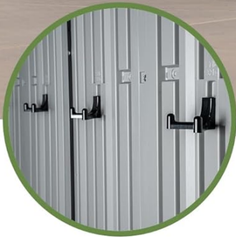
SNAP-IN WALL HOOKS (NO HARDWARE REQUIRED)