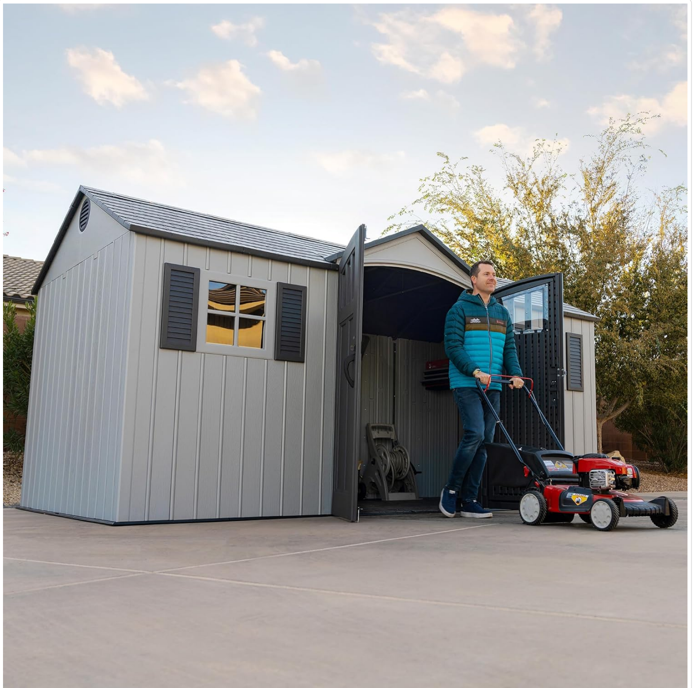
Image: A person easily moving a lawnmower in and out of the shed, demonstrating the wide door opening.