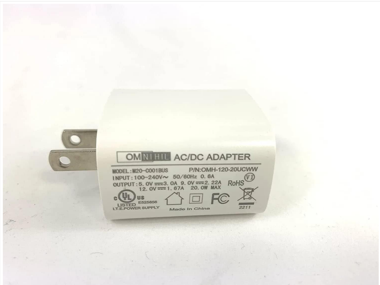
Bottom view of the OMNIHIL 20 Watt USB-C Charger Block, displaying product specifications and certifications.