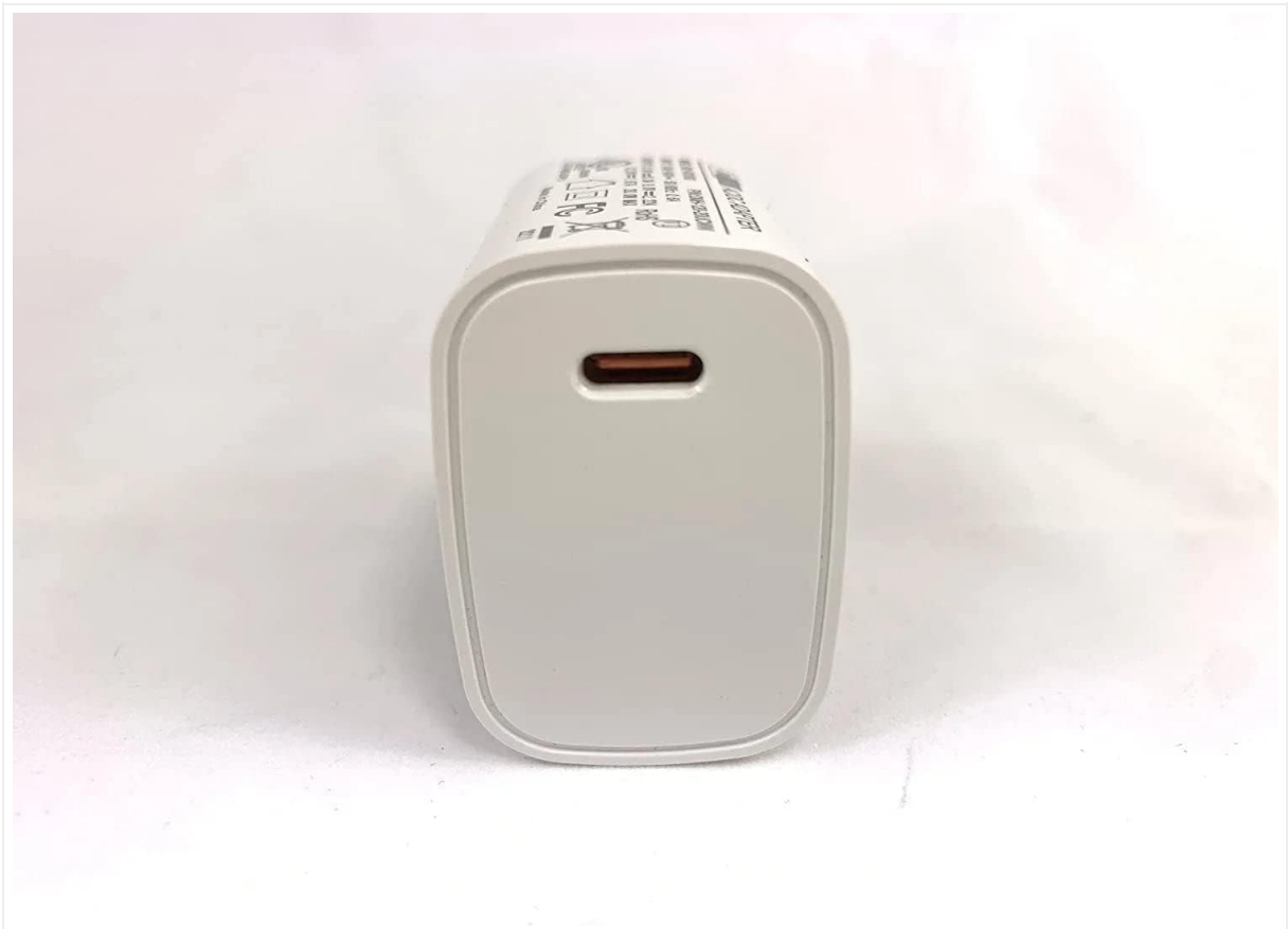
Side view of the OMNIHIL 20 Watt USB-C Charger Block, highlighting the USB-C output port.

The OMNIHIL 20 Watt USB-C Charger Block is a compact power adapter designed for efficient charging. It features a standard two-prong US plug for wall outlets and a single USB-C output port.