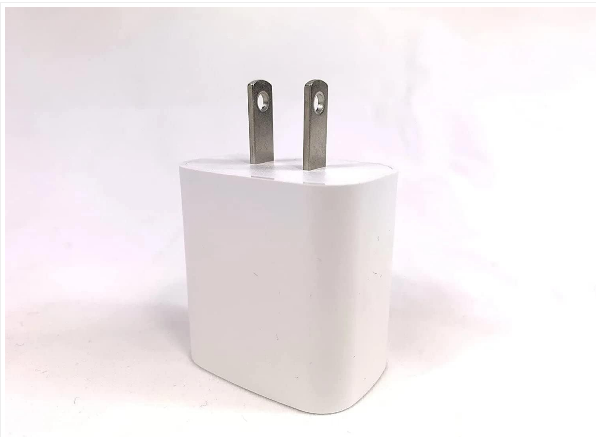
Front view of the OMNIHIL 20 Watt USB-C Charger Block, showing the two-prong US plug.

This manual provides essential instructions for the safe and effective use of your OMNIHIL 20 Watt USB-C Charger Block. This charger is designed to provide power to compatible electronic devices, including the Energizer MAX 20,000mAh Power Bank Model UE20044.