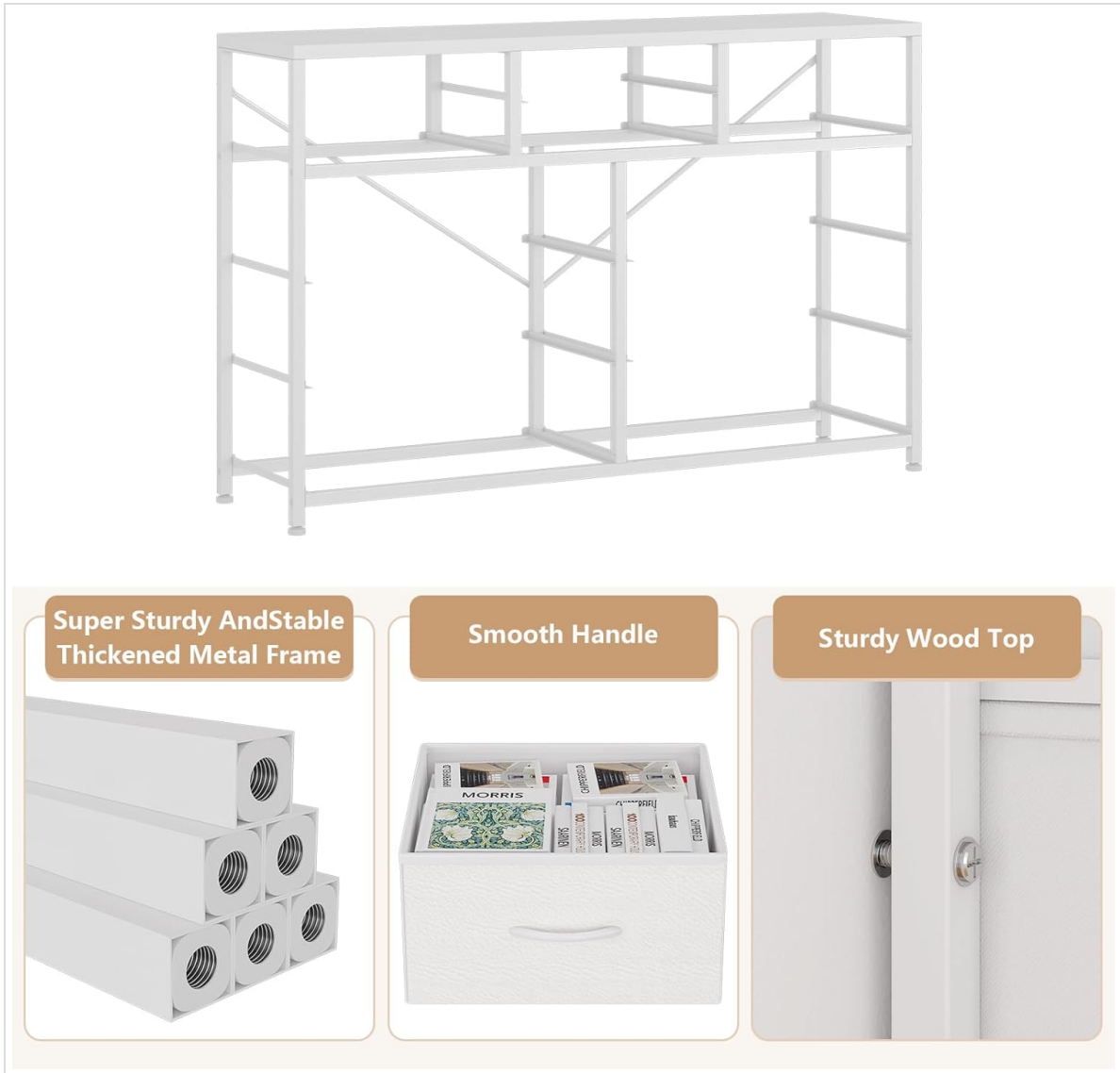
Image 5.1: The robust steel frame provides the primary support structure.