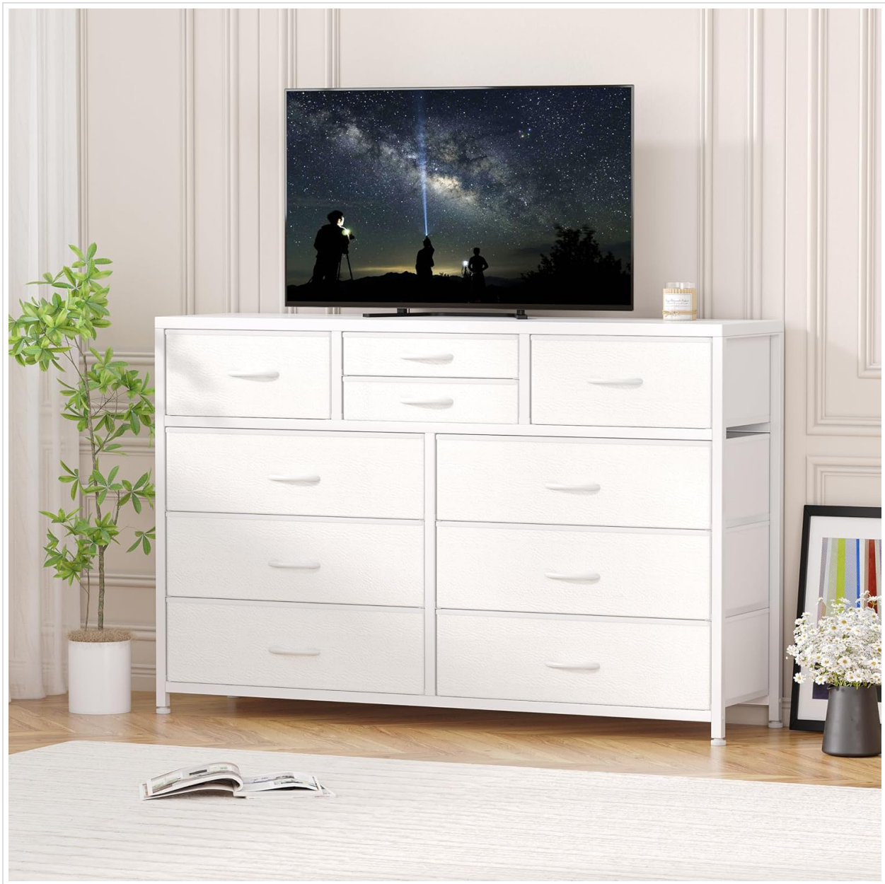
Image 1.1: The Jojoka 10-Drawer Dresser functioning as a TV stand.