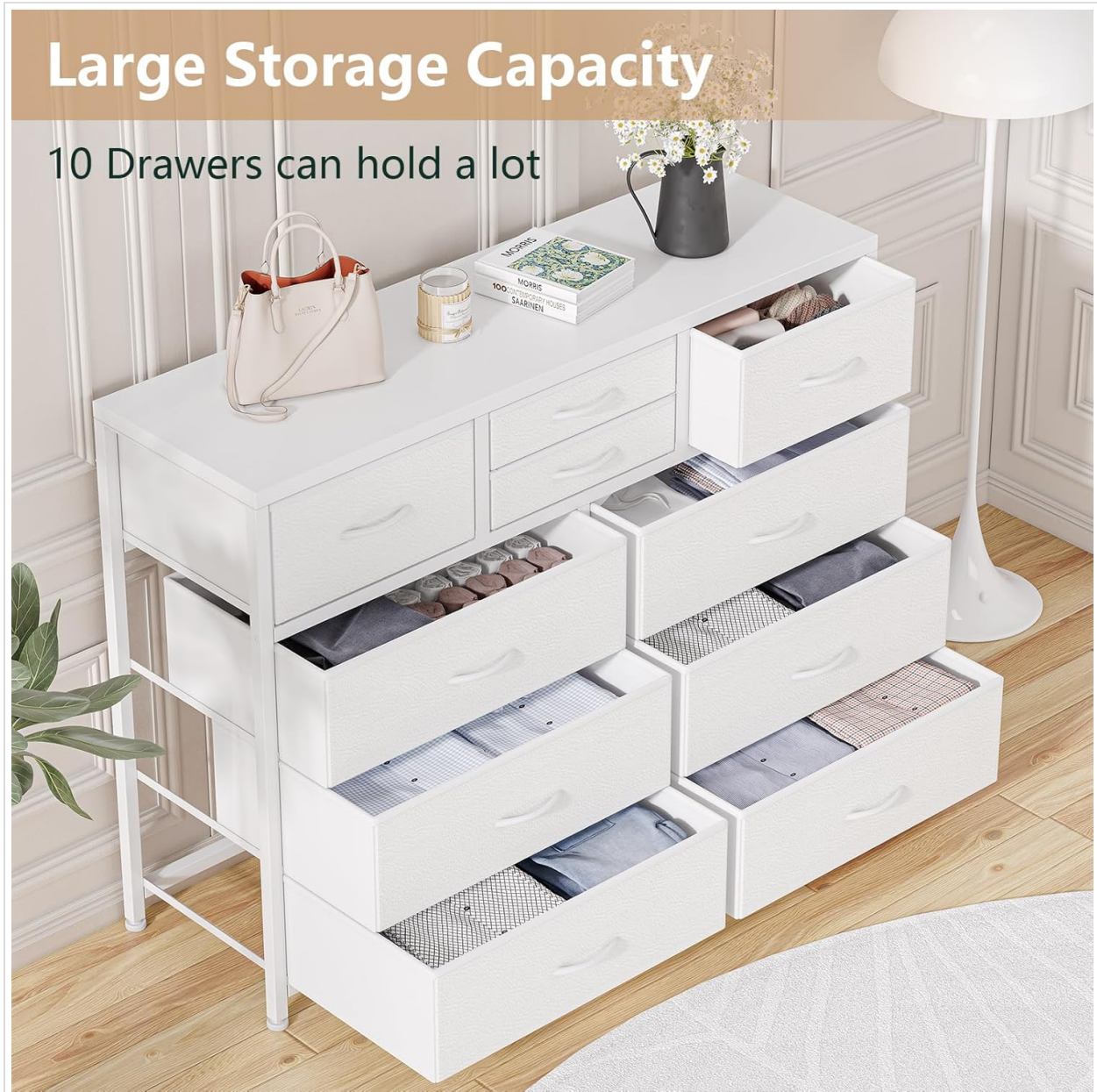
Image 6.1: The dresser's drawers offer ample storage for various items.