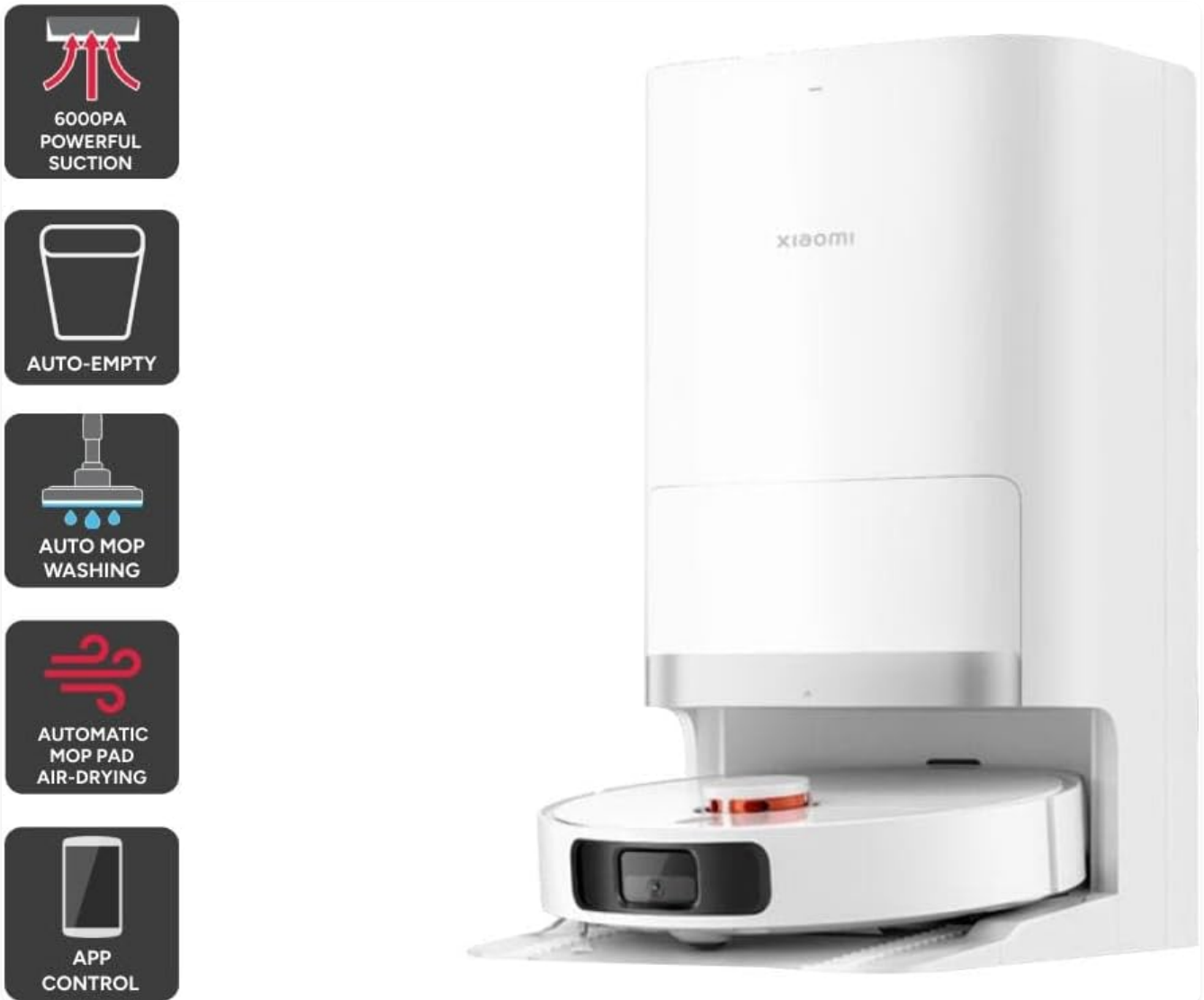
Figure 2: The all-in-one base station with its clean and dirty water tanks.

Carefully remove all components from the packaging. Place the all-in-one base station on a hard, flat surface against a wall, ensuring there is adequate clear space around it for the robot to dock and maneuver. Connect the power cable to the base station and plug it into a power outlet.