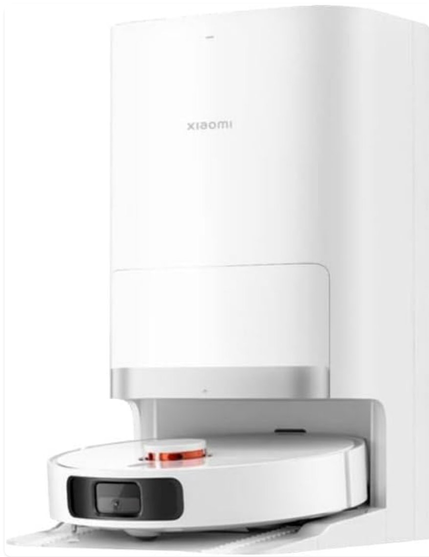
Figure 1: Xiaomi Robot Vacuum X20+ and its all-in-one base station.