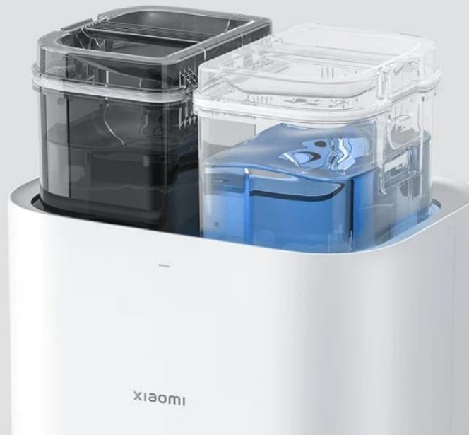
Figure 6: The 4L super-large-capacity water tank, minimizing refill frequency.

The 4L super-large-capacity water tank eliminates the need for frequent refilling, giving you more convenience. A water tank filled with water can support mopping for up to 280m 2 .