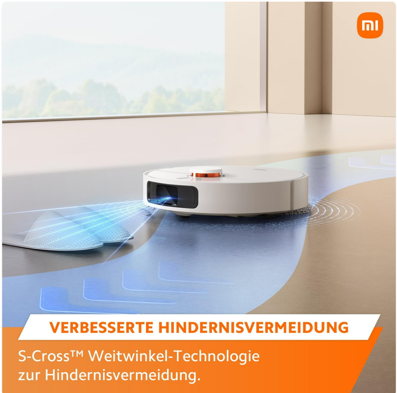
Figure 3: The robot vacuum employing LDS laser navigation for intelligent mapping.

The robot utilizes LDS Laser Navigation to accurately map your home and plan efficient cleaning paths. Its advanced obstacle avoidance technology helps it navigate around furniture, pet bowls, and other common household items, minimizing collisions and ensuring thorough coverage.