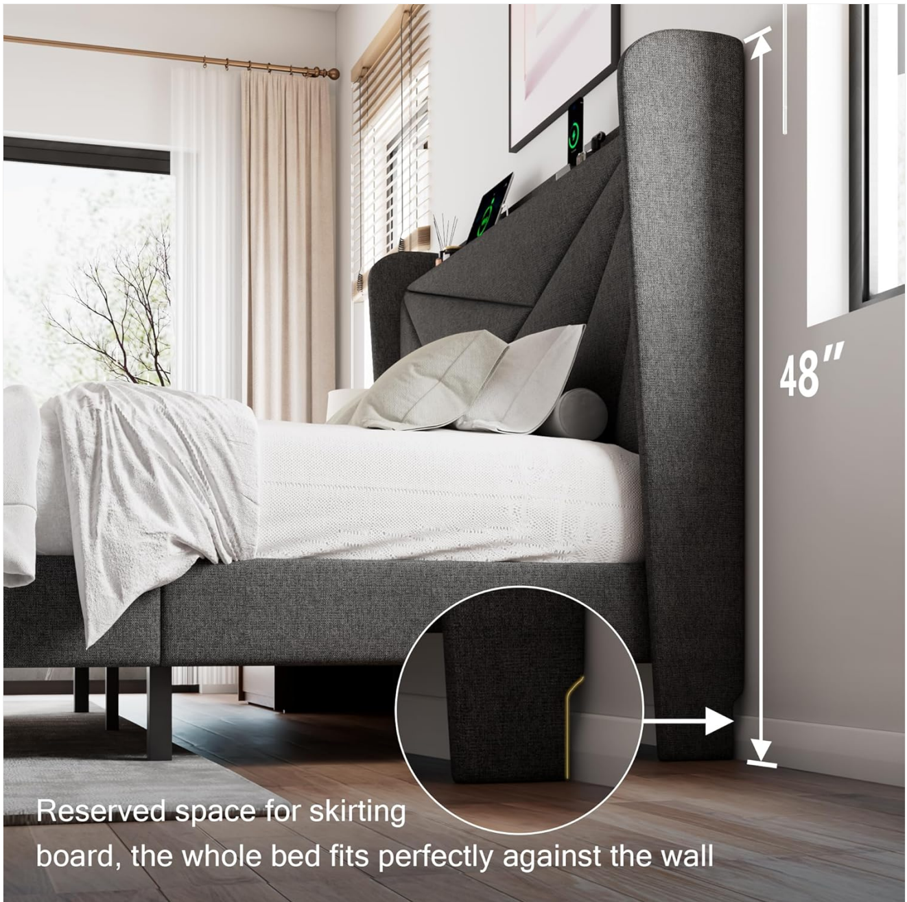
Image 5.3: Detail highlighting the design feature that accommodates skirting boards, ensuring the bed frame can be placed flush against a wall.