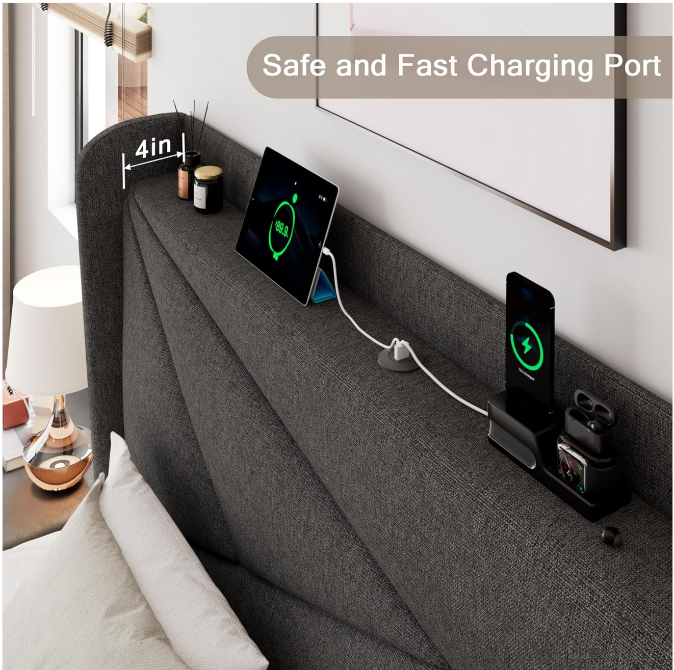
Image 6.2: The storage headboard displaying its capacity for holding personal items and small decorations.