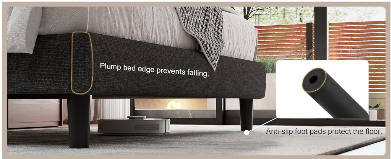
Image 4.1: Visual representation of the bed frame's key specifications, including dimensions and features.