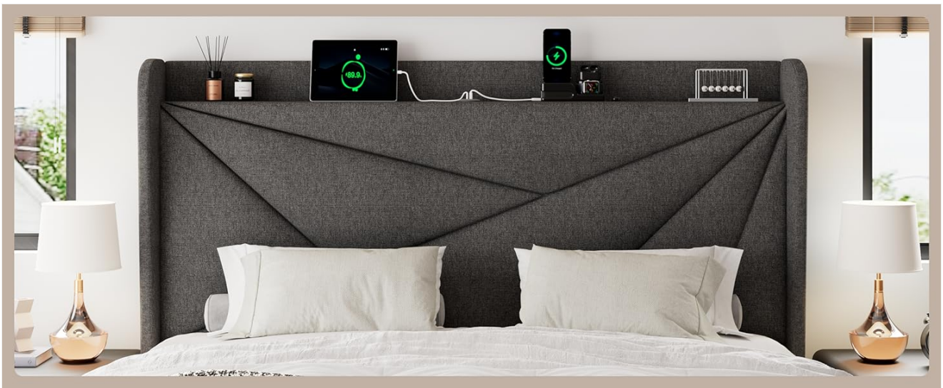
Image 6.1: The headboard's charging station in use, demonstrating its convenience for powering electronic devices.