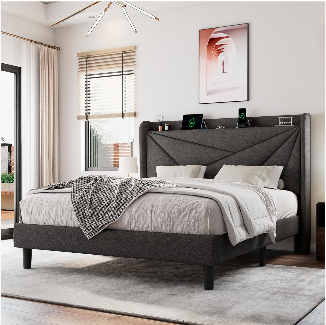
Image 1.1: Overview of the Einhorn Full Size Upholstered Bed Frame, showcasing its dark grey fabric, integrated headboard storage, and charging ports.