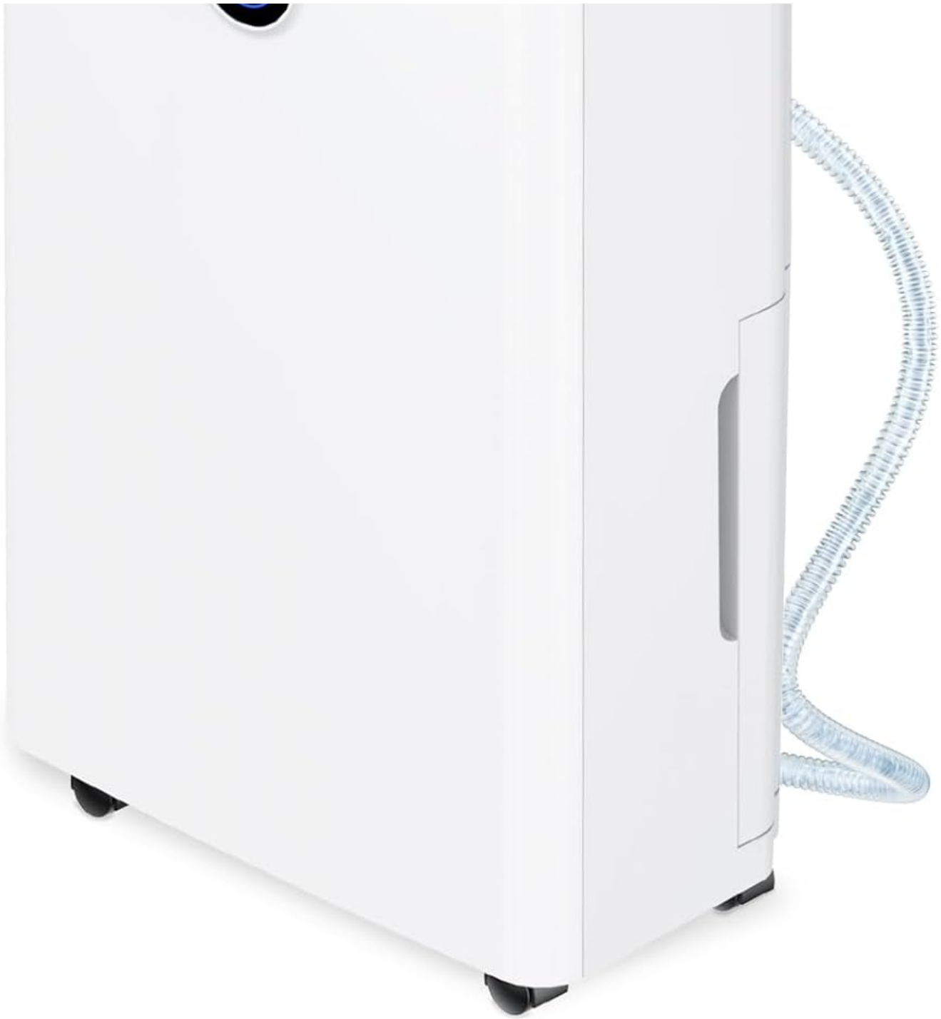
Figure 1: Front view of the OGACFO Dehumidifier with the top air outlet open.

This dehumidifier is capable of removing 50-70 pints of moisture per day, making it suitable for areas up to 4,500 sq. ft. It features smart dehumidification, an easy-drain water tank, and an auto on/off timer for convenient operation.