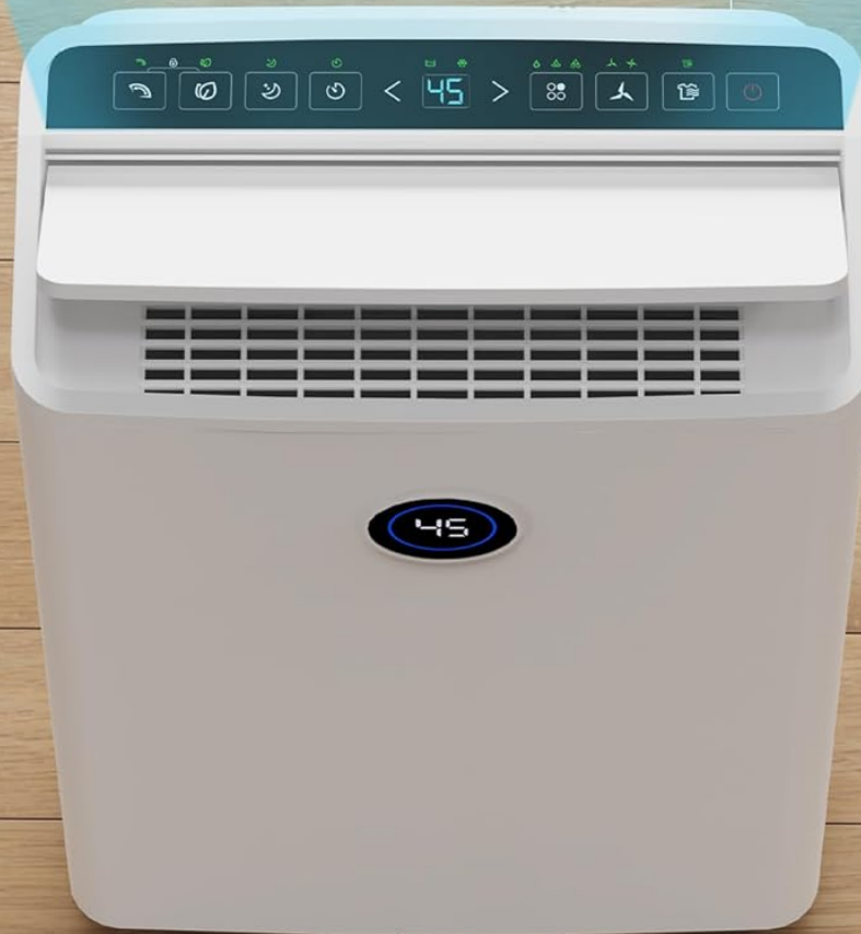
Figure 4: Smart Control Panel with various function buttons.