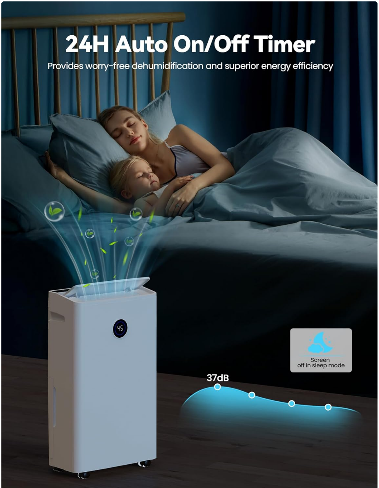
Figure 6: The 24-hour timer and sleep mode provide quiet, energy-efficient operation.

Provides worry-free dehumidification and superior energy efficiency