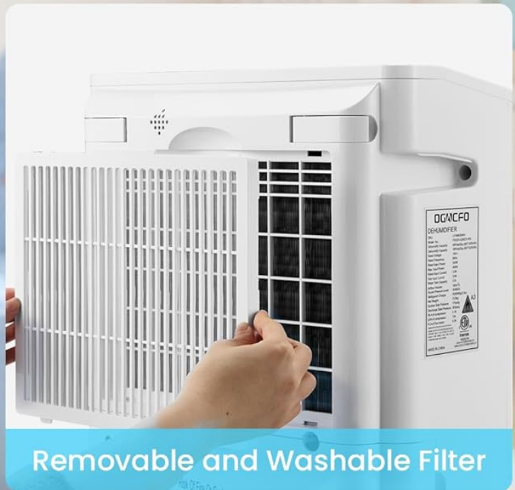
Removable and Washable Filter