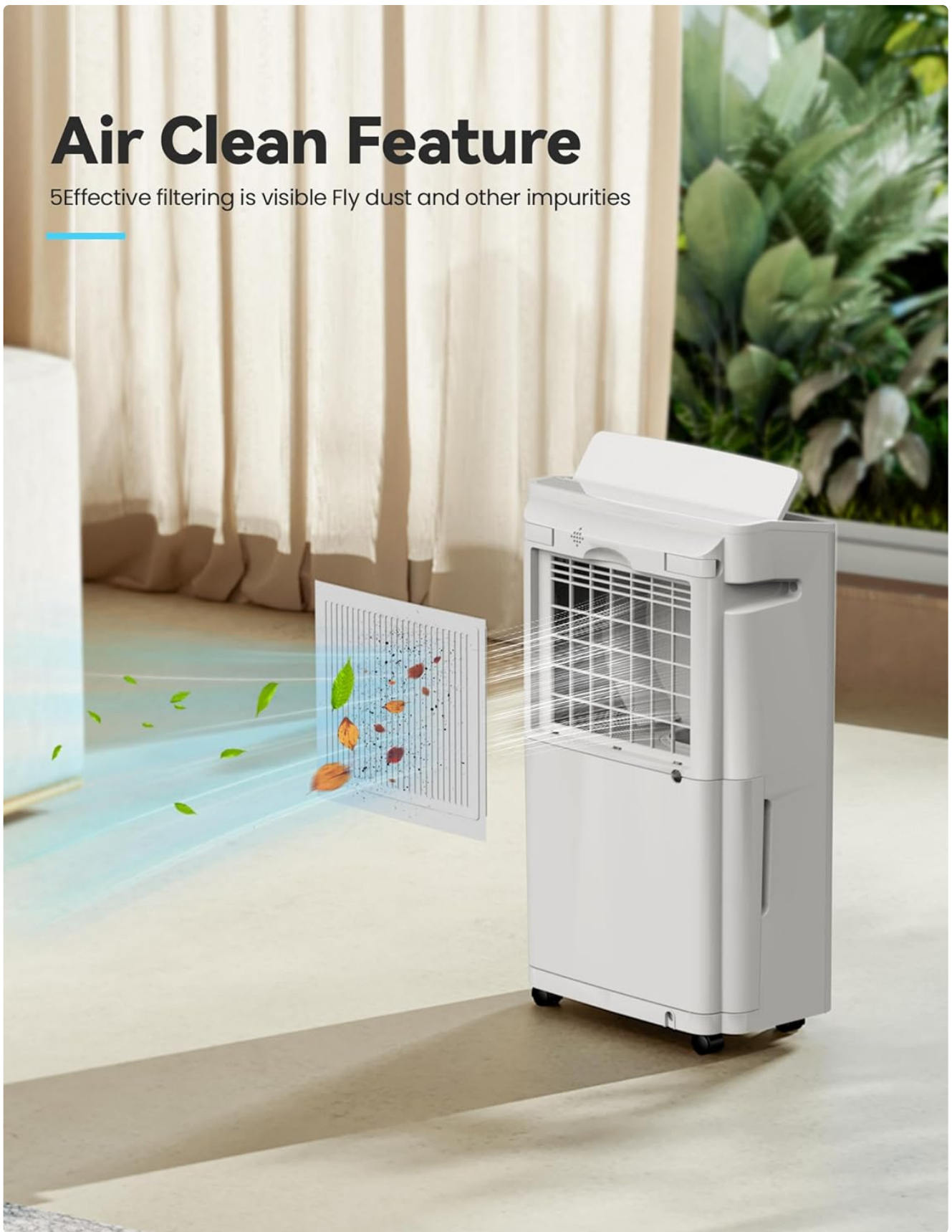
Figure 5: The Air Clean feature effectively filters airborne particles.

5Effective filtering is visible Fly dust and other impurities