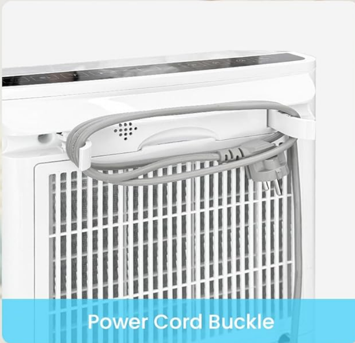
Power Cord Buckle

Carefully designed to facilitate life everywhere