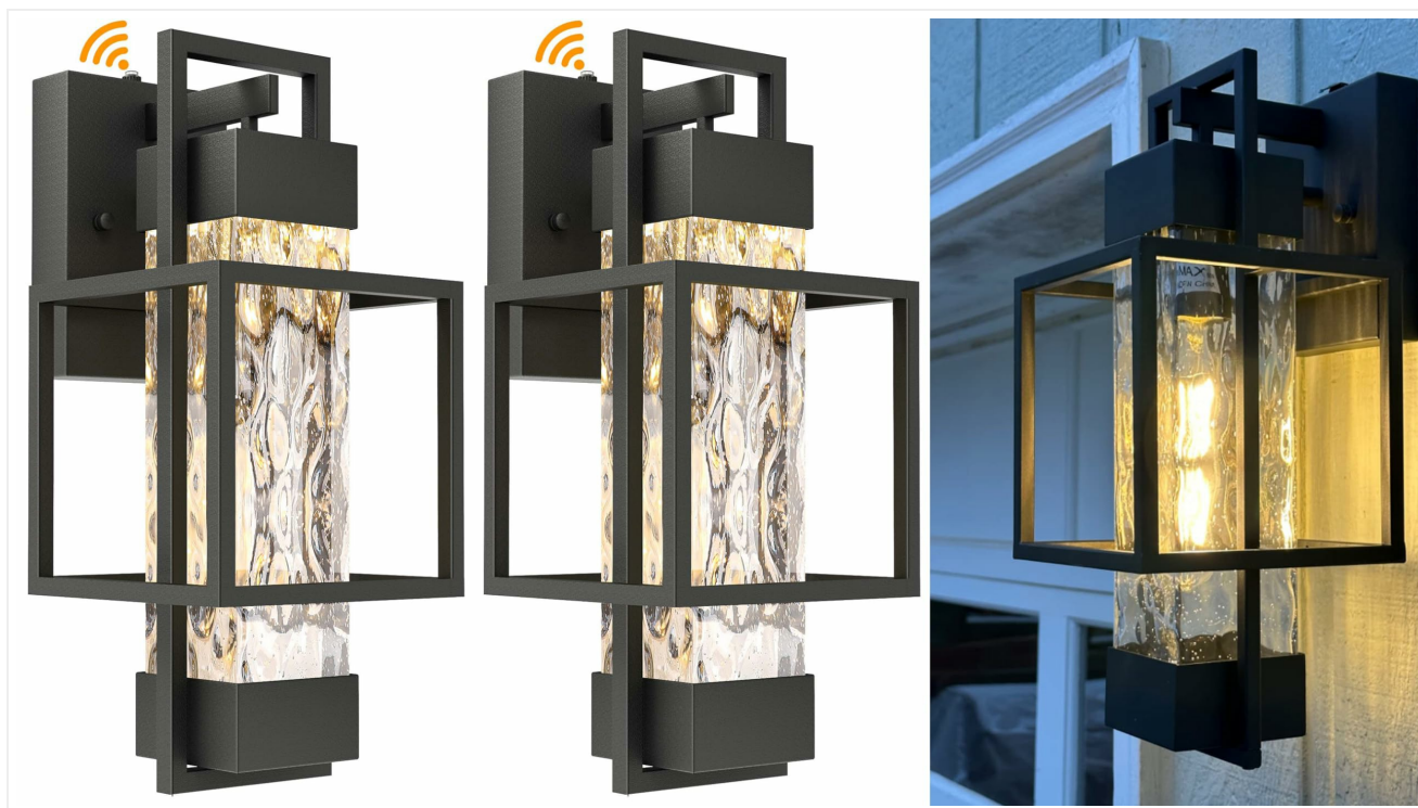
Image 1.1: PARTHONER Outdoor Wall Light with integrated dusk to dawn sensor.

This manual provides essential information for the safe installation, operation, and maintenance of your PARTHONER Outdoor Wall Lights. Please read these instructions thoroughly before installation and retain them for future reference.