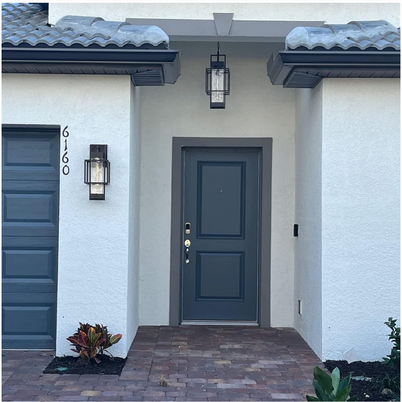
Image 6.1: Example of the outdoor wall light installed on a residential exterior.

6. Restore Power: Turn the power back on at the circuit breaker.