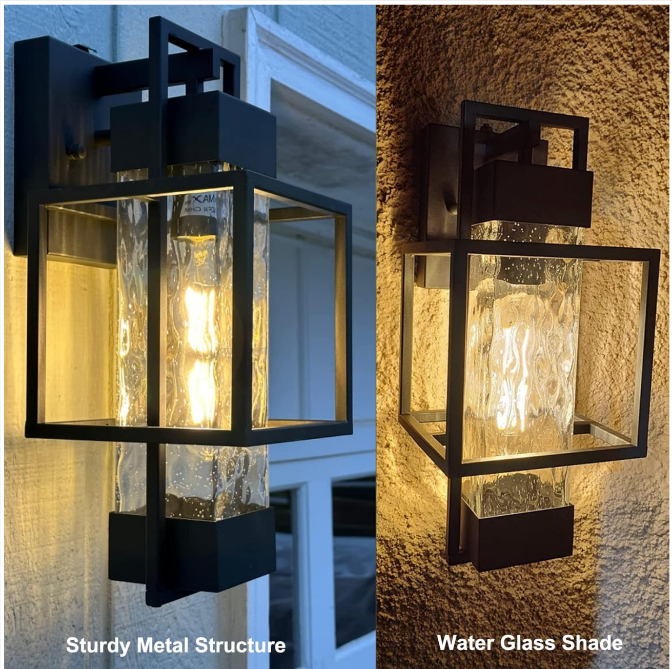
Image 4.2: Detail of the sturdy metal structure and decorative water glass shade.