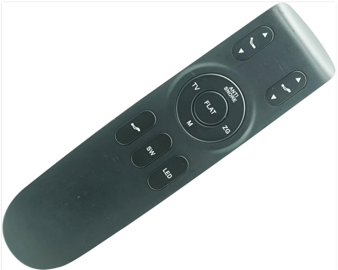
Figure 3: Overview of the remote control buttons and their functions.