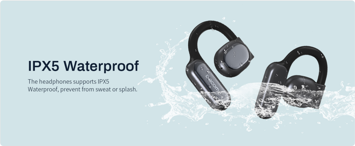
Image: The DACOM H11 headphones shown with water splashes, highlighting their IPX5 waterproof rating, which protects against sweat and splashes but not submersion.