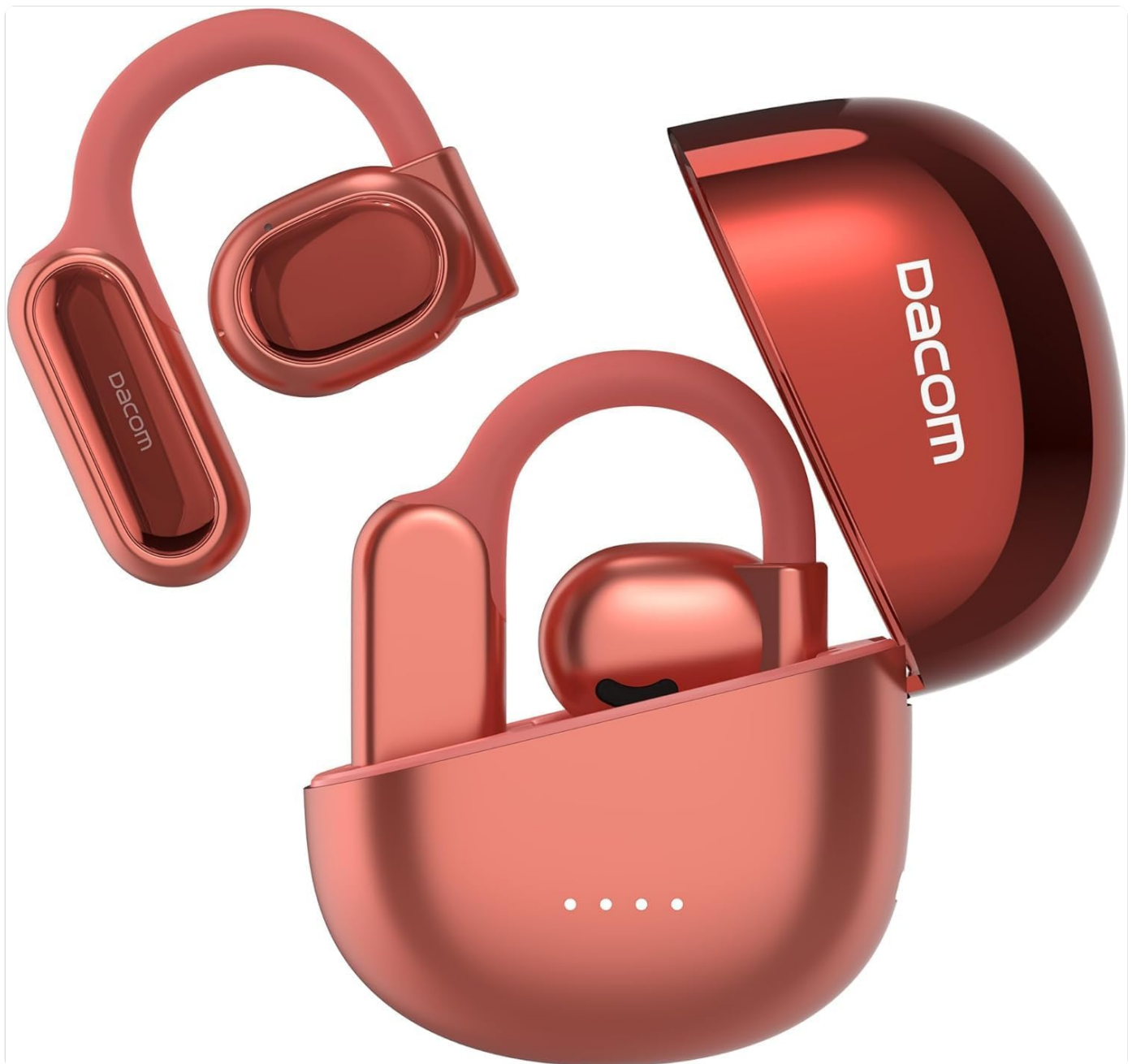
Image: DACOM Open Ear Headphones H11 in their charging case, showcasing the open-ear design and the compact charging solution.