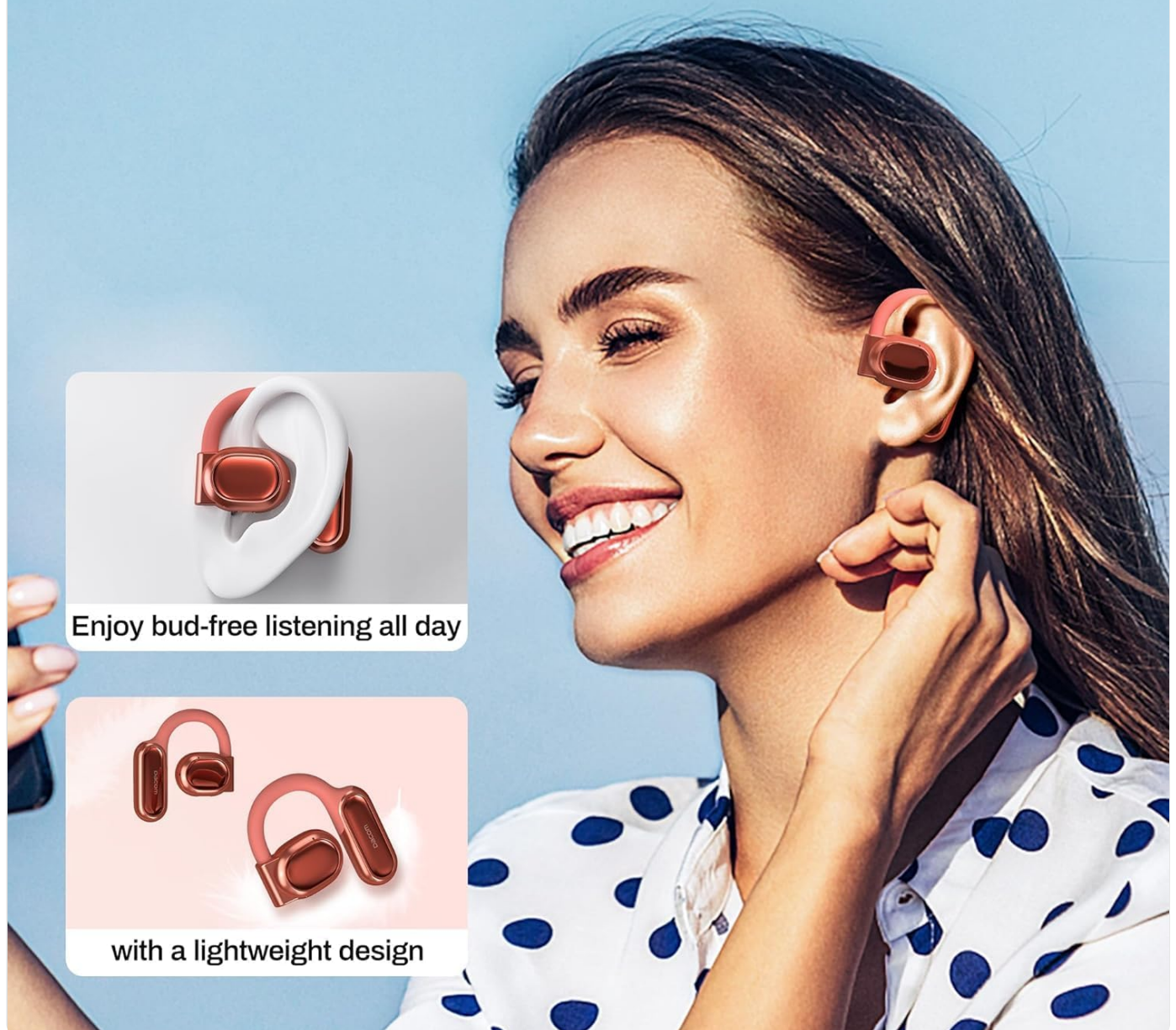
Image: A person wearing the DACOM H11 open-ear headphones, demonstrating the comfortable, bud-free listening experience and lightweight design.