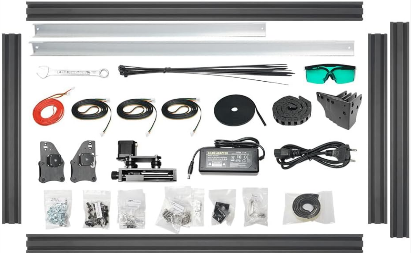
Figure 3: Contents of the FEUNGSKE Laser Engraver Machine package. This image displays all the components included in the box, such as aluminum profiles, various cables, motors, brackets, power adapter, safety glasses, and hardware for assembly.