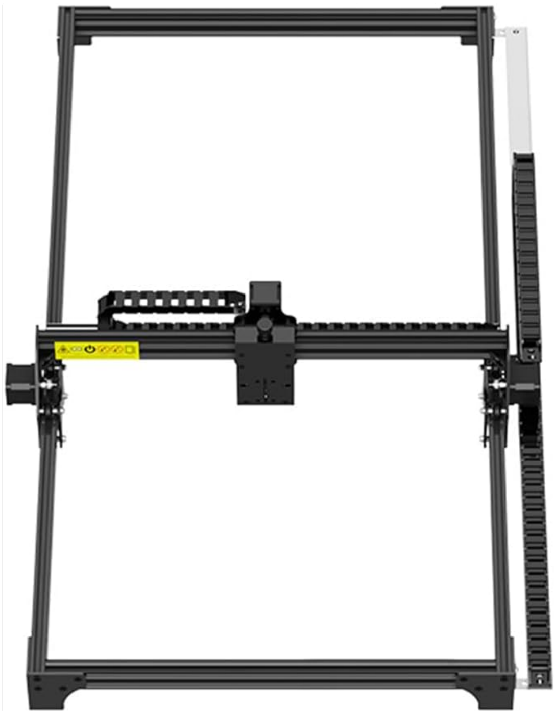
Figure 1: Overview of the FEUNGSMAKE Laser Engraver Machine frame. This image displays the sturdy 2040 aluminum frame, which forms the base structure of the engraving and cutting machine. It highlights the open design, ready for the integration of a laser module and control board.