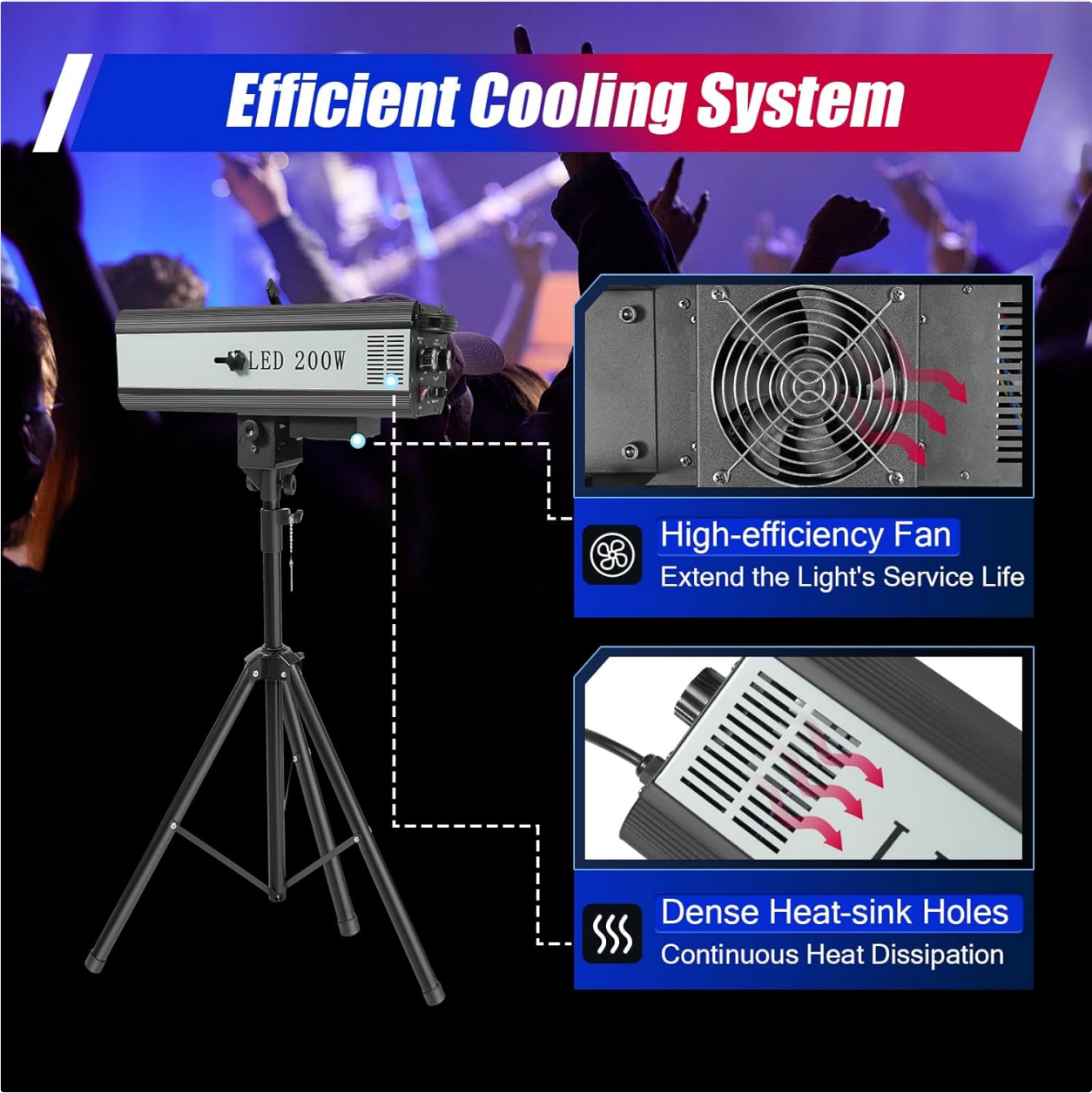
Image: Illustration of the efficient cooling system, highlighting the fan and heat-sink holes for continuous heat dissipation.

it with a fuse of the same type and rating if necessary. (Refer to specifications for fuse type).