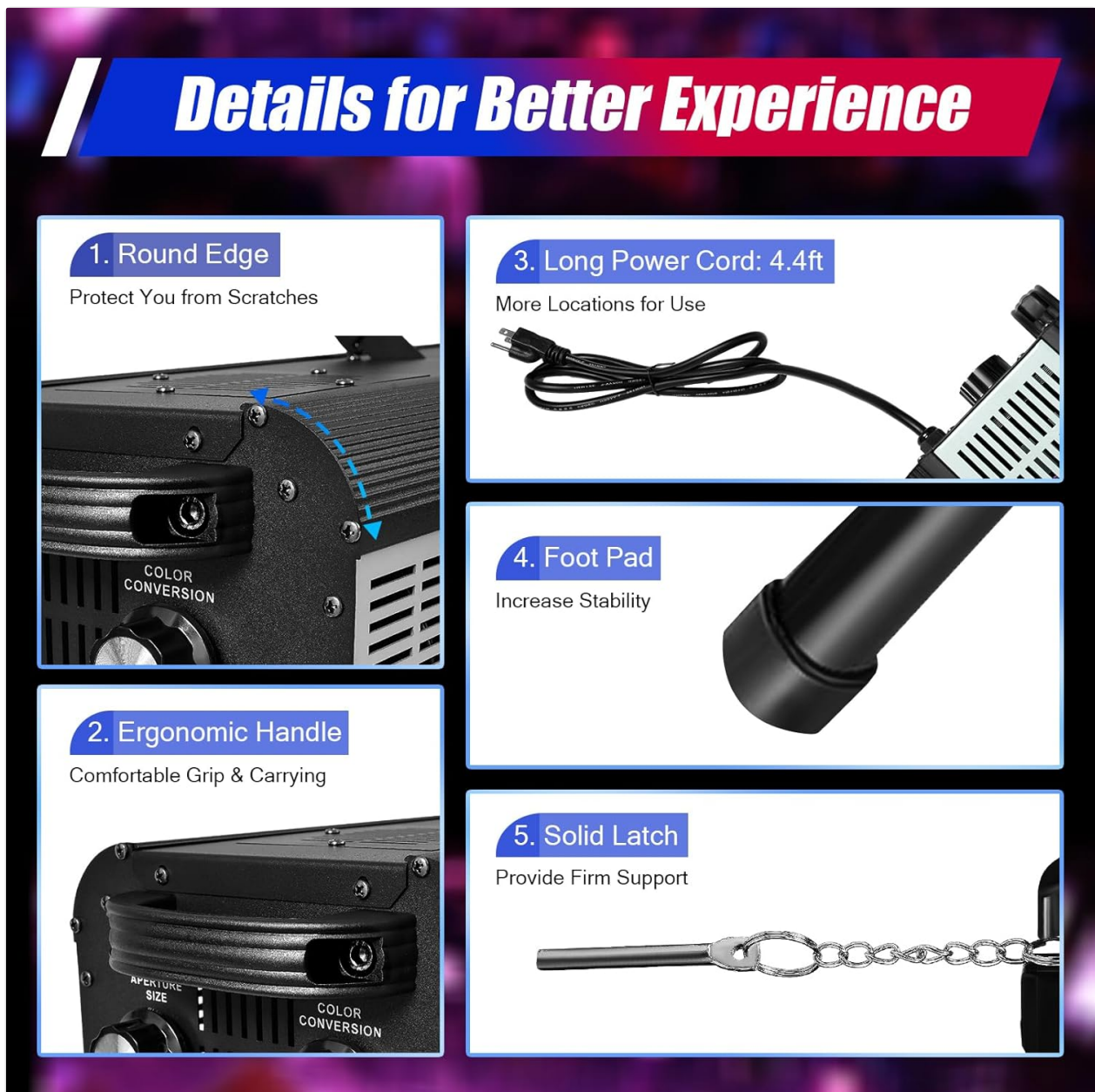
Image: Detailed view highlighting features like round edges, ergonomic handle, long power cord, foot pad, and solid latch for enhanced user experience.

Image: The LOYALHEARTDY 200W LED Follow Stage Spot Light demonstrating its powerful illumination and high-precision glass lens.