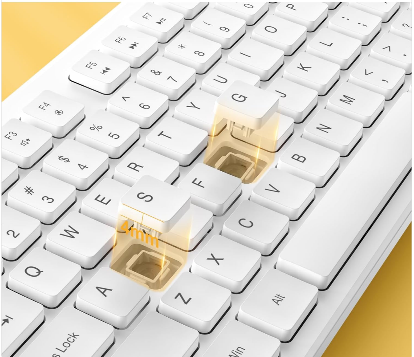
Figure 3.3.1: Shorter keystroke distance for responsive typing.

Shorter keystroke distance makes typing more responsive, smooth and soft