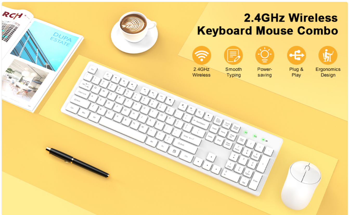
Figure 4.2.1: Auto power-saving and wake-up methods.