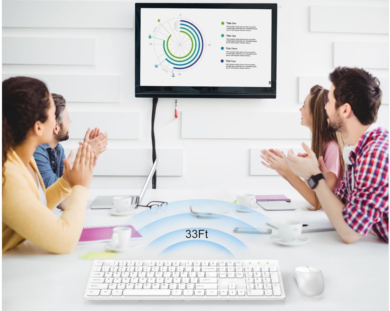
Figure 2.3.2: The 2.4GHz wireless connection provides a stable signal up to 33 feet (10 meters).