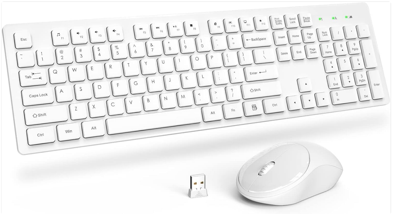
Figure 2.3.1: The Trueque wireless keyboard and mouse with its USB receiver.