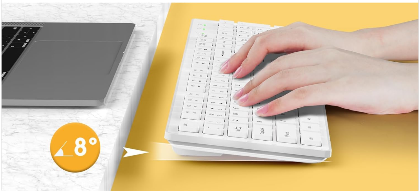
Figure 3.3.2: Ergonomic design for reduced muscle strain and comfort.

The mouse operates with 100% quiet clicks, ensuring no disruptive sounds. The keyboard is designed to be over 90% quieter than similar keyboards, allowing for a more peaceful working environment.