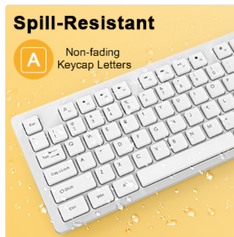
Figure 4.3.1: Spill-resistant keyboard design.

The keyboard features a spill-resistant design, which helps protect against accidental liquid spills. The keycap letters are also designed to be non-fading, ensuring long-term legibility.