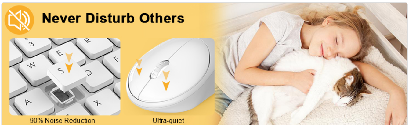
Figure 3.3.3: Quiet operation for minimal disturbance.

The mouse operates with 100% quiet clicks, ensuring no disruptive sounds. The keyboard is designed to be over 90% quieter than similar keyboards, allowing for a more peaceful working environment.