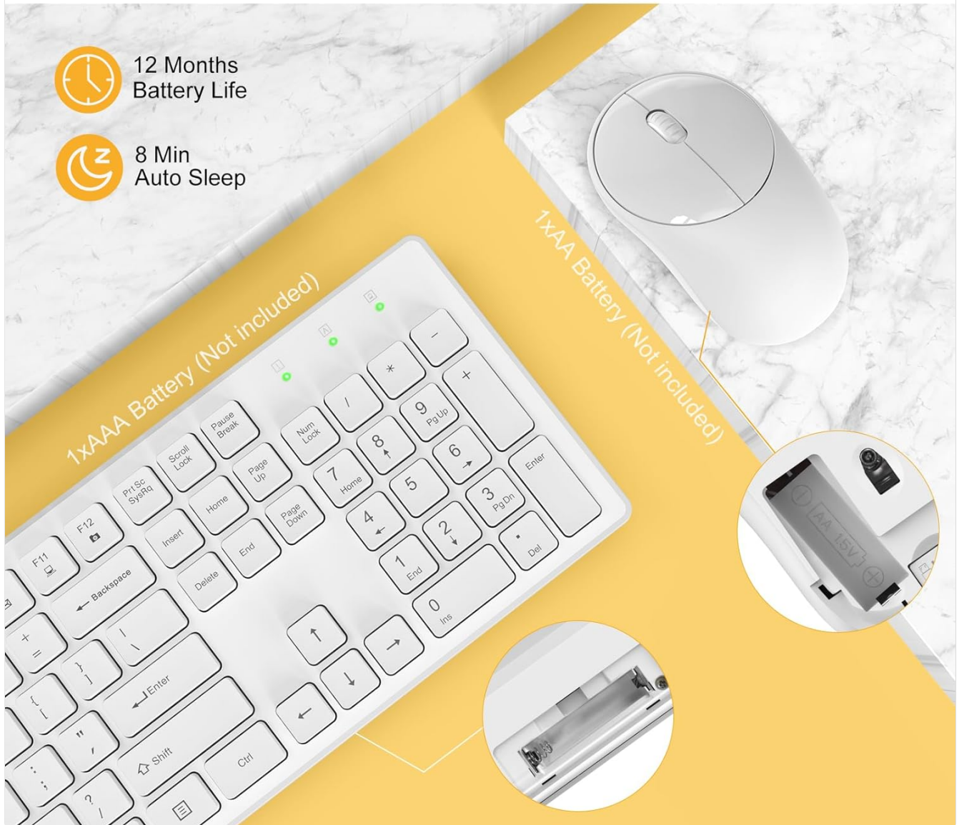
Figure 2.2.1: Battery installation for the keyboard and mouse. Note the USB receiver stored inside the mouse.

Note: Type or double click any button to wake up the sleep mode