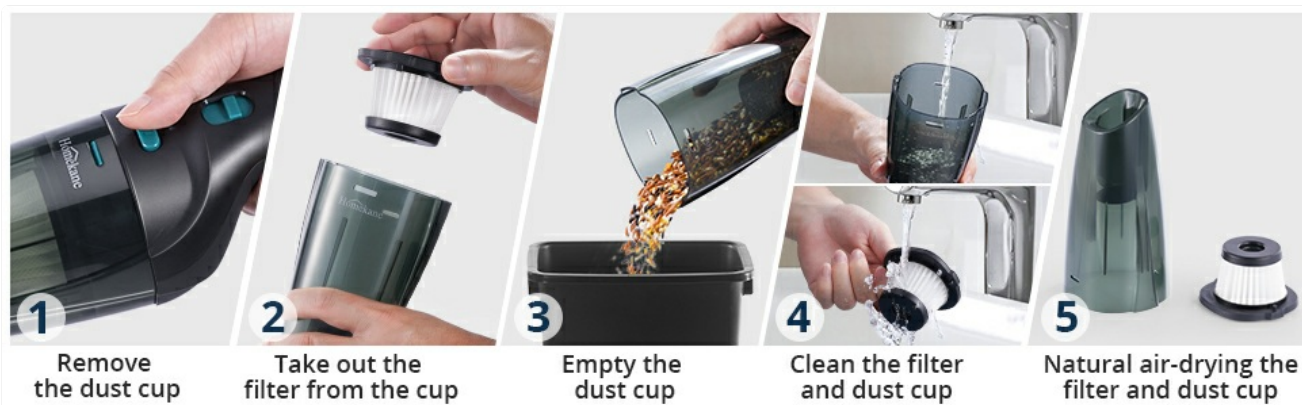
Visual steps for removing, emptying, cleaning, and air-drying the dust cup and filter.