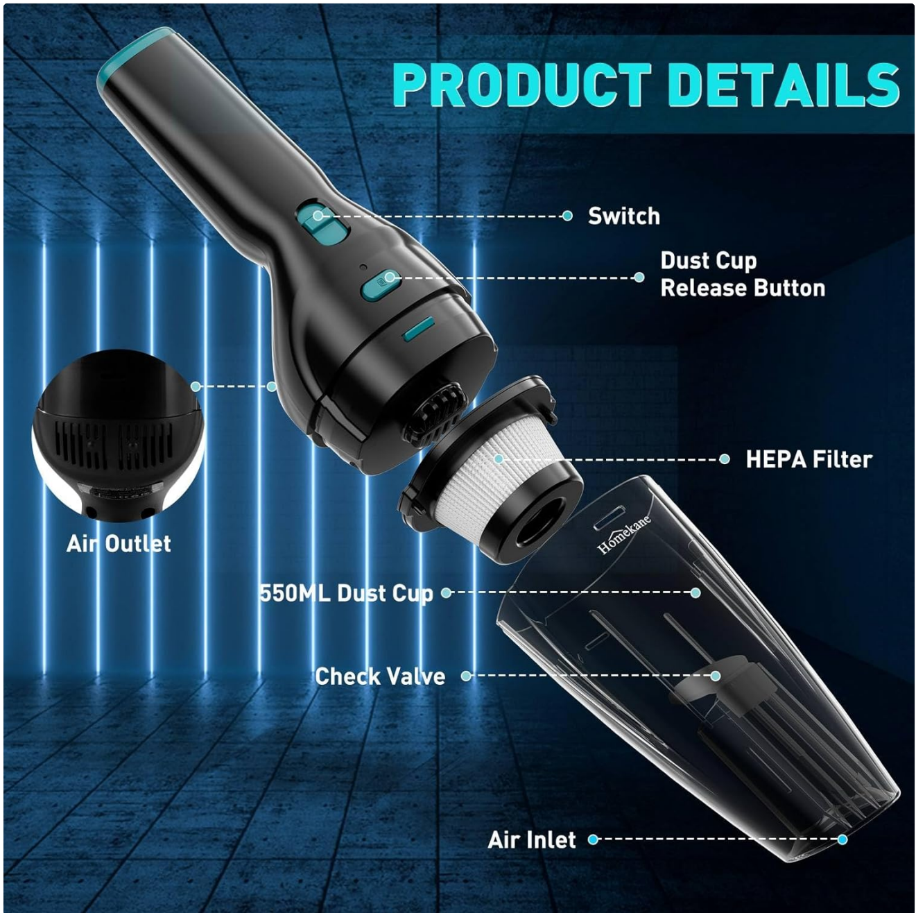
Detailed view of the vacuum's components, including the switch, dust cup, HEPA filter, and air vents.