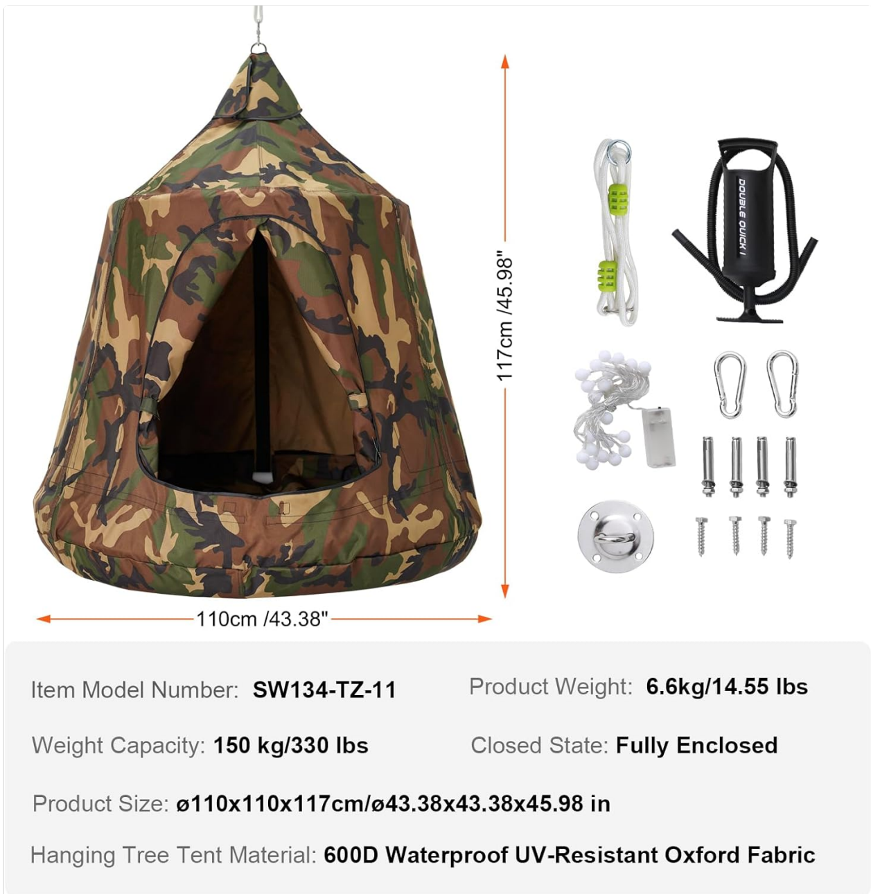
Figure 2.1: All components included in the package.