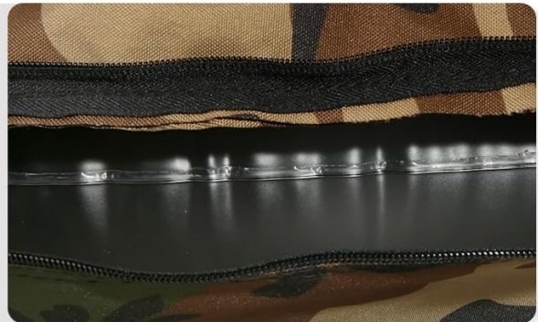
Figure 5.3: LED light string for ambiance.