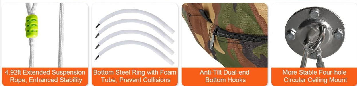
Figure 4.3: Detailed view of suspension rope, foam tubes, bottom hooks, and ceiling mount.