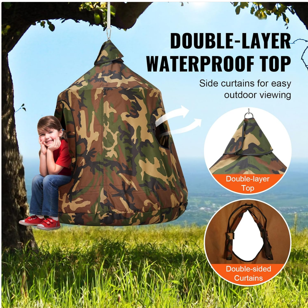
Figure 5.2: Dual-layer top and side curtain functionality.