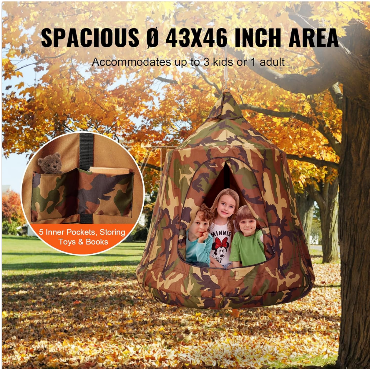
Figure 5.1: Spacious interior with storage pockets.