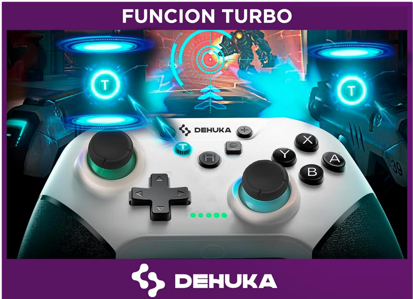
Image: The DEHUKA controller with an overlay highlighting the 'T' (Turbo) button and its effect in a game scene, indicating rapid input.

To deactivate, repeat the process: hold 'Turbo' and press the assigned action button again.