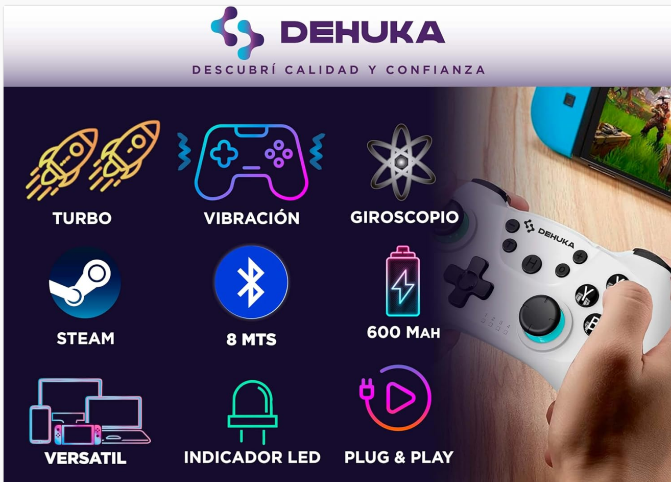
Image: An infographic summarizing key features of the DEHUKA controller, including Turbo, Vibration, Gyroscope, Steam compatibility, 8-meter range, 600mAh battery, versatility, LED indicator, and Plug & Play functionality.