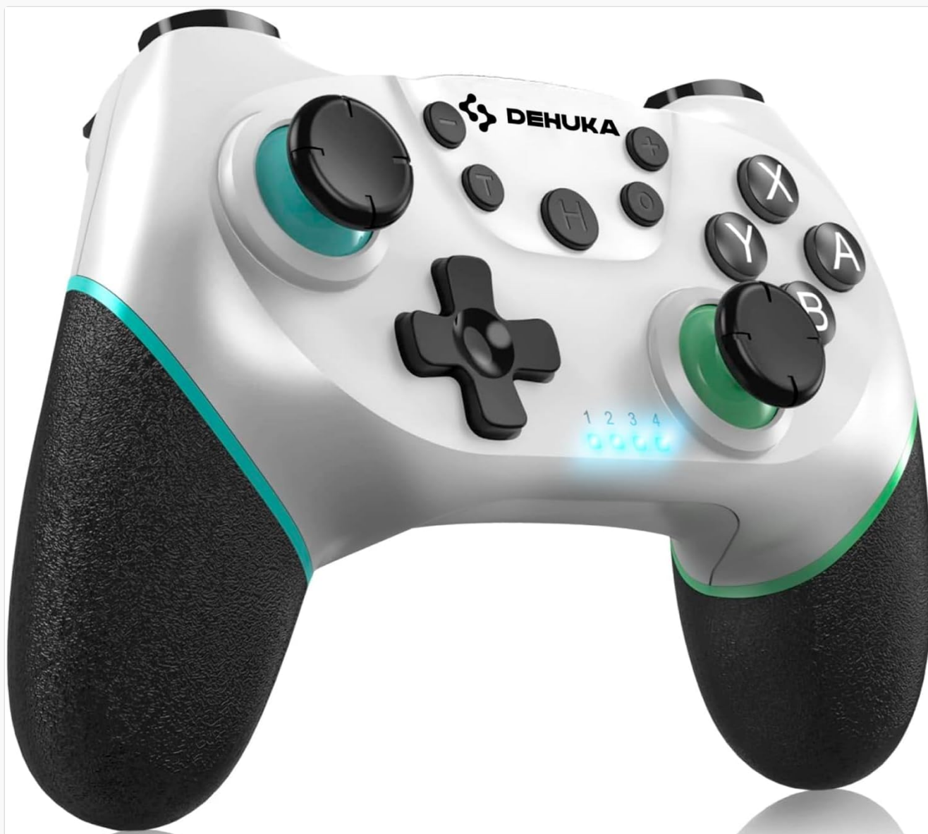
Image: Front view of the DEHUKA Wireless Gaming Controller, showcasing its white and black design with teal and green accents on the joysticks and grips. The controller features a D-pad, ABXY buttons, dual analog sticks, and central function buttons.

The DEHUKA Wireless Gaming Controller features a standard layout with ergonomic grips, ensuring comfort during extended gaming sessions. Key components include dual analog sticks, a D-pad, action buttons (A, B, X, Y), shoulder buttons (L, R, ZL, ZR), and special function buttons like Turbo, Home, and Screenshot.