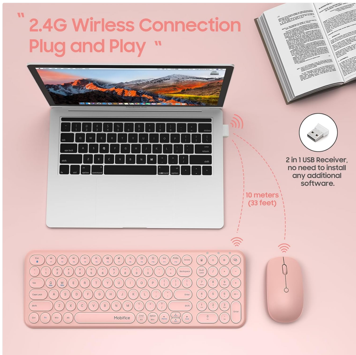
Image: This image demonstrates the 2.4GHz wireless connection setup, showing the USB receiver plugged into a laptop, enabling both the keyboard and mouse to function wirelessly within a 10-meter (33 feet) range.

Your browser does not support the video tag.