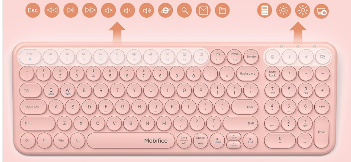
Image: This image highlights the 15 combinations of multi-media shortcuts available on the Mobifice K101B keyboard, providing easy access to music, volume control, homepage, email, and more.

Easy access to music, volume control, homepage, email and more.