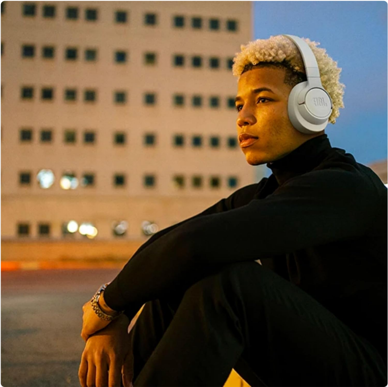
A person wearing the white JBL Tune 720BT headphones, demonstrating their fit and style.