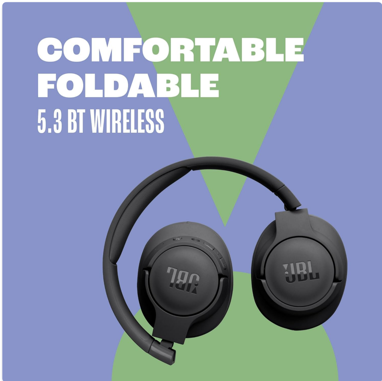
The JBL Tune 720BT headphones in black, shown in their folded configuration, highlighting their portable design.

These headphones are not water resistant . Avoid exposure to water, rain, or excessive moisture to prevent damage.