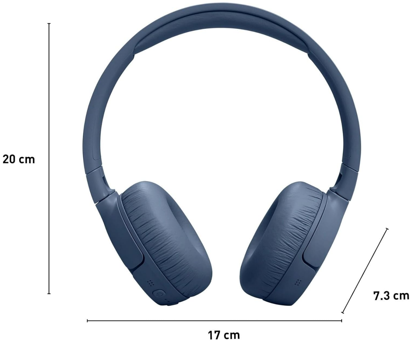
Image: A close-up view of the JBL Tune 670NC headphones, highlighting the control buttons on the ear-cup.