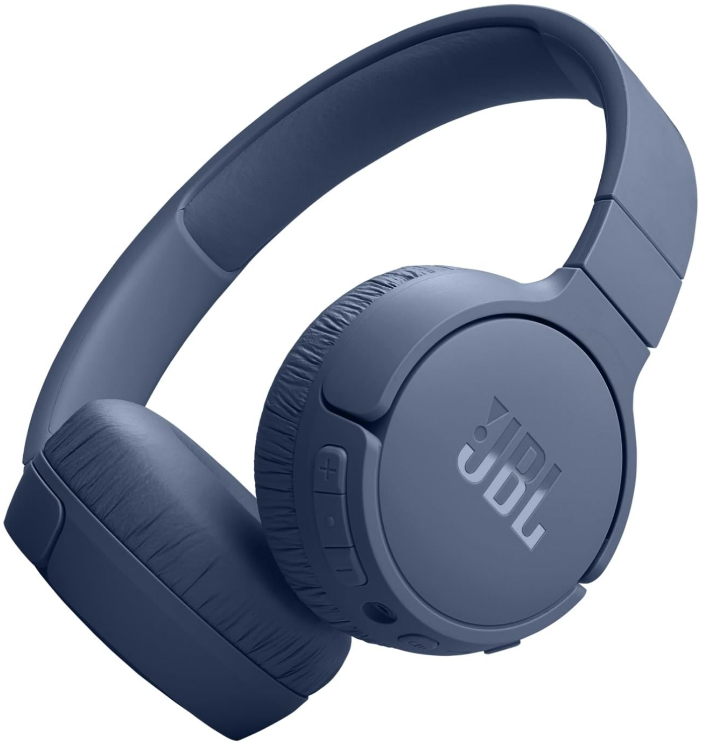
Image: A pair of blue JBL Tune 670NC wireless on-ear headphones, showcasing their sleek design.