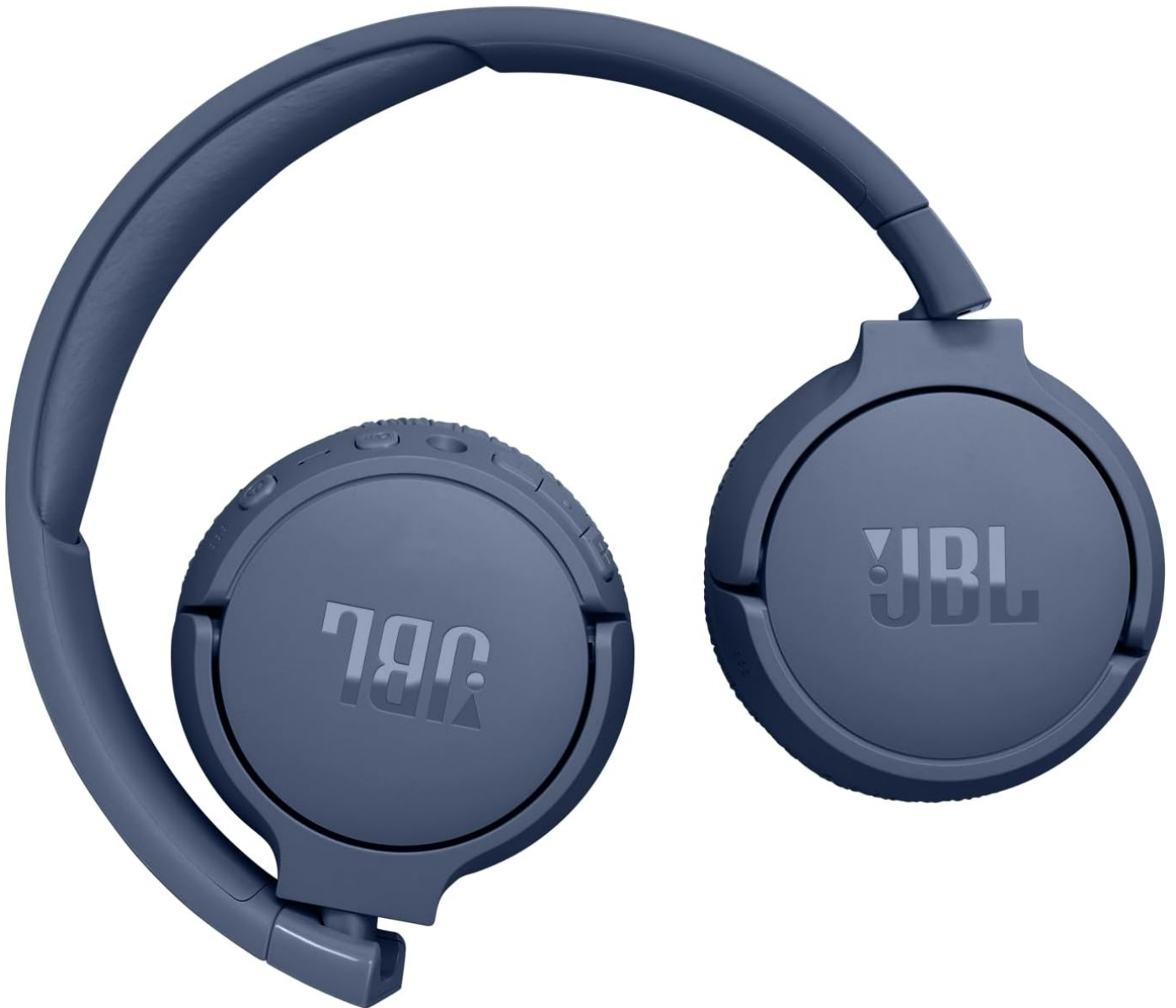
Image: Blue JBL Tune 670NC headphones shown in their folded position, demonstrating their portability.

The JBL Tune 670NC headphones are designed to be lightweight, comfortable, and foldable for easy portability and storage.