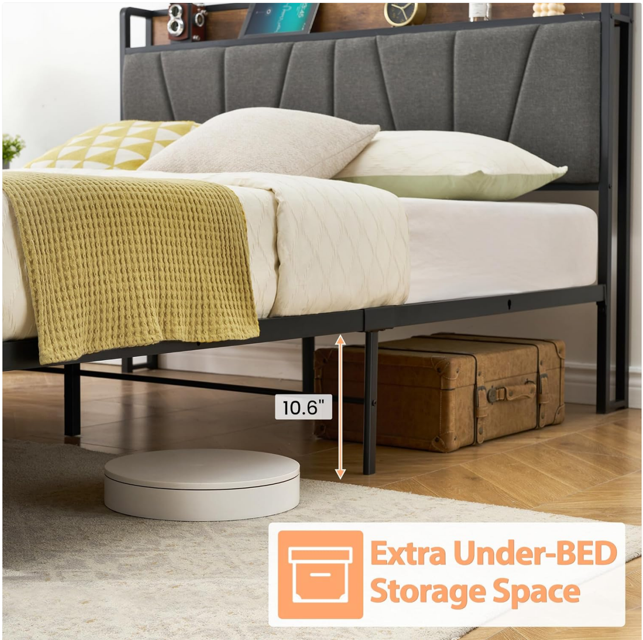
Image: A view under the bed frame showing the 10.6-inch clearance, with various items stored beneath.