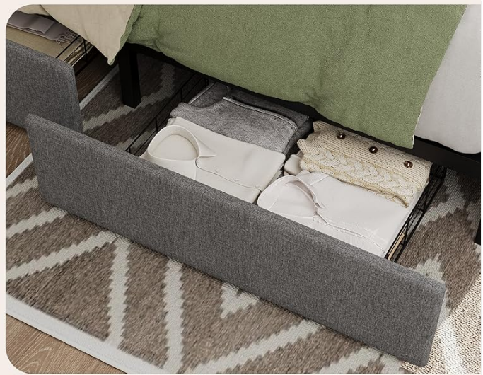
Image: Visual representation of the bed frame's stable frame, noise-free design, easy installation, and soft linen material.

The bed features two sliding drawers on either side, offering a flexible storage solution.