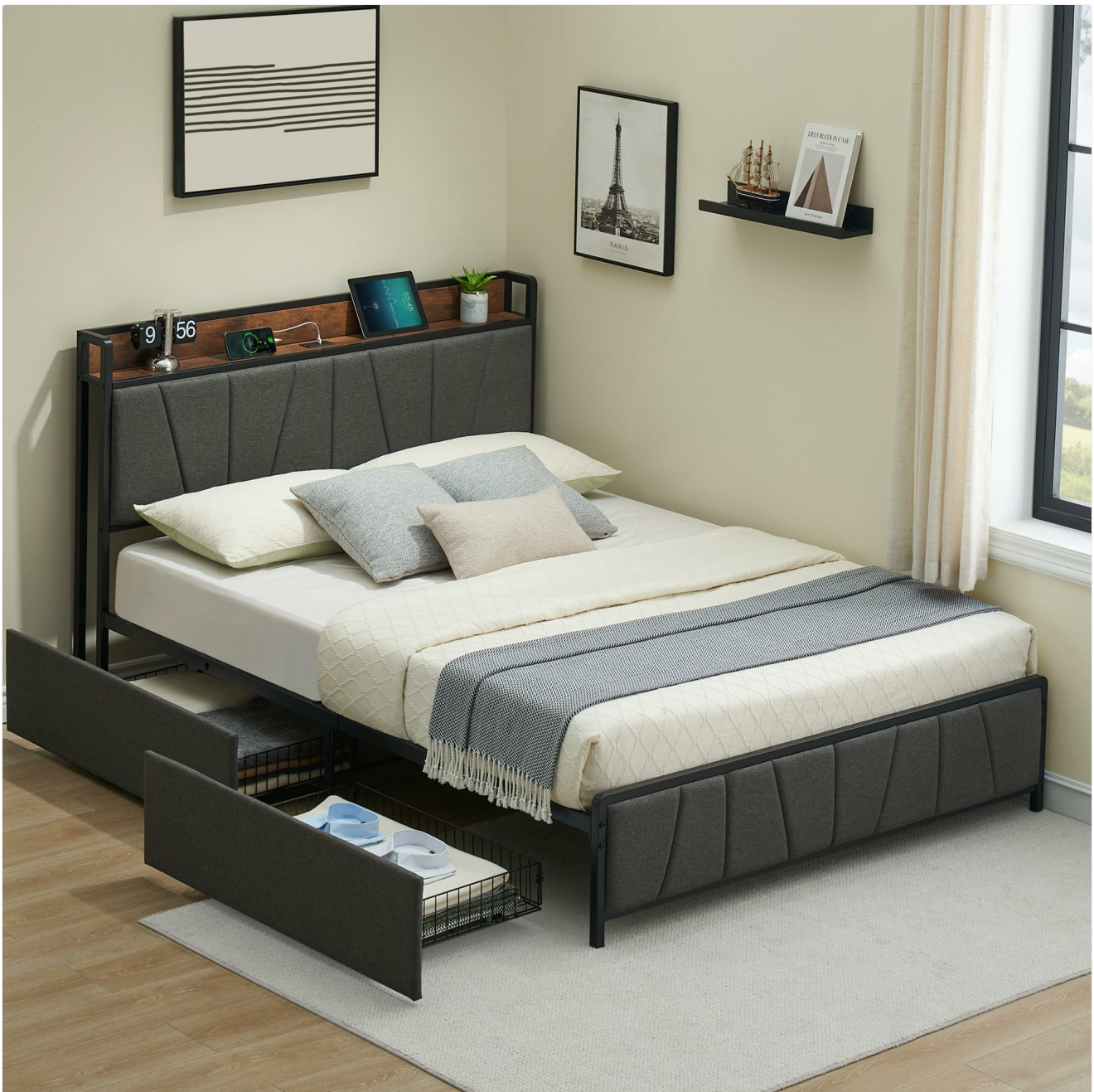
Image: Overview of the GAOMON Full Size Bed Frame, showing overall dimensions (81.5"L x 54.1"W x 42.1"H) and the 1000 lbs weight capacity.