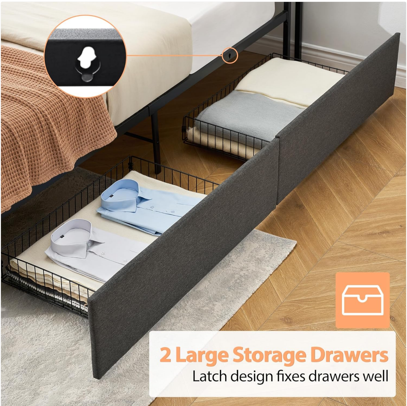
Image: Two large storage drawers shown pulled out from under the bed, highlighting the latch design that secures them.