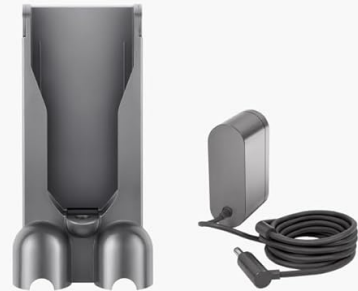
Wall dock & charger

Image: All included attachments and accessories for Dyson V15 Detect Plus. This image displays the main vacuum unit, two cleaner heads (Digital Motorbar and Fluffy Optic), a hair screw tool, a mini soft dusting brush, a crevice tool, a wand clip, and the wall dock & charger.