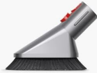
Mini soft dusting brush