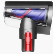
Hair screw tool