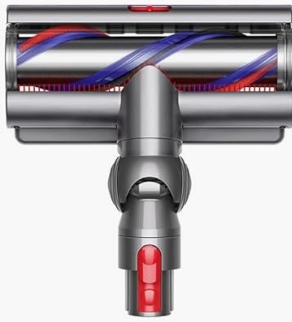
Digital Motorbar™ cleaner head Colors may vary