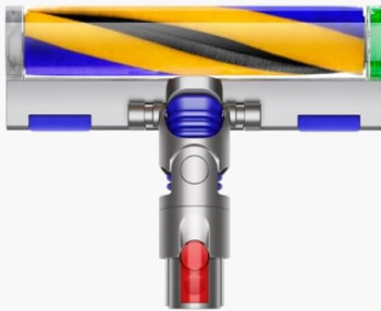
Fluffy Optic™ cleaner head