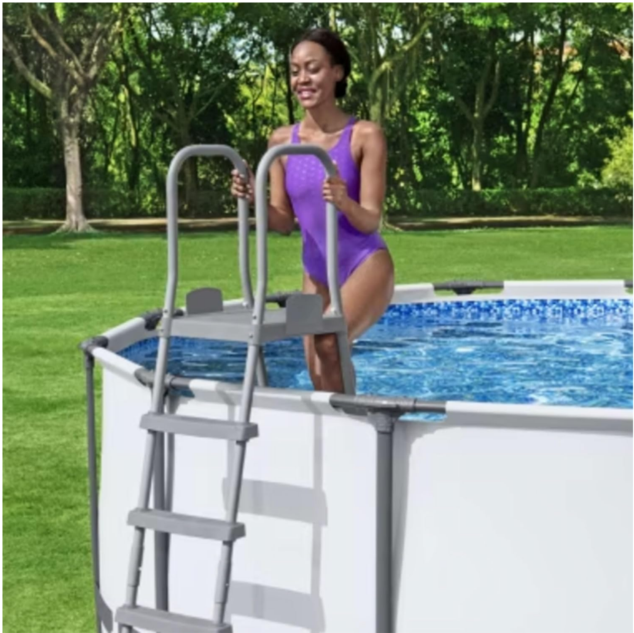
Figure 5.2: Demonstrating safe exit from the pool using the ladder.