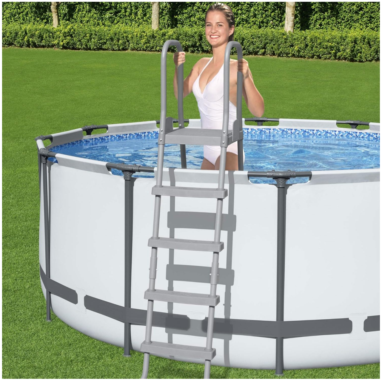
Figure 5.1: Demonstrating safe entry into the pool using the ladder.