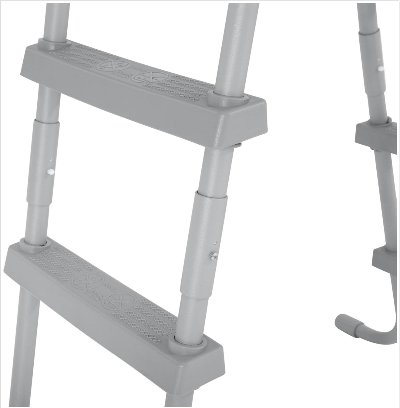
Figure 4.1: The fully assembled Bestway Flowclear 52 Inch A-Frame Pool Ladder, ready for placement.