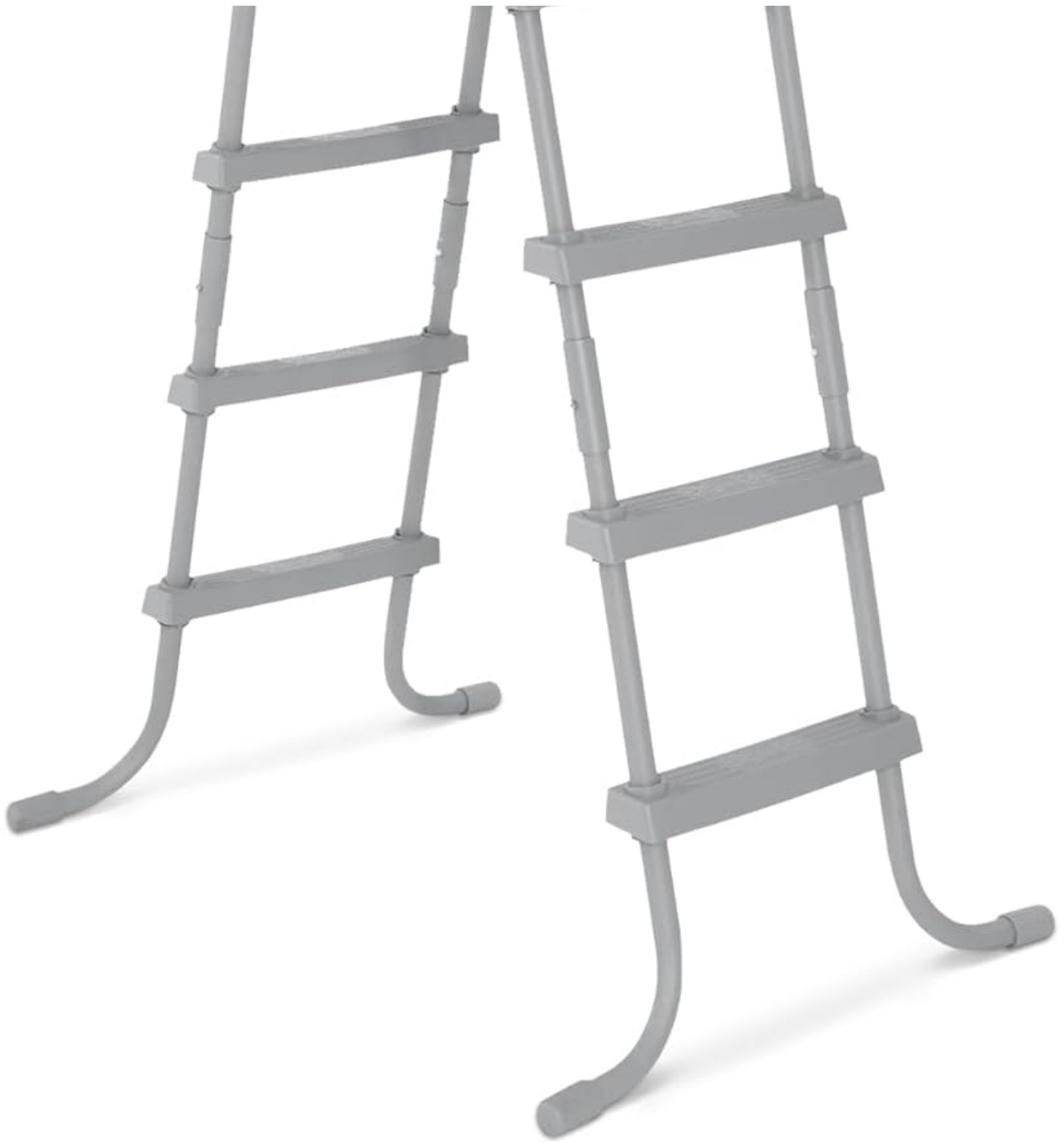
Figure 1.1: The Bestway Flowclear 52 Inch A-Frame Pool Ladder, showcasing its sturdy design and gray finish.