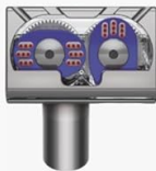
Tangle-free turbine tool