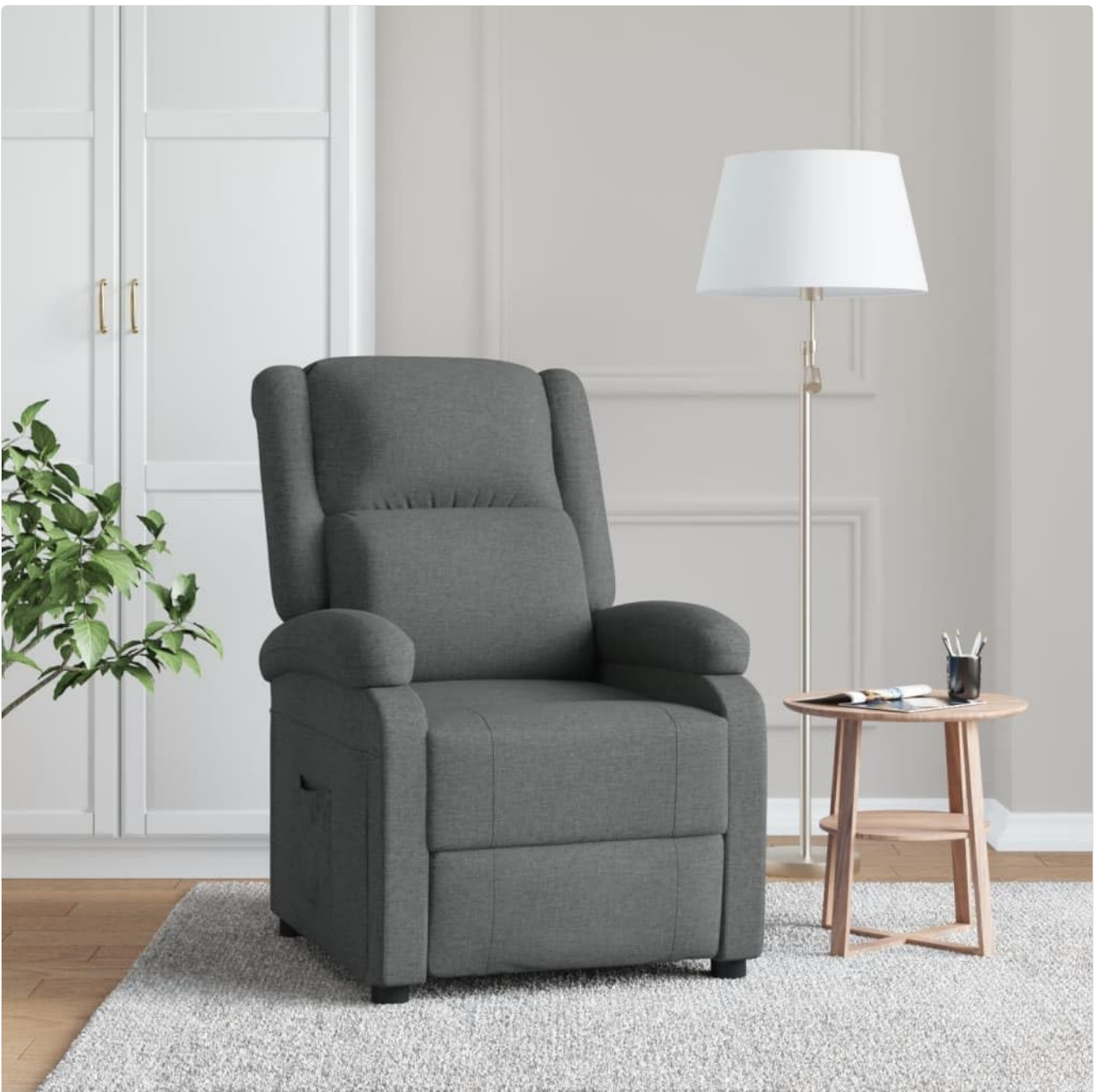
Image 5.1: The recliner chair assembled in a typical home environment.

If you encounter any difficulties or missing parts, please refer to the troubleshooting section or contact customer support.