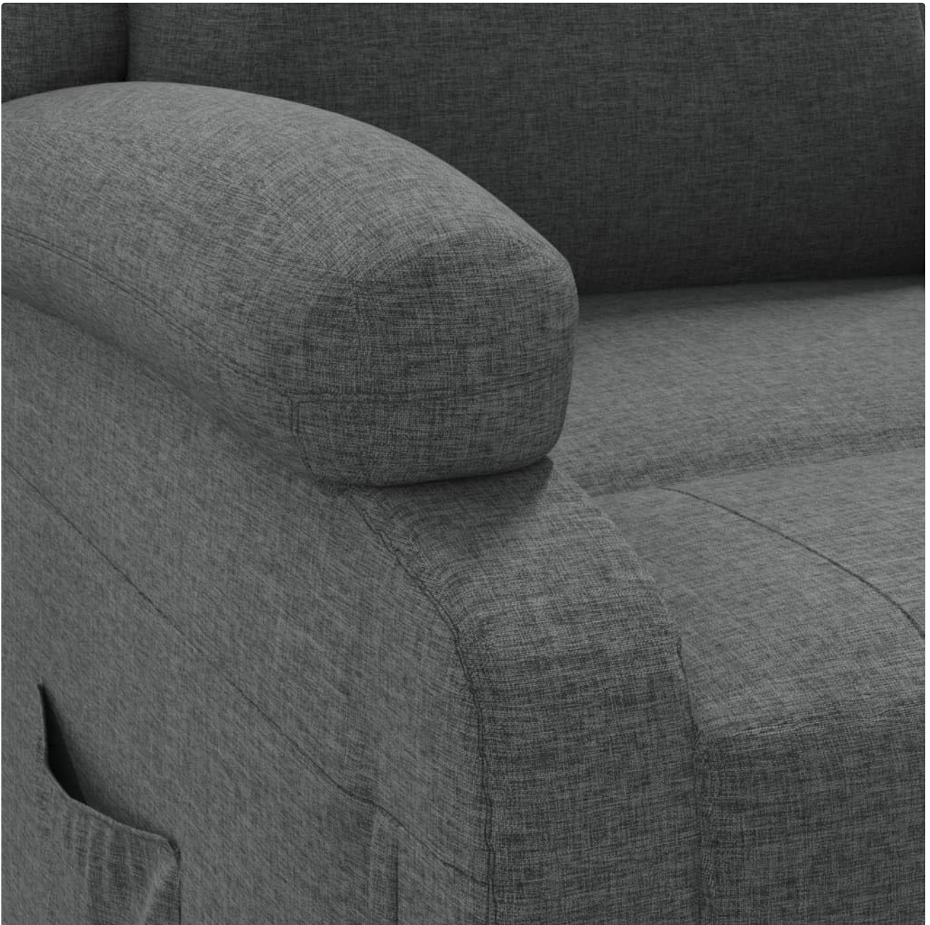
Image 3.1: Detail of the durable dark grey textile fabric and padded armrest.