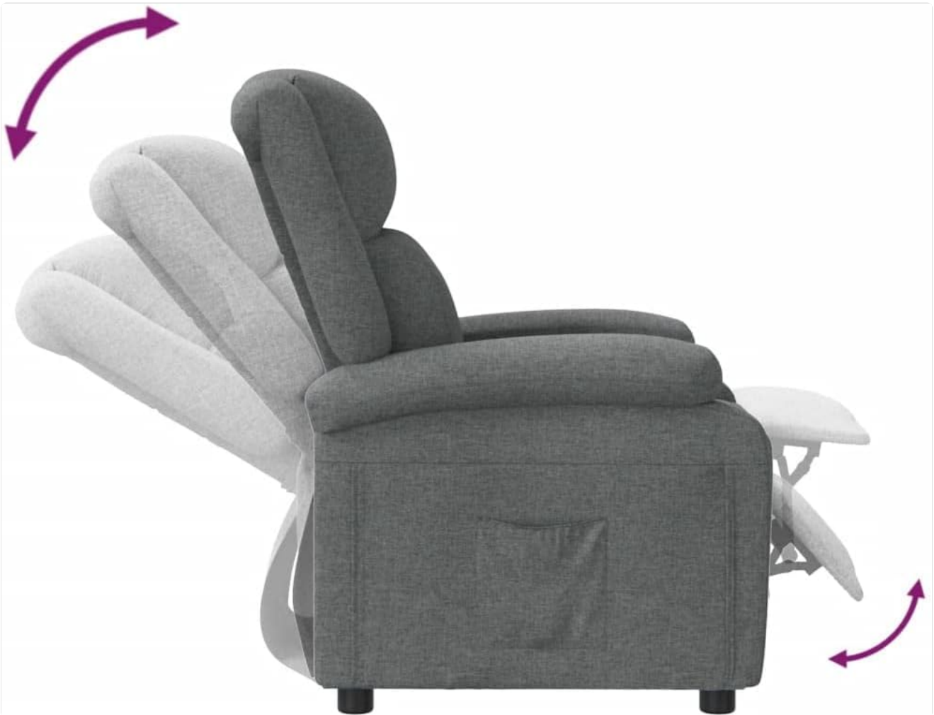
Image 6.1: Illustration of the recliner chair's adjustable positions, from upright to fully reclined.