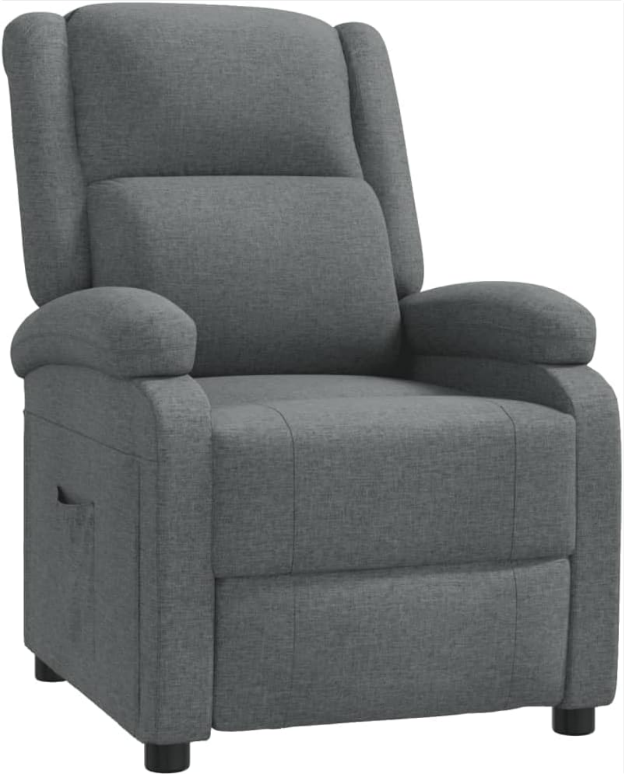
Image 1.1: The vidaXL Recliner Chair in dark grey fabric, designed for comfort and relaxation.

This recliner chair is designed to provide a comfortable and relaxing seating experience with its thick padded seat, backrest, and wide armrests. Its manual recline function allows for adjustment to three different positions, making it suitable for various activities from reading to napping. The robust wood and metal frame ensures stability and durability.