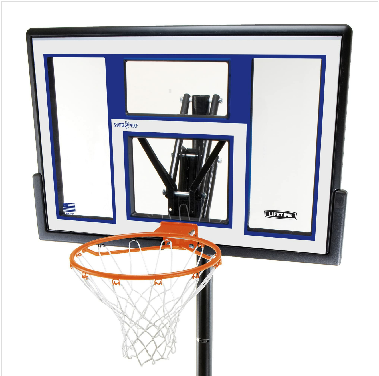
Figure 2: Detail of the 48-inch Shatterproof Fusion Backboard.