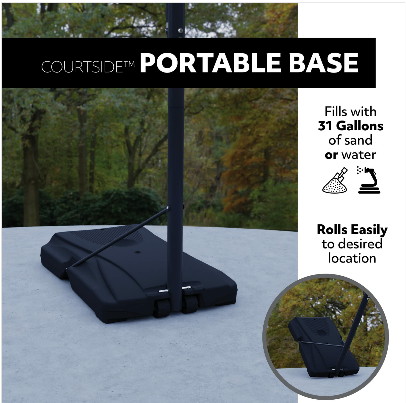
Figure 3: The Courtside Portable Base, designed to be filled with sand or water for stability.