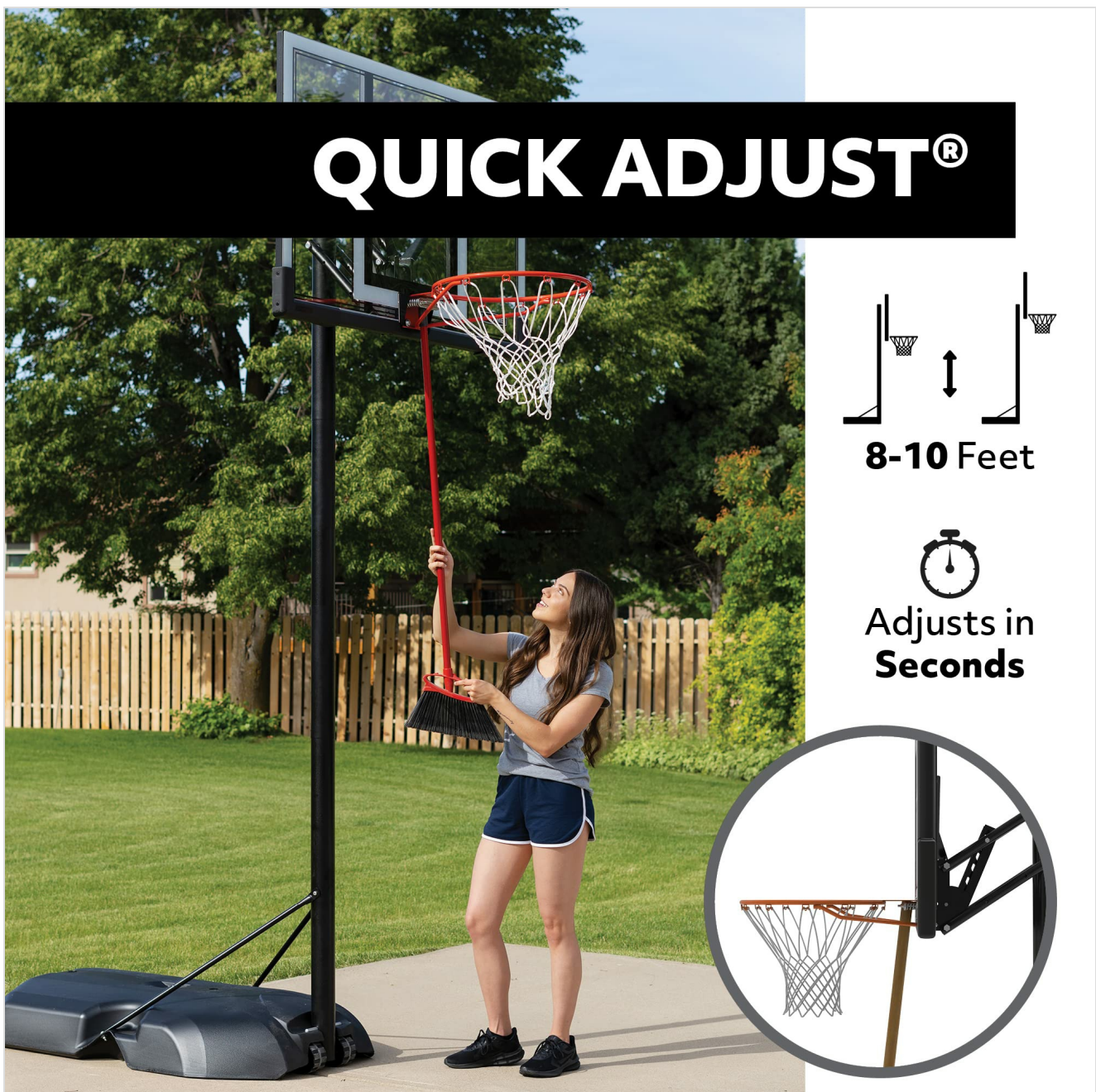
Figure 4: Demonstrating the Quick Adjust II system for height modification.