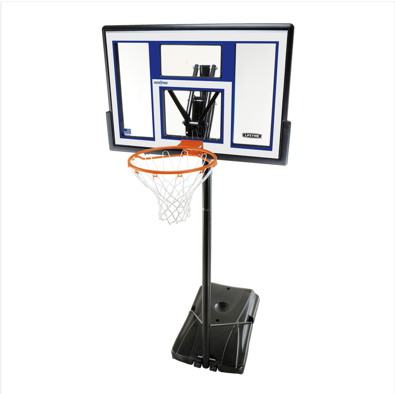
Figure 1: Overview of the Lifetime Portable Basketball Hoop 90168.