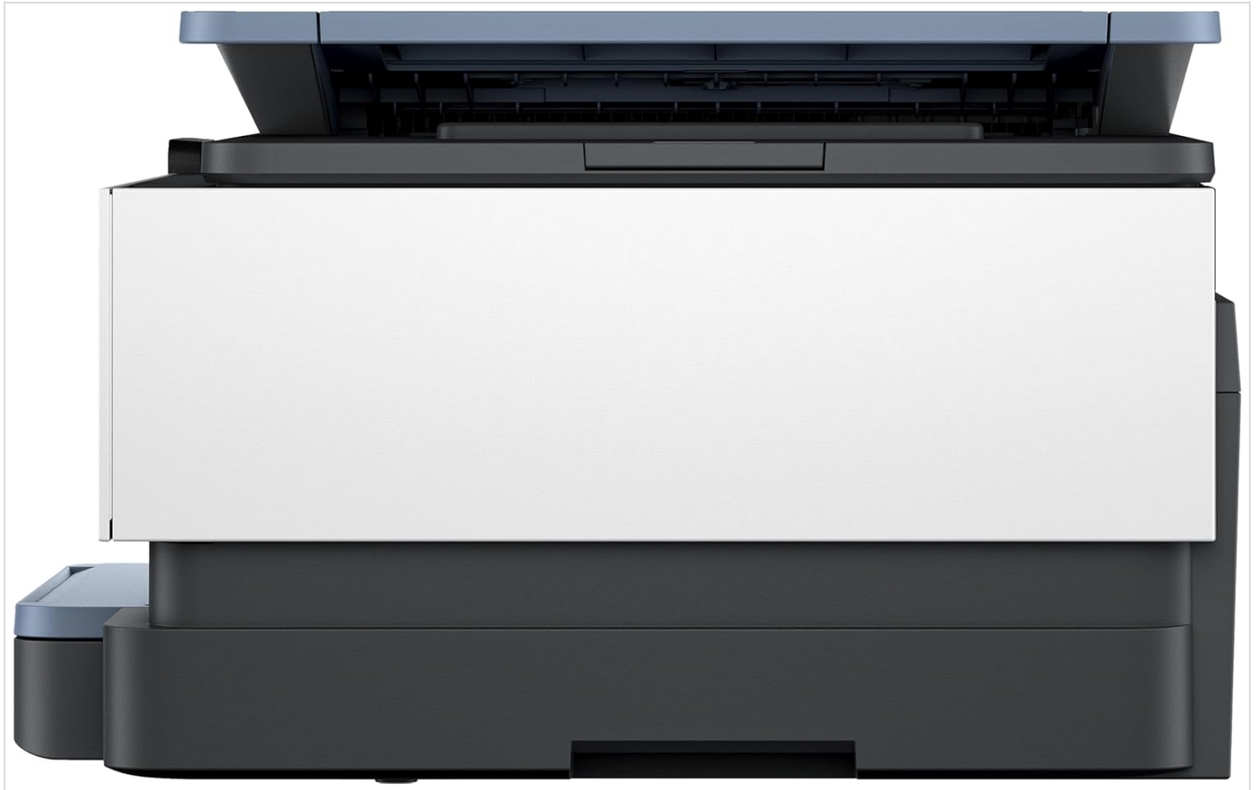
Image: The HP OfficeJet Pro 8125e printer with its Automatic Document Feeder (ADF) lid open, indicating readiness for scanning or copying multiple pages.