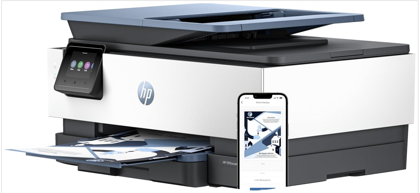
Image: The HP OfficeJet Pro 8125e printer with paper loaded in the front tray, ready for printing, alongside a smartphone displaying a print preview.

Open the input tray and adjust the paper guides. Load a stack of plain A4 paper into the tray, ensuring it fits snugly without bending. Do not overfill the tray.