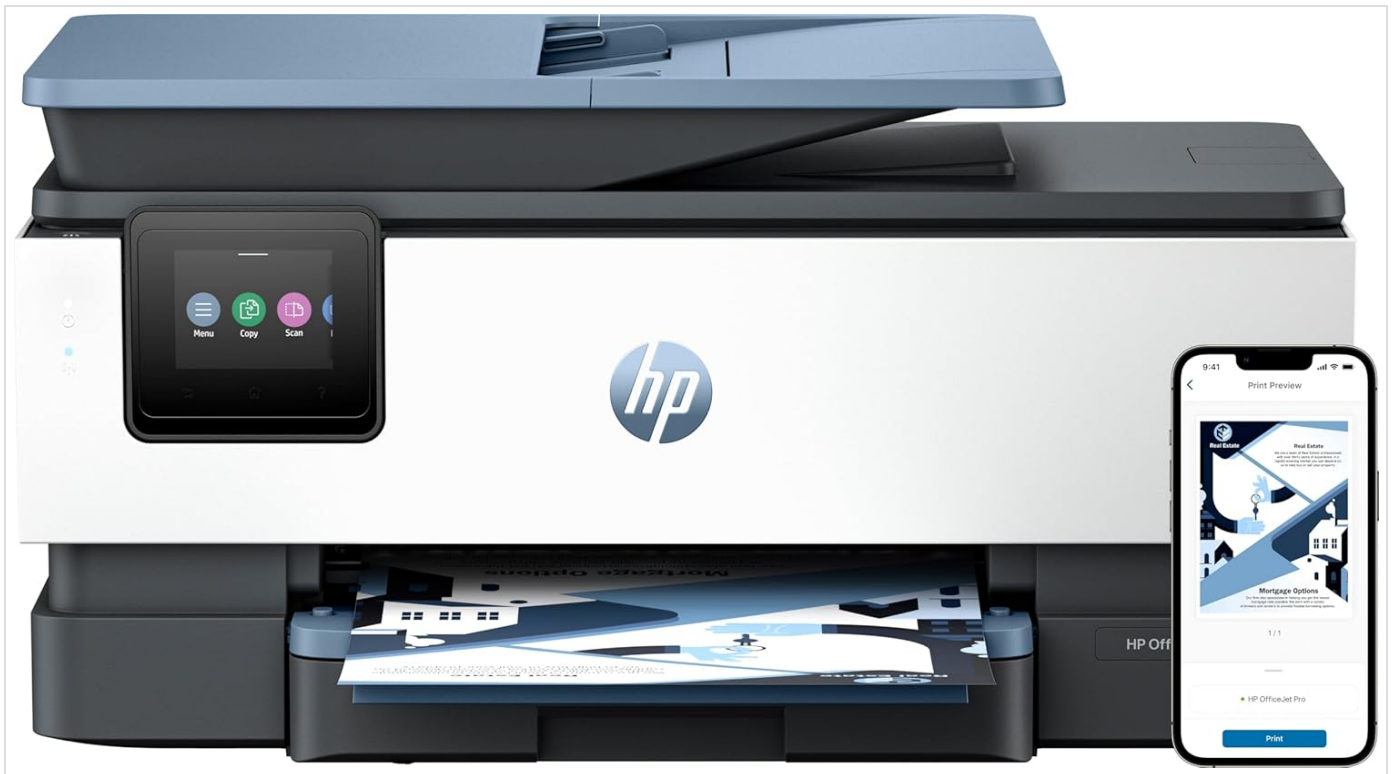
Image: Front view of the HP OfficeJet Pro 8125e All-in-One Printer, showing its compact design and a smartphone connected for mobile printing.