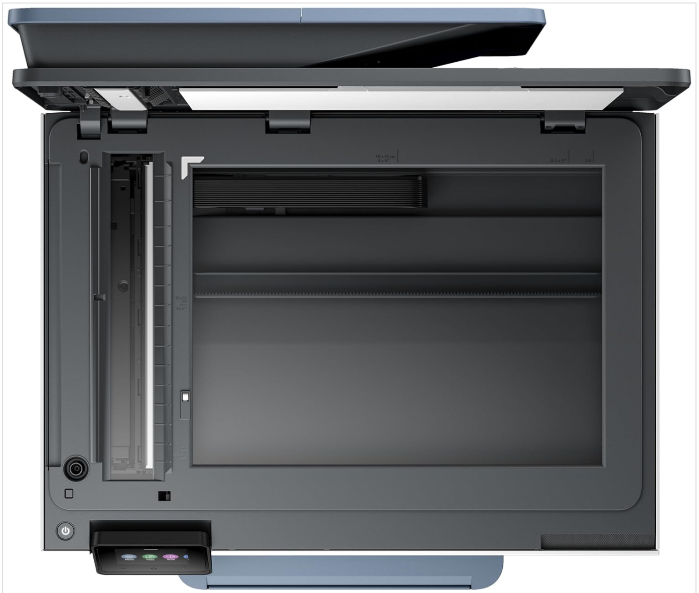
Image: A top-down view of the HP OfficeJet Pro 8125e printer's flatbed scanner, showing the scanning surface and paper guides.