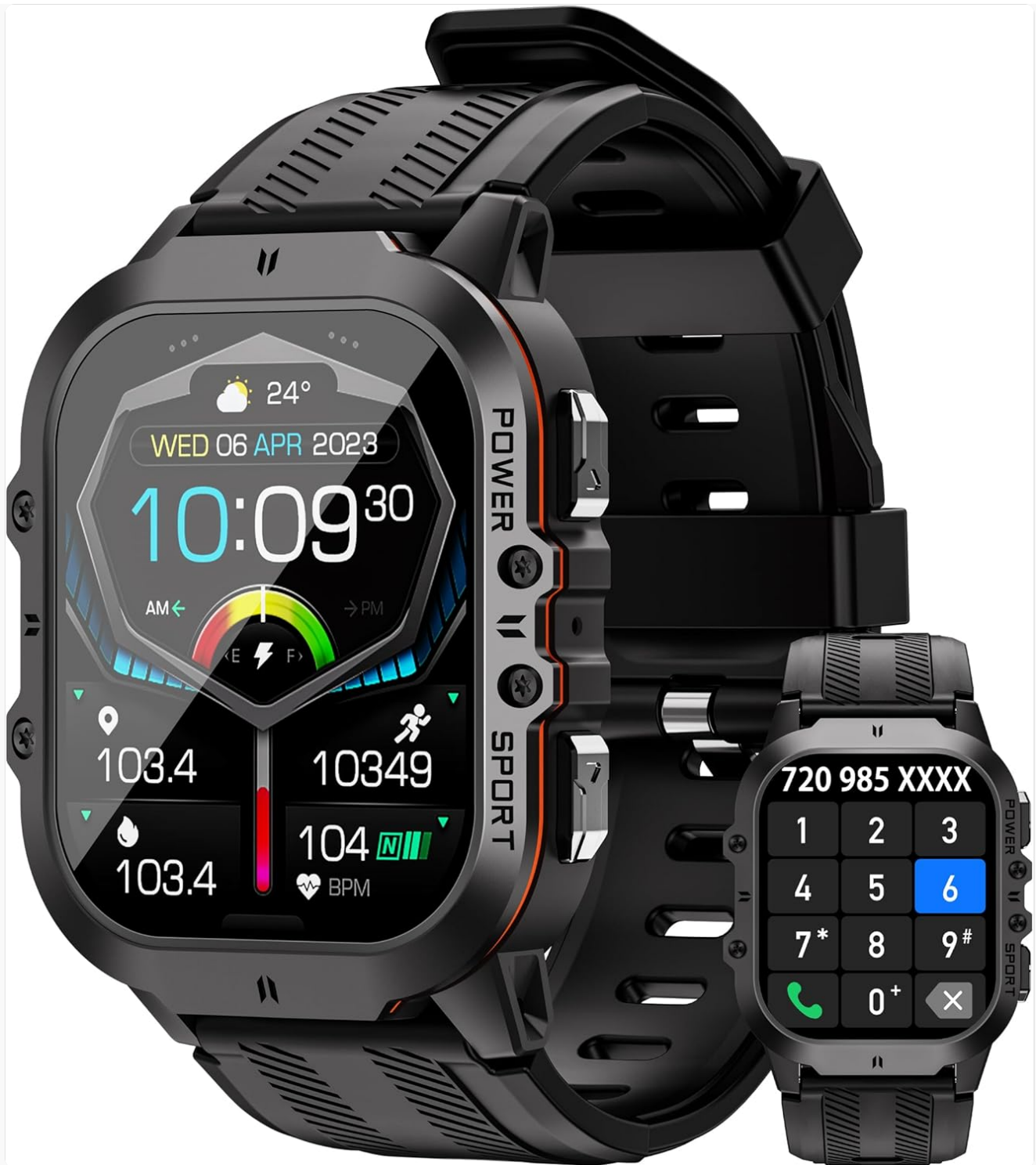
Figure 3.1: Vovtop C26 Smart Watch main view, showing the display and side buttons.