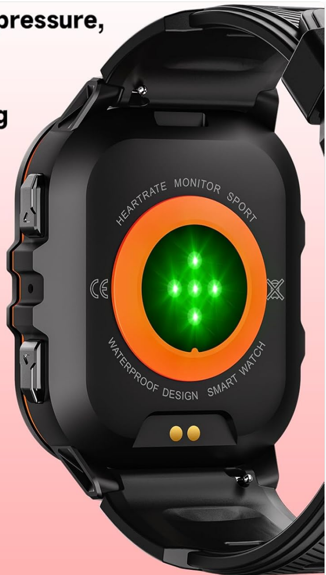
Figure 5.5: Visual representation of heart rate, blood pressure, and SpO2 monitoring data on the Vowtop C26 Smart Watch.