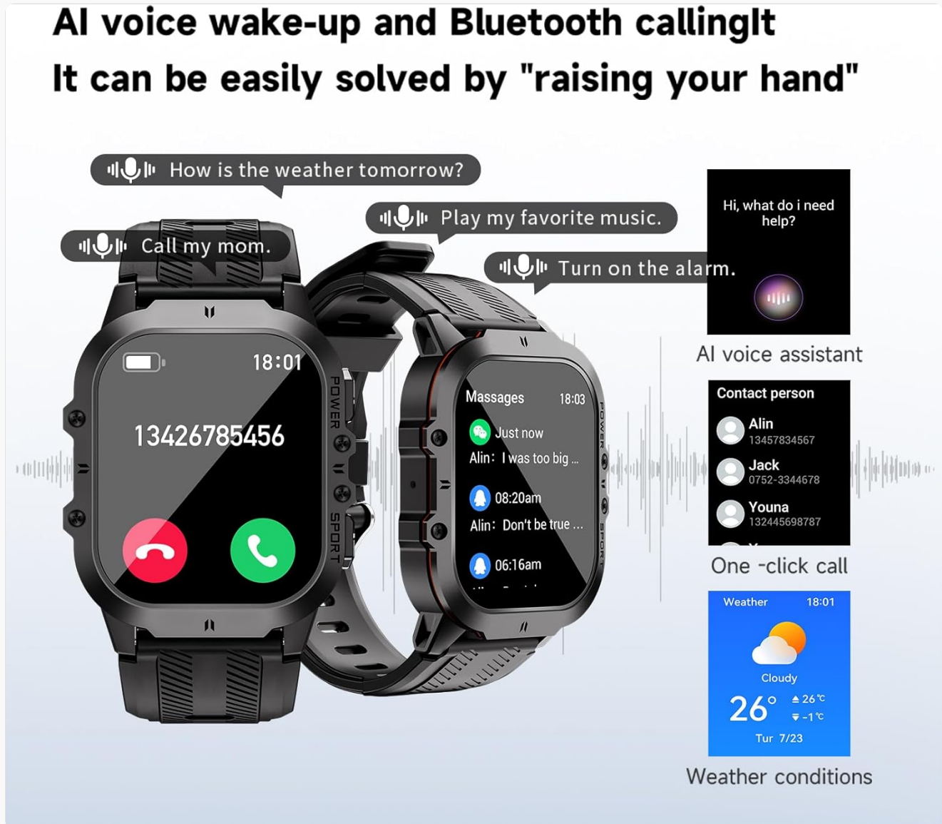
Figure 5.2: Demonstrates the AI voice assistant and Bluetooth calling interface on the Vovtop C26 Smart Watch.

Activate the integrated AI Voice Assistant for hands-free operation. This feature allows you to control various watch functions and access information using voice commands, such as checking the weather or initiating calls.