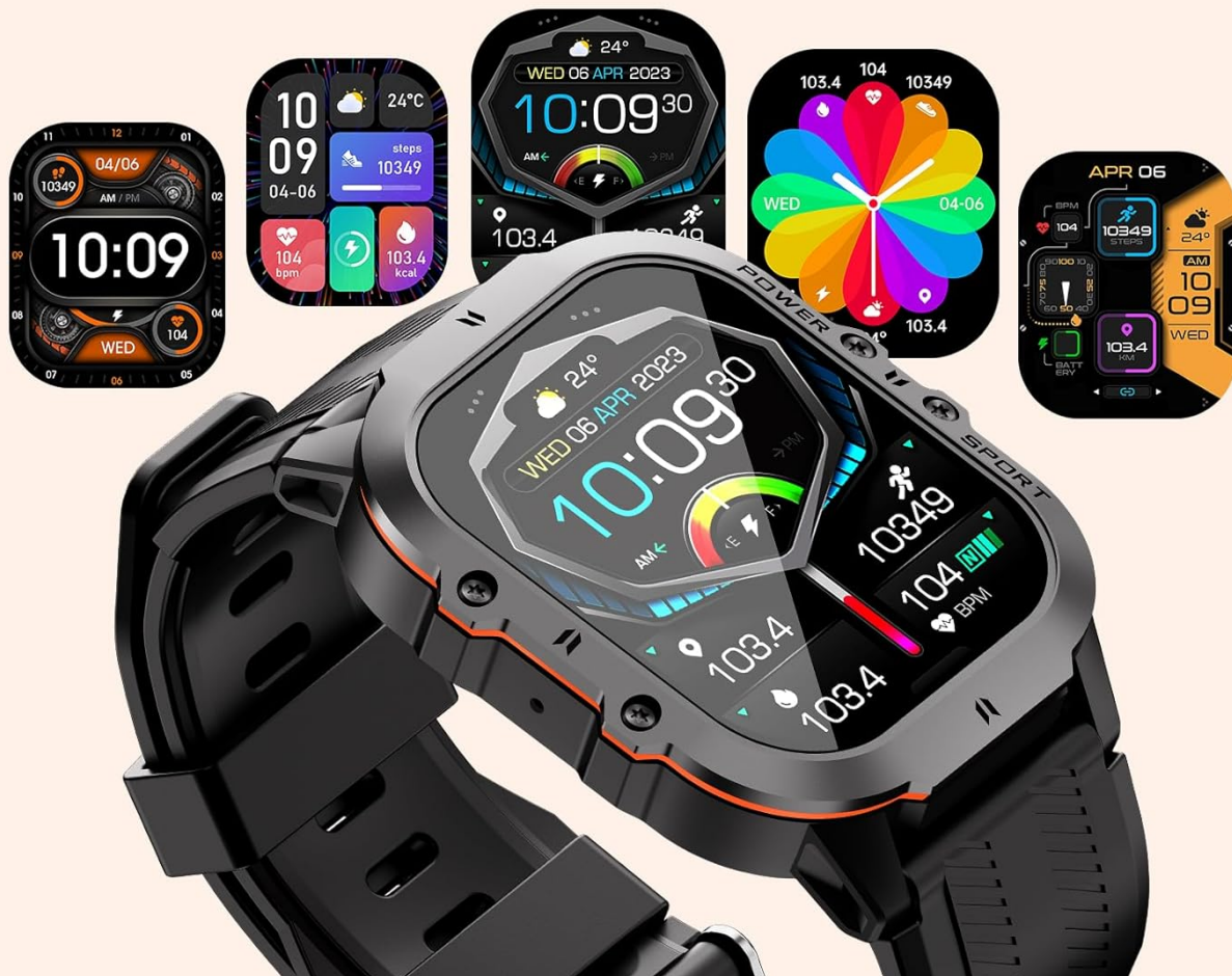
Figure 5.3: Examples of different watch faces available for the Vowtop C26 Smart Watch.