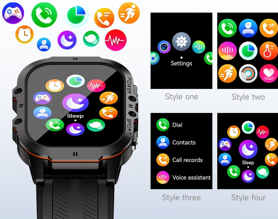
Figure 8.1: Detailed dimensions and key specifications of the Vowtop C26 Smart Watch.

Many functions, waiting for you to explore Four menu modes for you to choose