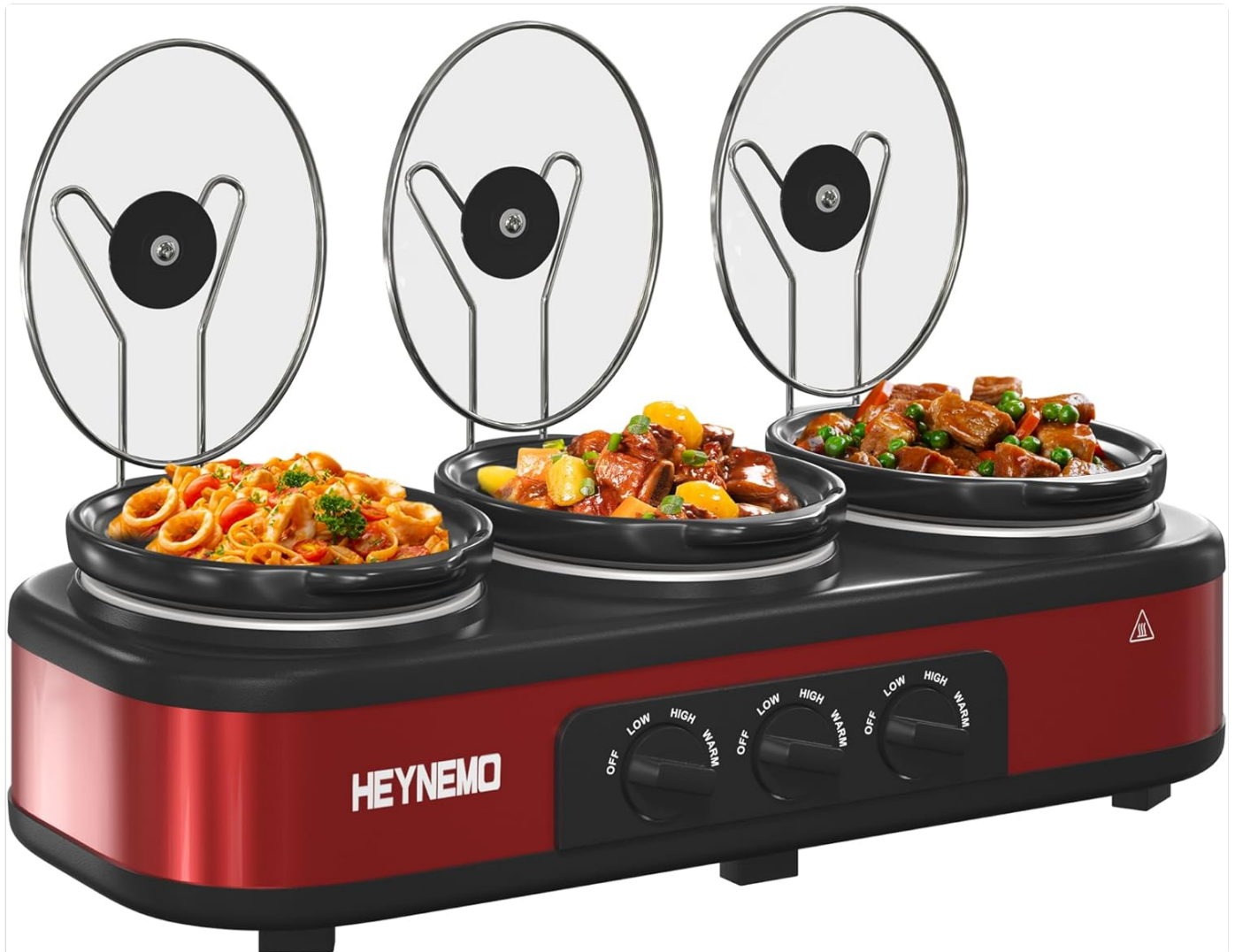
Image: The HEYNEMO Triple Slow Cooker with its three ceramic pots, glass lids, and lid rests, showcasing its design and capacity for multiple dishes.