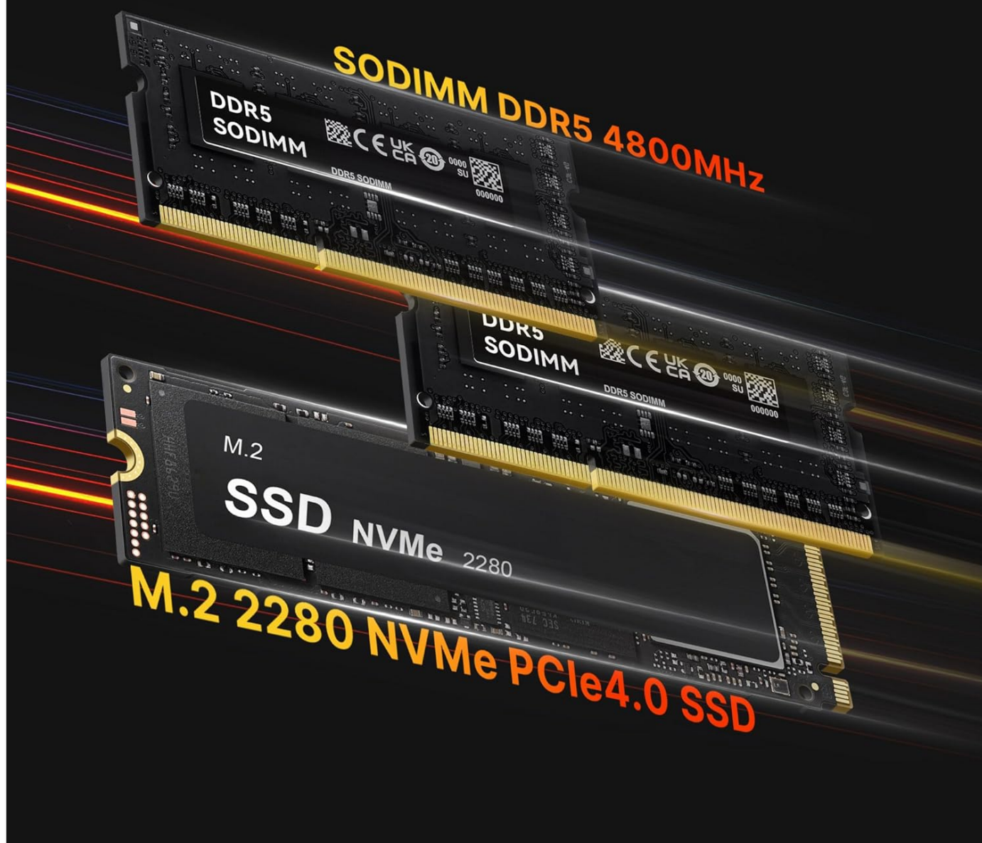
Figure 3.2: Internal layout with RAM and SSD.