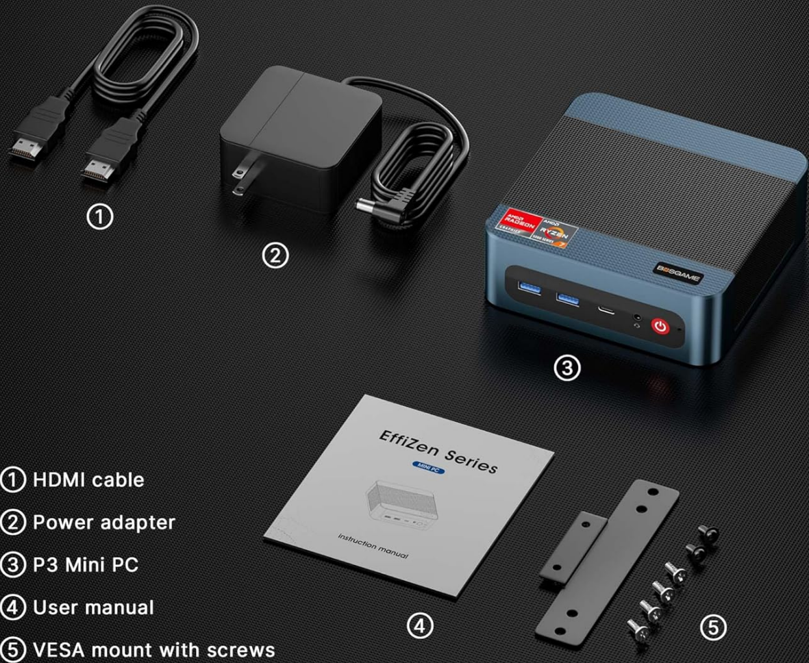
Figure 2.1: Included accessories with the BOSGAME P3 Mini PC.