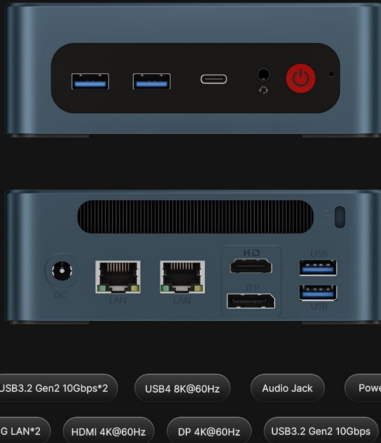
Figure 3.1: Front and rear ports of the Mini PC.

Equipped with rich interfaces, it is easy to expand various scenarios and meet daily applications.