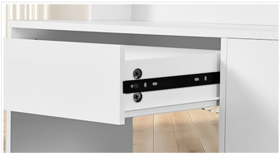
Image: A detailed view of the drawer slide mechanism, illustrating how it attaches to the drawer and the vanity frame.