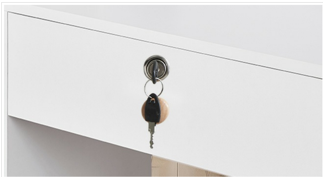
Image: A close-up of a drawer with a key lock, highlighting the security feature for personal items.