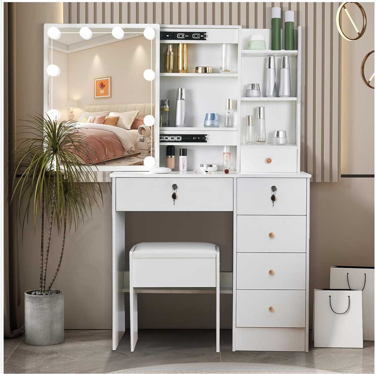
Image: The vanity mirror in its closed position, showcasing the side storage shelves and the overall compact design.