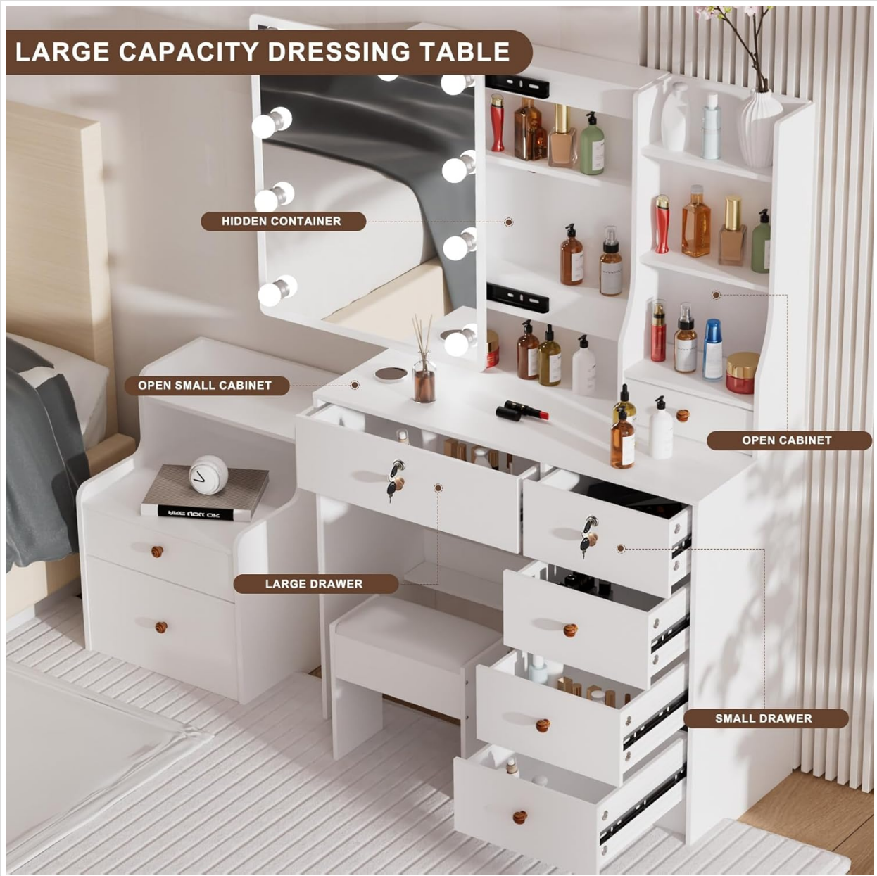
Image: The vanity desk with several drawers pulled open, illustrating the ample storage capacity for various items.