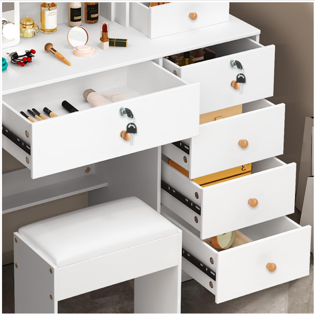
Image: A close-up view of the vanity desk's drawers, showcasing their construction and wooden handles.