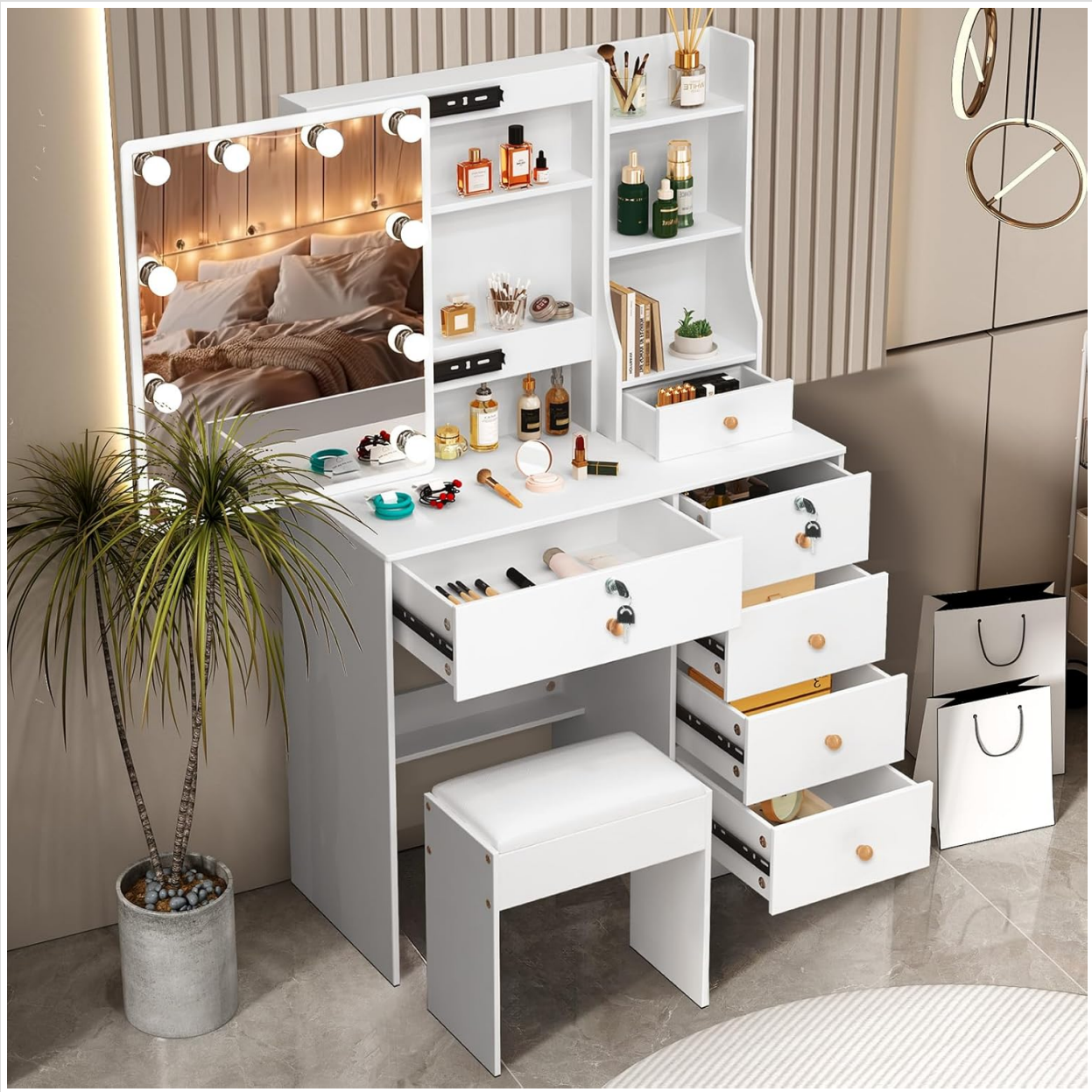
Image: The Koestem Vanity Mirror with Lights Desk and Chair, featuring a large mirror with LED bulbs, multiple drawers, and an accompanying stool.