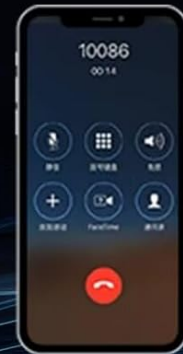
Image: Demonstrates the Bluetooth phonebook and calling interface, alongside the FM RDS radio display.