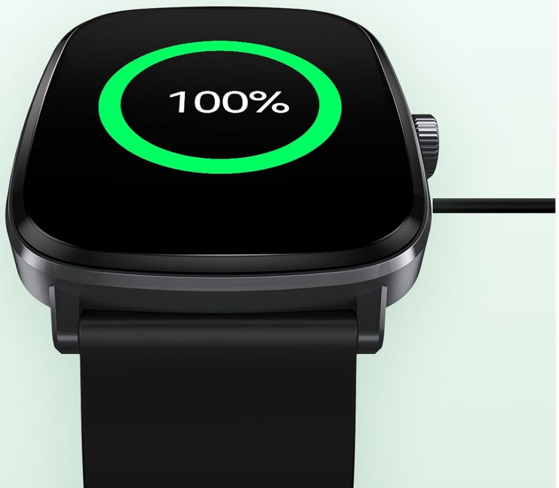
Figure 2: Smartwatch connected to its magnetic charging cable, indicating full charge.