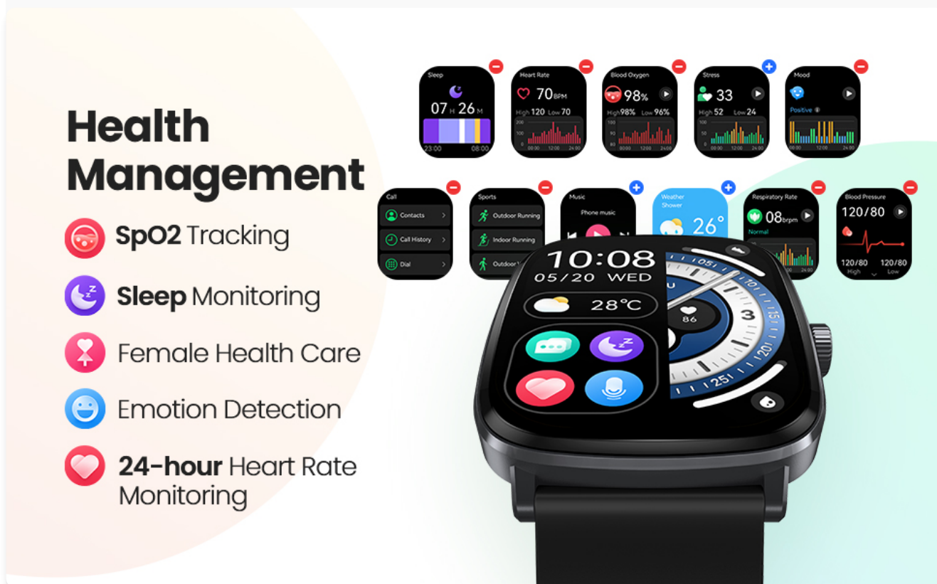
Figure 7: Overview of health management features on the HAYLOU RS5.

Access these features from the app list on your watch or view detailed historical data in the HAYLOU app.