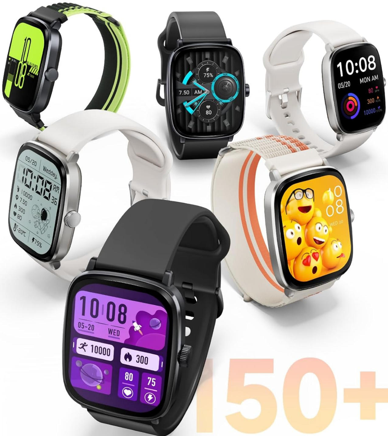
Figure 5: A selection of personalized watch faces available for the HAYLOU RS5.