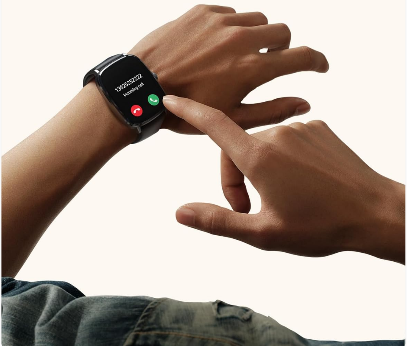
Figure 6: Bluetooth calling feature in action on the HAYLOU RS5 Smart Watch.