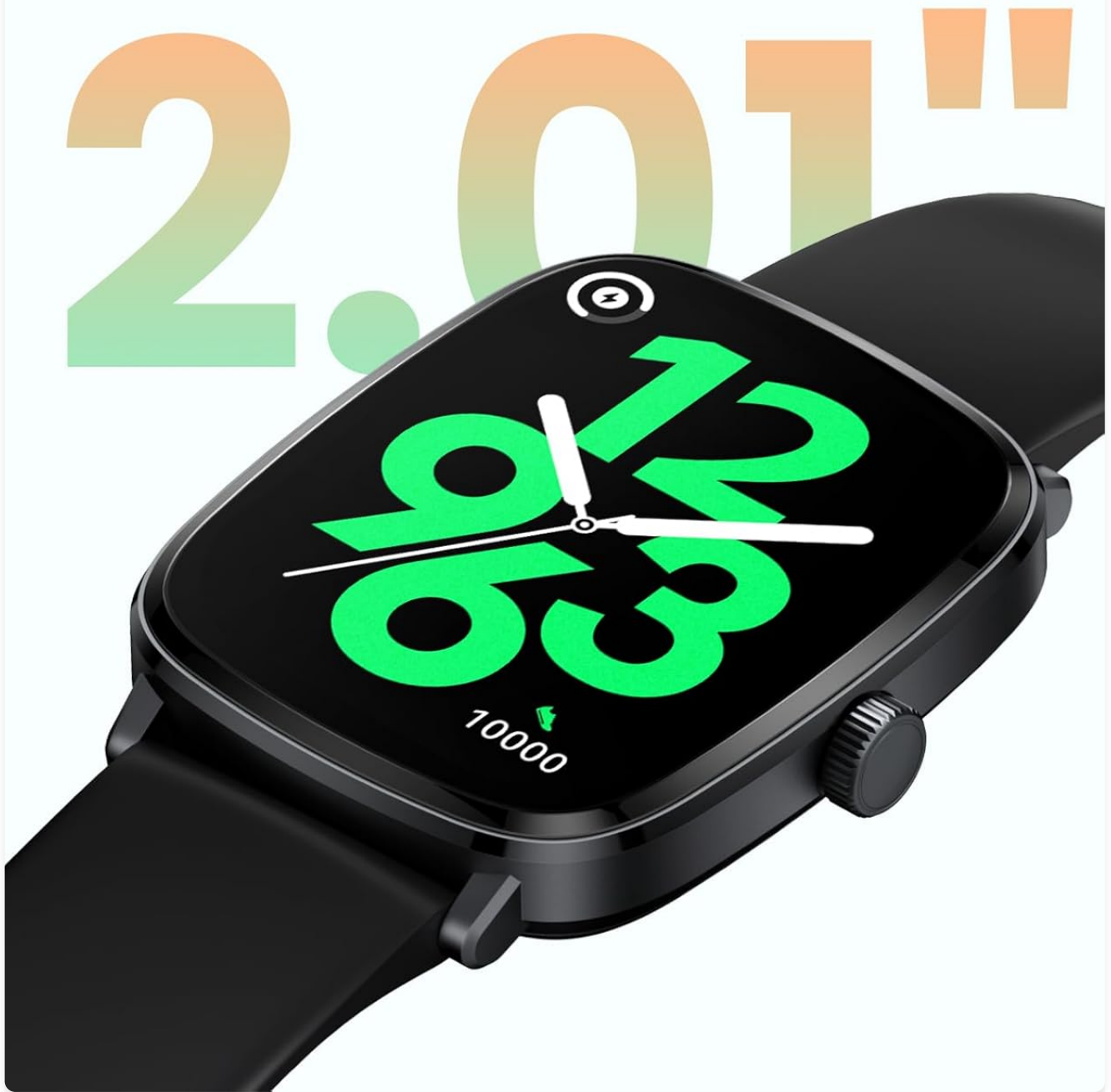
Figure 4: The 2.01" AMOLED display of the HAYLOU RS5 Smart Watch.