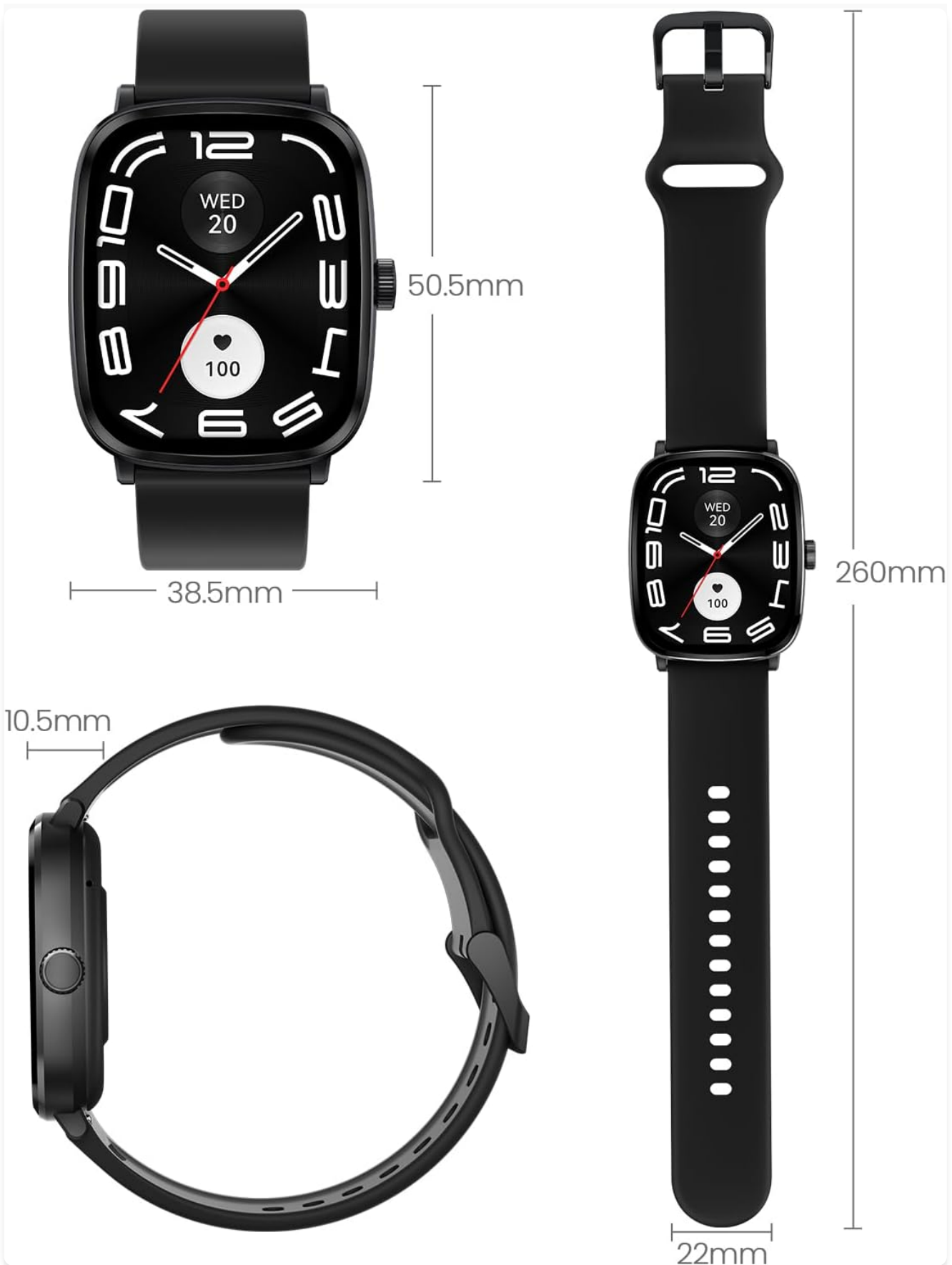
Figure 9: Physical dimensions of the HAYLOU RS5 Smart Watch.