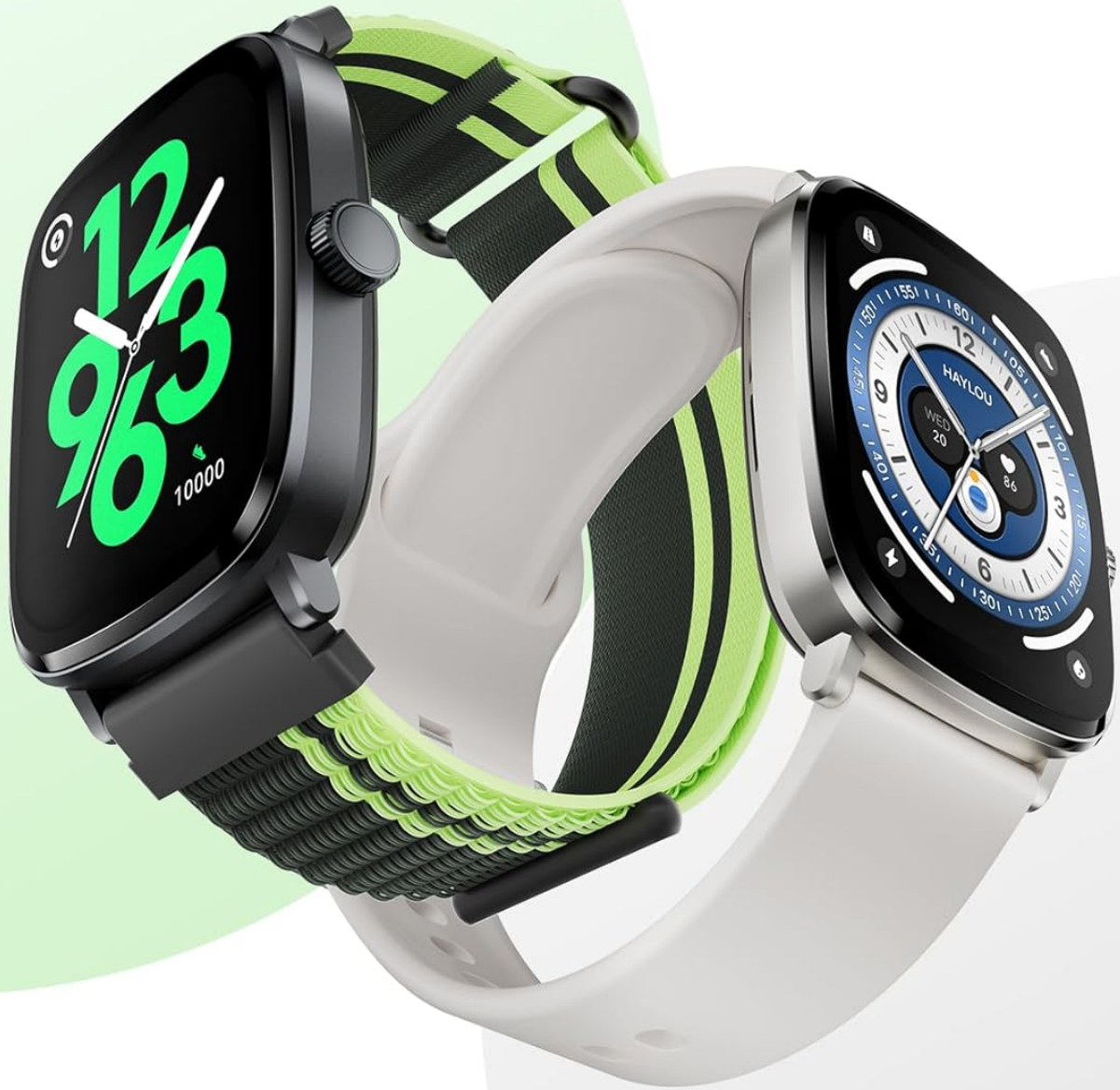
Figure 3: The HAYLOU RS5 Smart Watch showcasing its two included strap options.

Silicone Strap and Braided Strap included