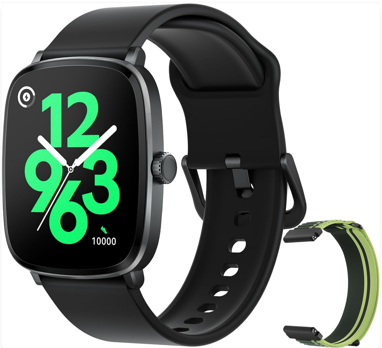
Figure 1: HAYLOU RS5 Smart Watch with its included straps.