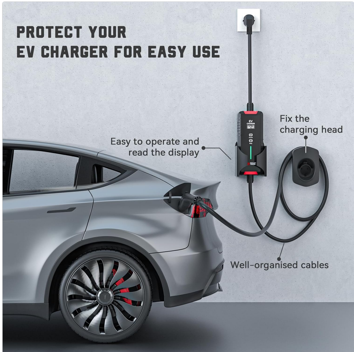
Image 1: EV Charger securely held and cable organized, ensuring easy operation and display readability.