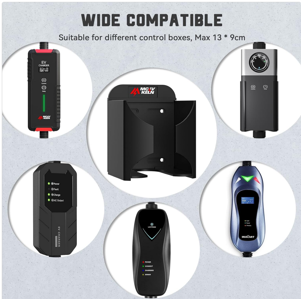
Image 6: The holder is compatible with a wide range of EV charger control boxes (Max 13 x 9 cm).