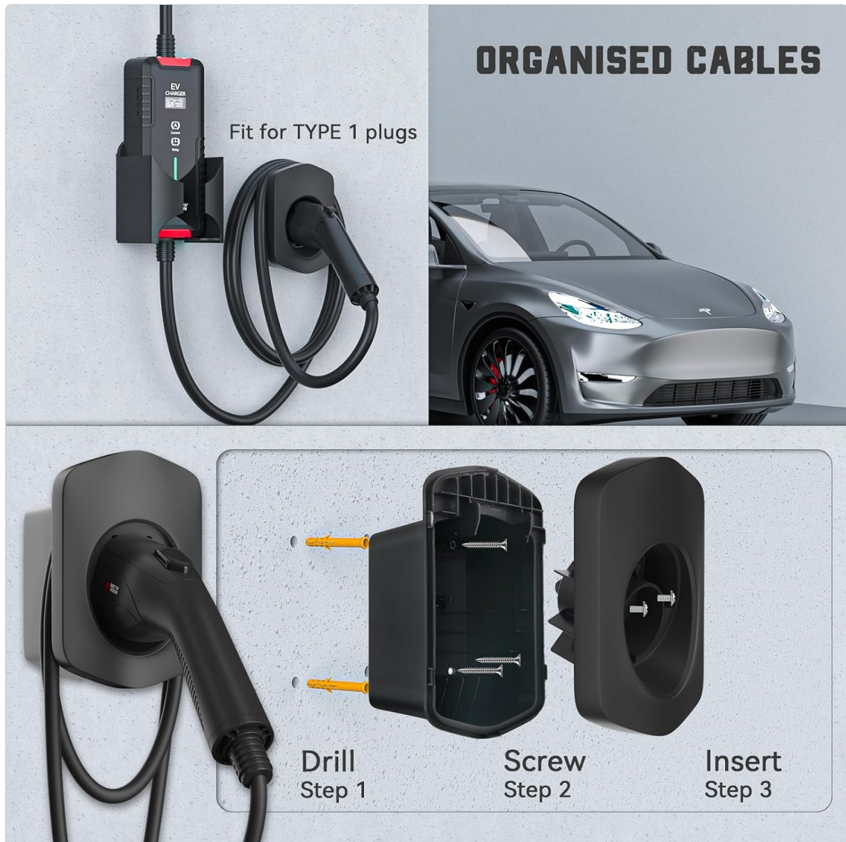
Image 4: Visual guide for installing the J1772 cable holder and organizing the cable.