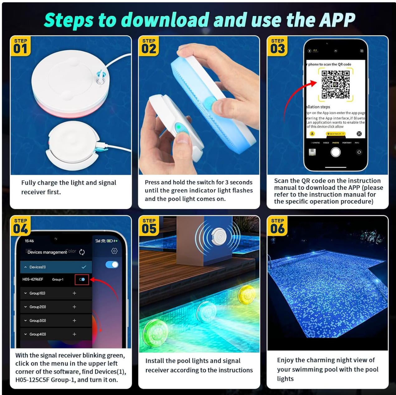
Image: Step-by-step guide for downloading and connecting the iStrip+ app to the pool lights, including QR code scanning and device management.