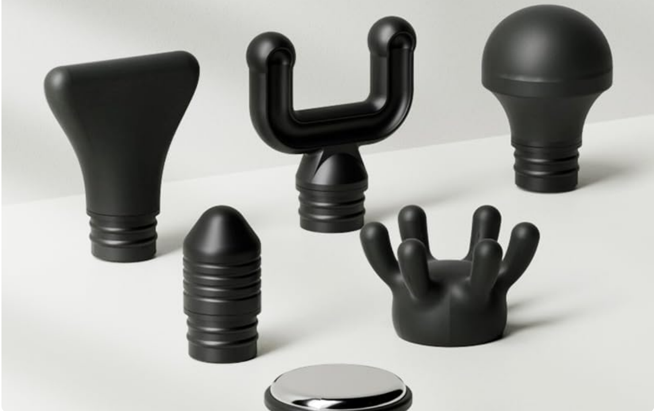
Image: A selection of six silicone massage heads, demonstrating the variety available for different massage techniques.

With more accessories to choose from, combining different techniques such as warm compress, kneading and dot matrix massage, a multi-purpose device brings you a funny relaxation.