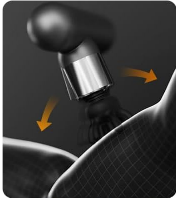
Sway from side to side

* The silicone head should be covered over the prong and cannot be used separately.