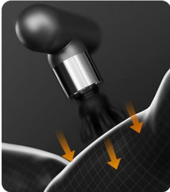
Gently press down

Inspired by a scalp massager, it simulates the scratching and kneading touch of human finger pulps, which is skin-friendly and soft, let you feel limp and numb as well as decompressed.