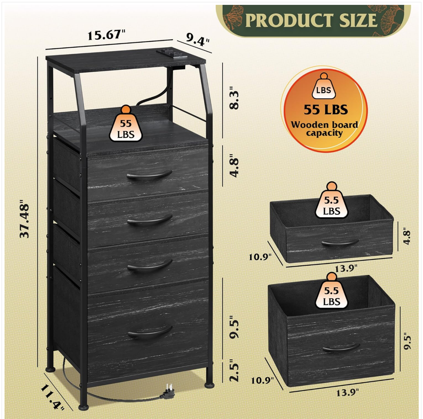
Image: Detailed diagram showing the dimensions of the nightstand and the weight capacities for the wooden board and fabric drawers.