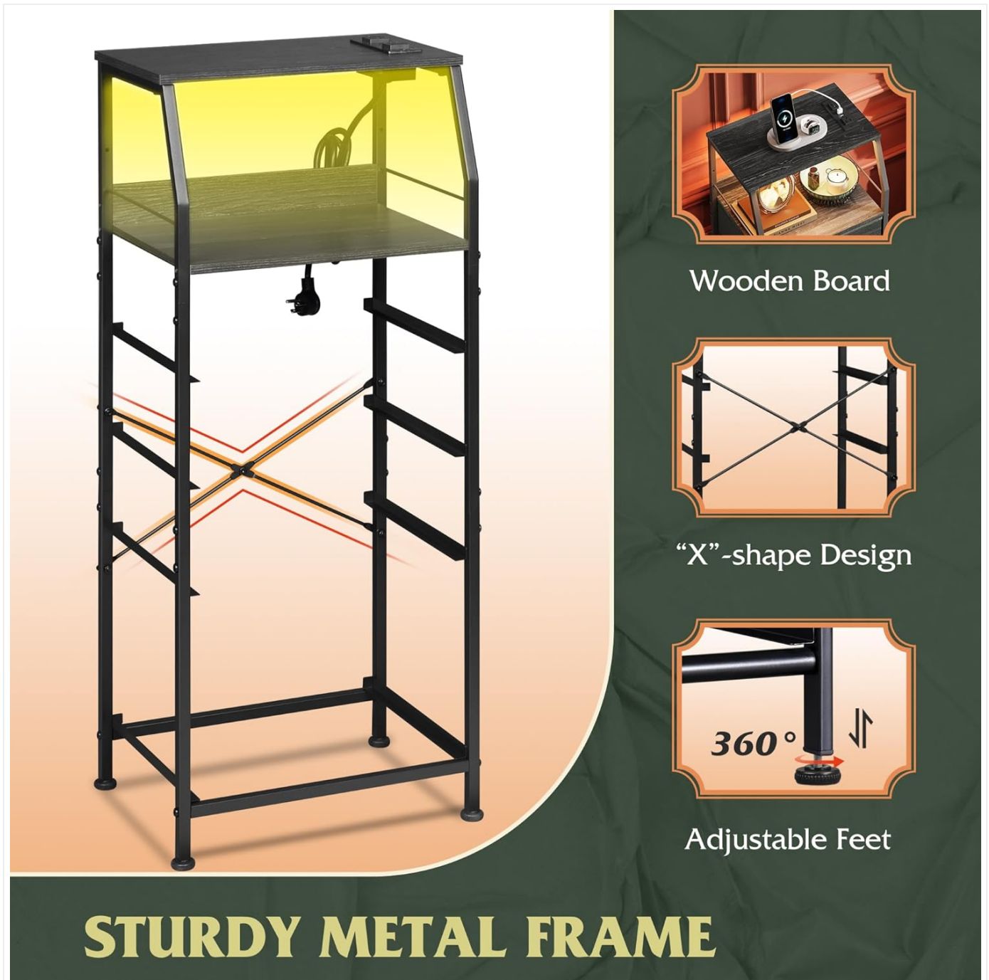
Image: Illustration of the nightstand's sturdy metal frame, X-shaped back rods for stability, and 360-degree adjustable feet for leveling.