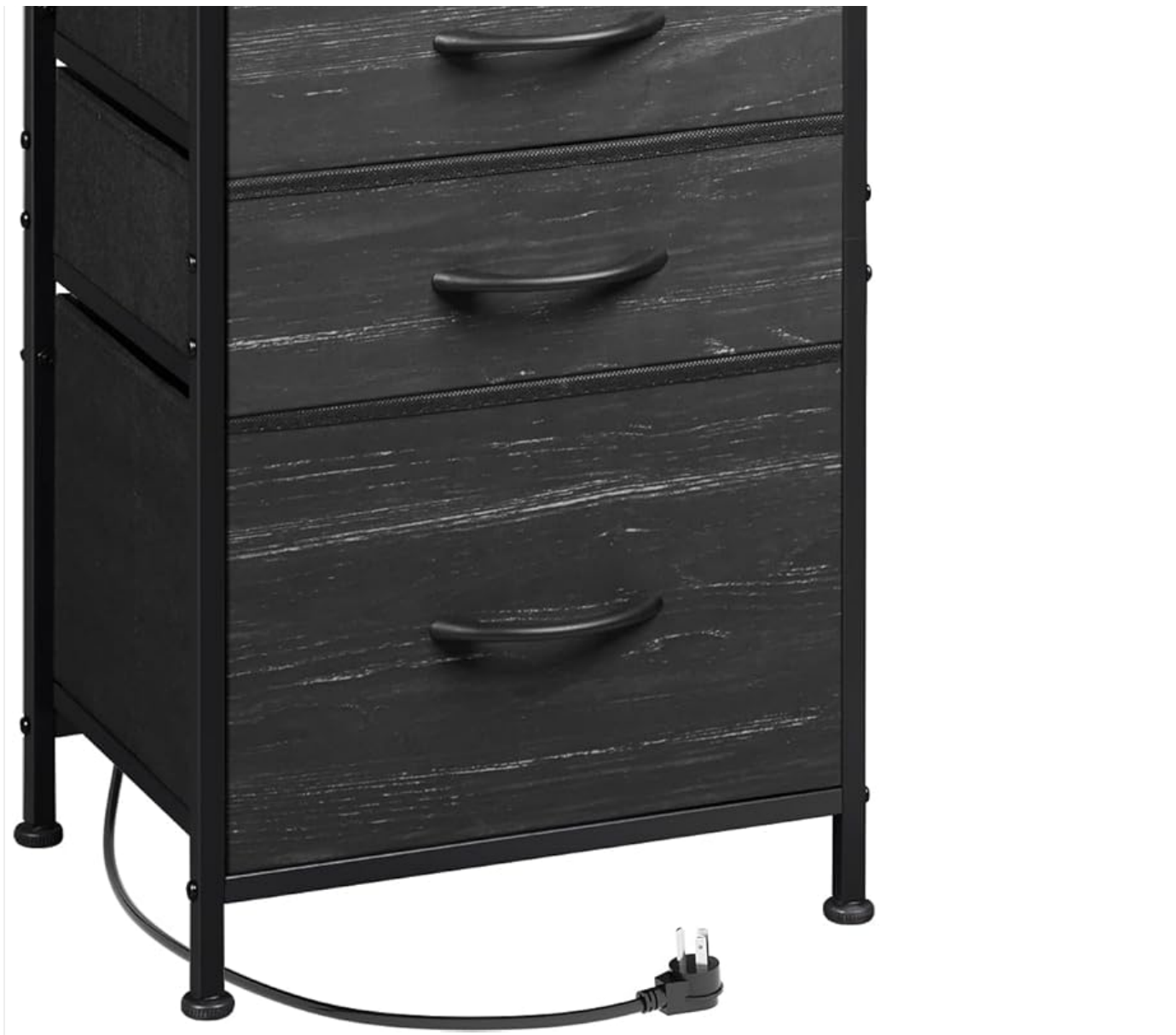
Image: The WLIVE Nightstand with Charging Station, showcasing its four fabric drawers, open shelf with LED lighting, and integrated charging station on the top surface.