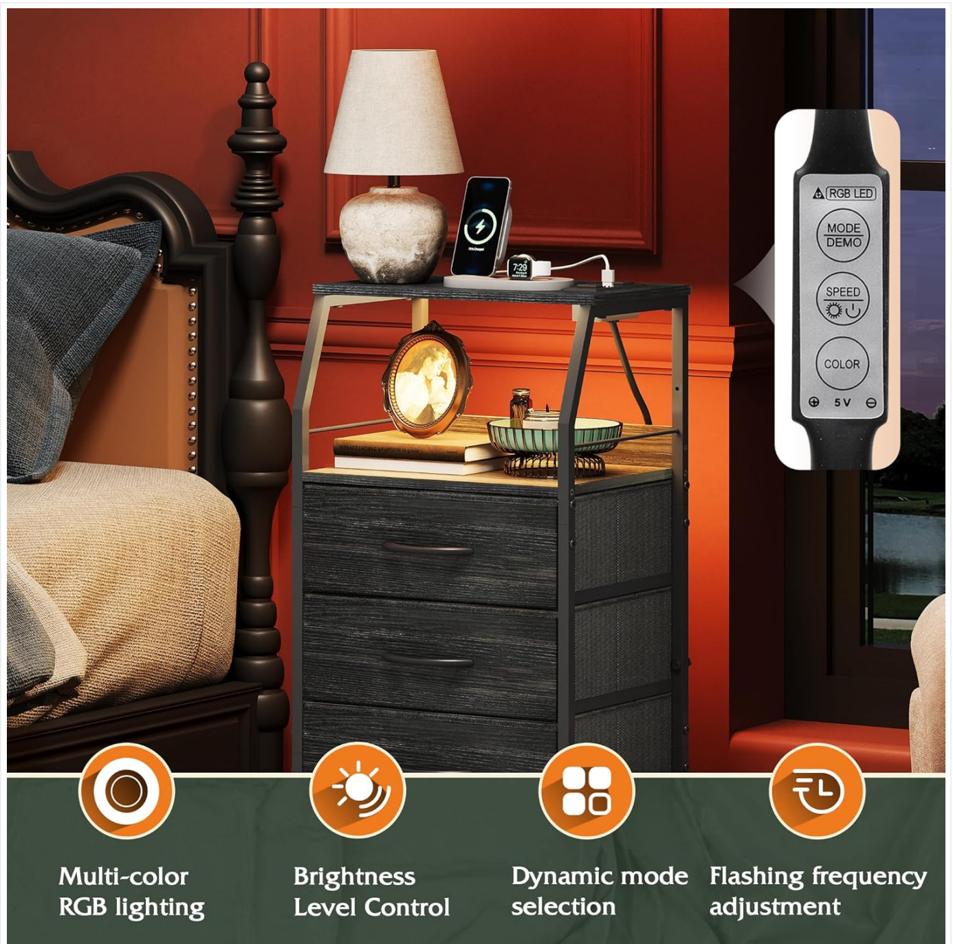
Image: A visual representation of the RGB LED light features, including multi-color options, brightness control, dynamic modes, and flashing frequency adjustment.