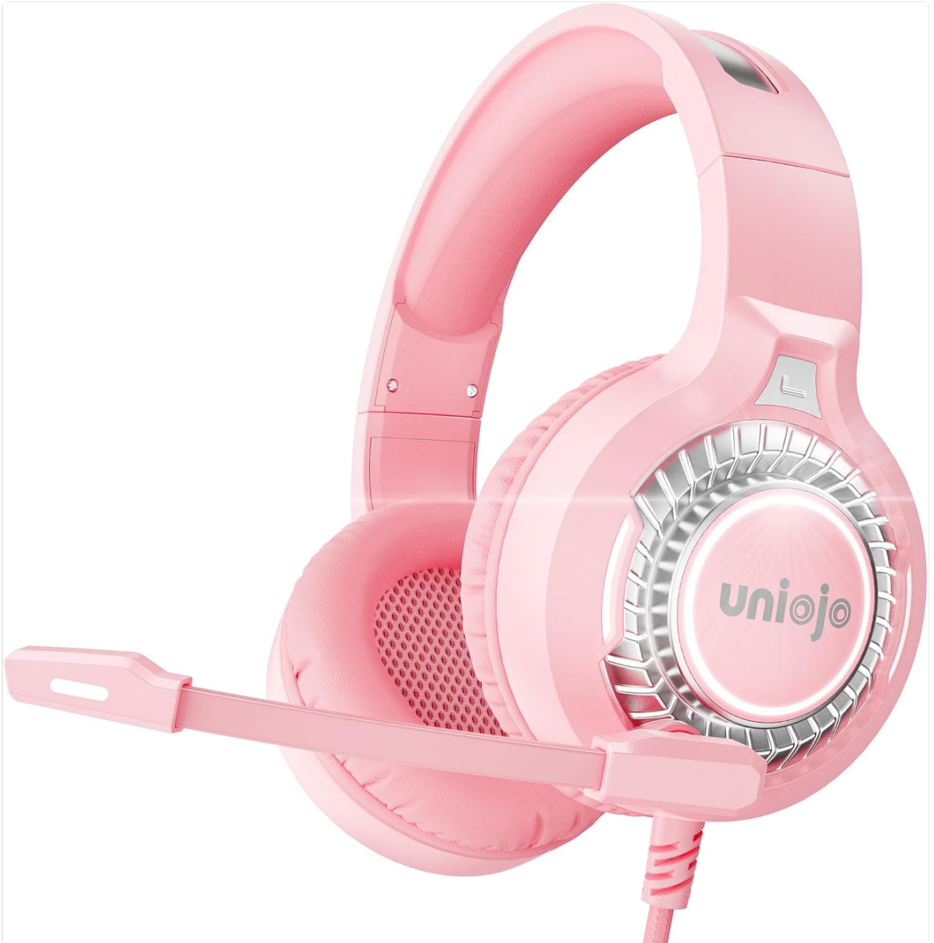
Image: Front view of the UNIOJO U30 Pink Gaming Headset, highlighting its overall design.