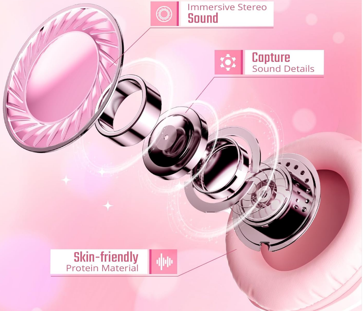
Image: Diagram illustrating the internal components of the 50mm audio driver, emphasizing immersive stereo sound and sound detail capture.

Excellent audio resolution & Excellent clarity