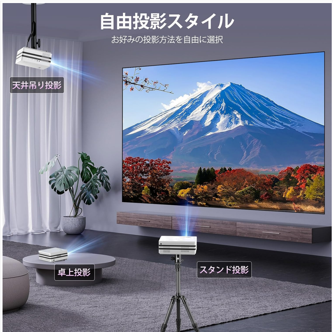
Figure 3.1: Illustration of different projection setups, including tabletop, stand, and ceiling mounting, demonstrating the projector's versatility.