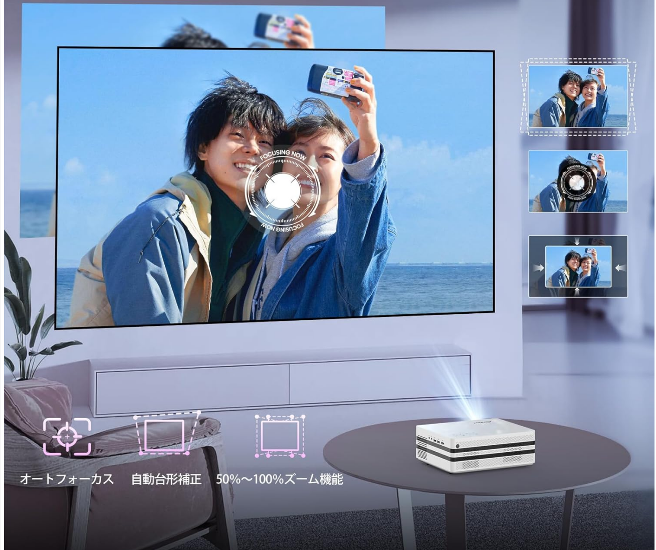
Figure 3.2: Visual representation of the auto-focus and auto-keystone correction features, ensuring a sharp and perfectly shaped image without manual intervention.