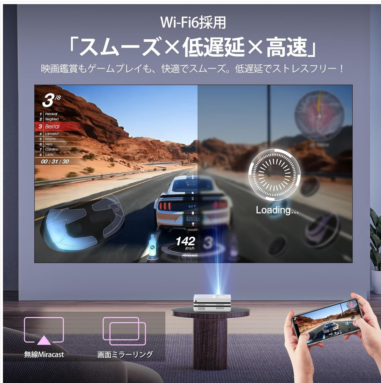
Figure 4.1: Depiction of the projector utilizing Wi-Fi 6 for seamless content delivery, highlighting its capability for smooth gaming and video playback.