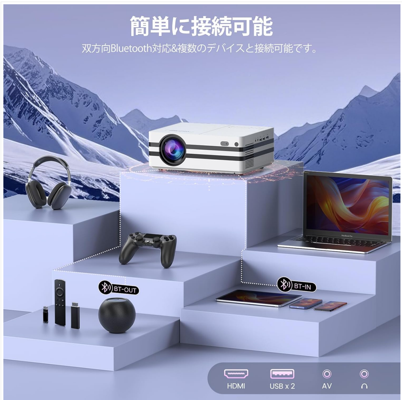
Figure 4.3: Overview of the projector's various input and output ports, including HDMI, USB, and AV, illustrating how different devices can be connected.