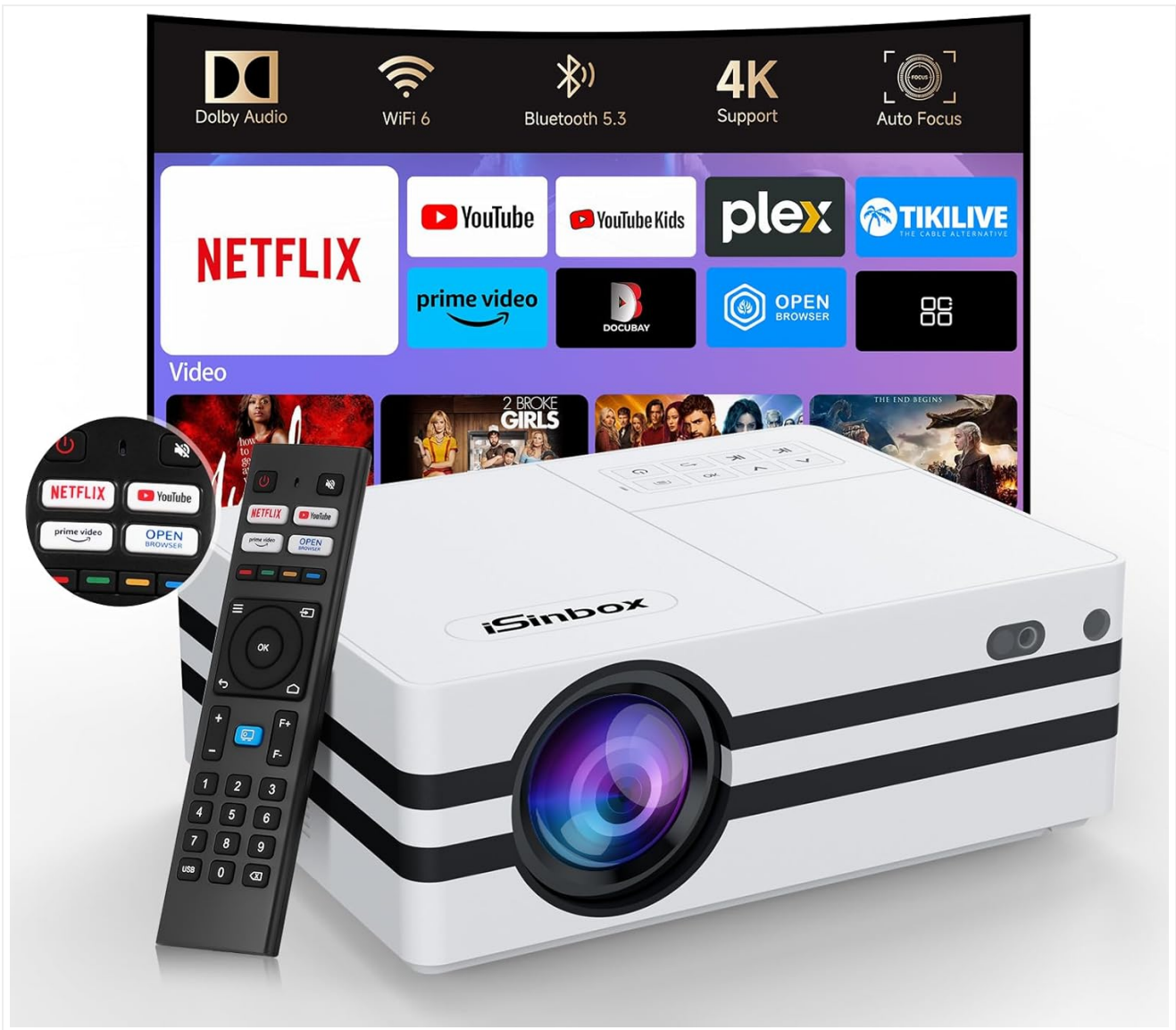
Figure 2.1: The iSinbox A30 Smart Projector shown with its included accessories, including the remote control, various cables, and the user manual.