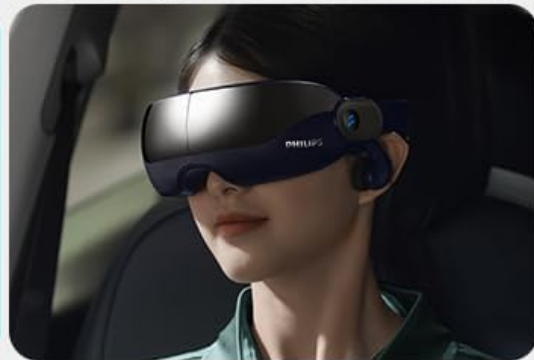
Image 4.2: A user wearing the Philips PPM2702 Eye Mask Messenger, illustrating the integrated sound effect and massage capabilities.

Anti-leakage sounds can not disturb people