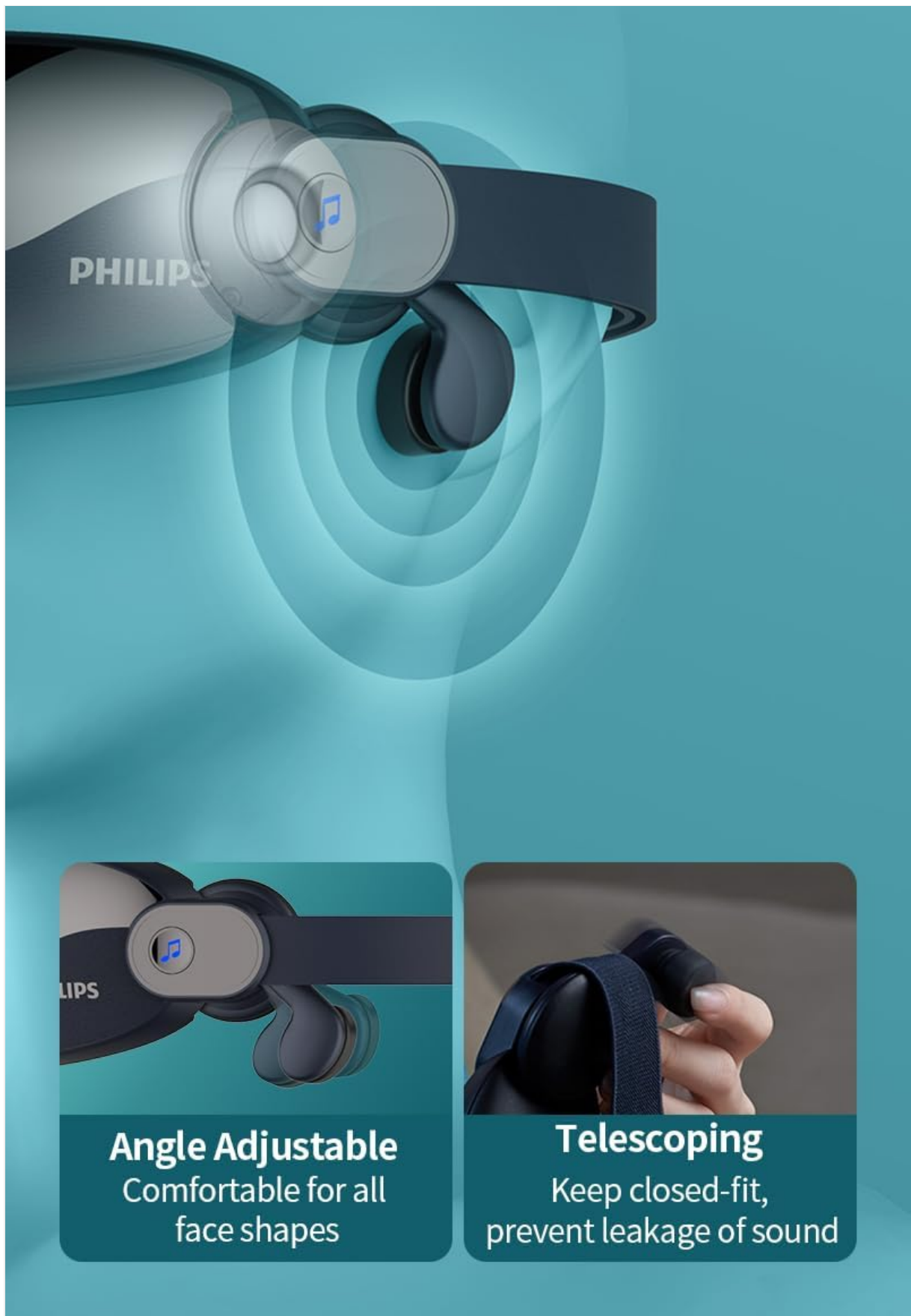
Image 6.3: The anti-leakage sound design of the bone conduction speakers, ensuring privacy and minimal disturbance to others.