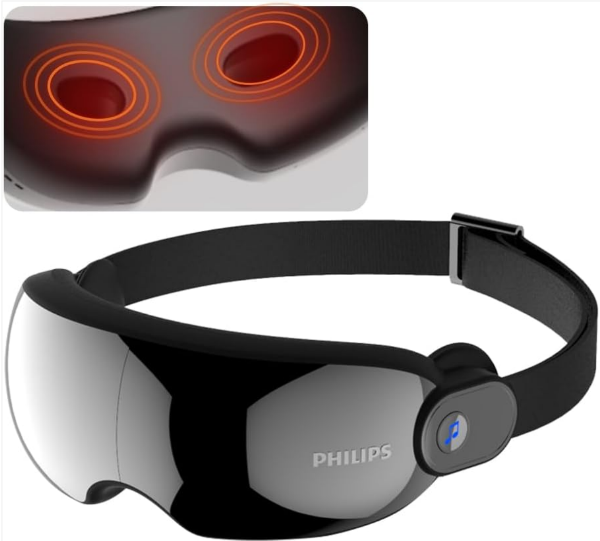
Image 4.1: Philips PPM2702 Eye Mask Massager. The inset shows the internal heating elements around the eye area.