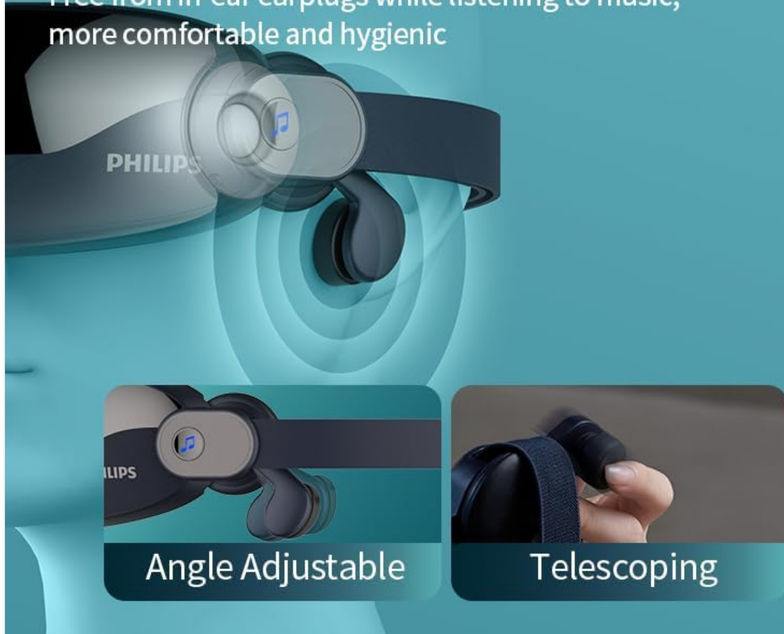
Image 6.2: The 3D hollowed-out visual design of the massager, which prevents direct eyeball pressure and maintains line of sight.

Free from in-ear earplugs while listening to music, more comfortable and hygienic