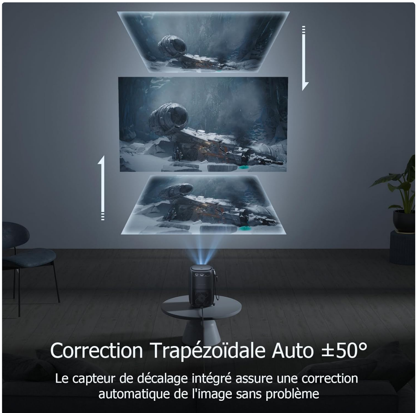
Figure 5.2: Demonstrates the automatic keystone correction feature, which adjusts the image shape automatically.