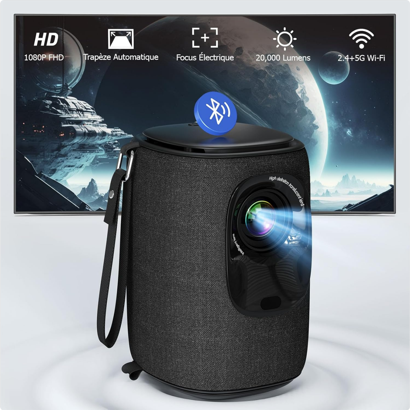
Figure 4.1: Front view of the Lisowod Mini Projector, showcasing its compact design, lens, and key features like 1080P FHD, Auto Keystone, Electric Focus, 2.4+5G Wi-Fi, and Bluetooth connectivity.