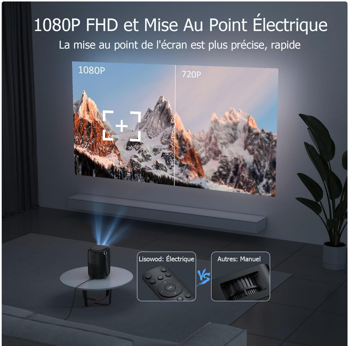
Figure 5.1: Illustrates the precision of 1080P FHD and the ease of electric focus compared to manual focus.