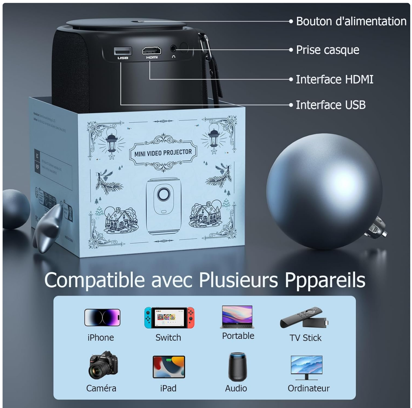
Figure 4.2: Rear view of the projector, indicating the power button, headphone jack, HDMI interface, and USB interface for various connections.