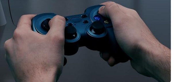
Figure 6.2: Demonstrates the advantage of 2.4G+5G Wi-Fi for smoother and lower latency performance.