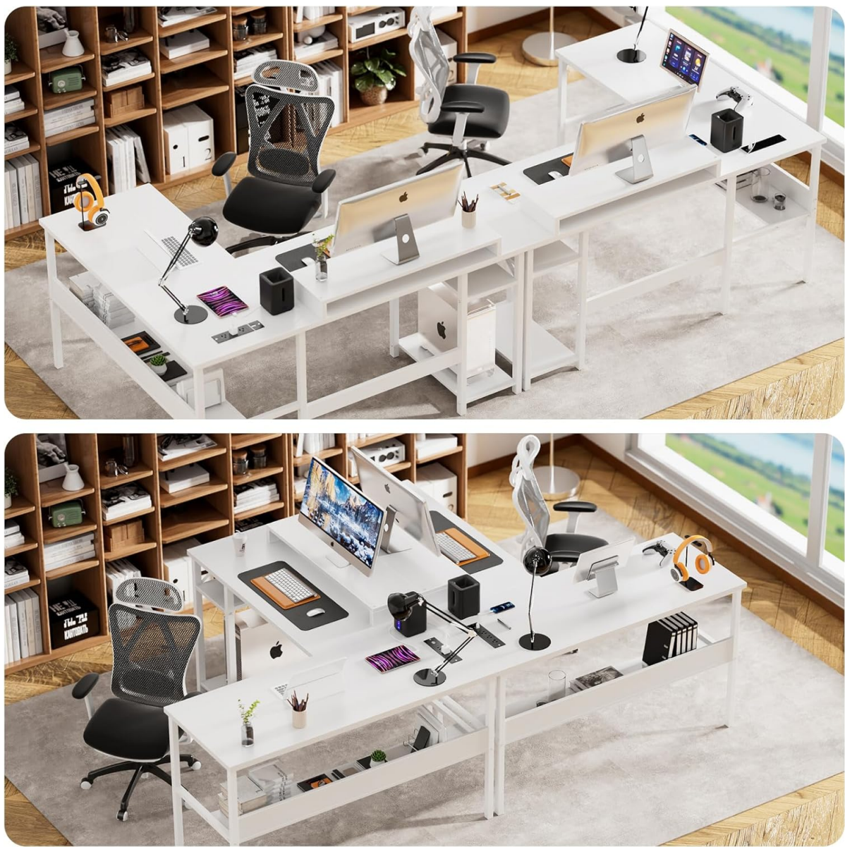
Image 4.1: Visual representation of the reversible L-shape and linear configurations of the desk.

This desk features a reversible design, allowing it to be configured in three ways: L-shape (left or right orientation) or as a straight long desk. Decide on your preferred configuration before starting assembly.