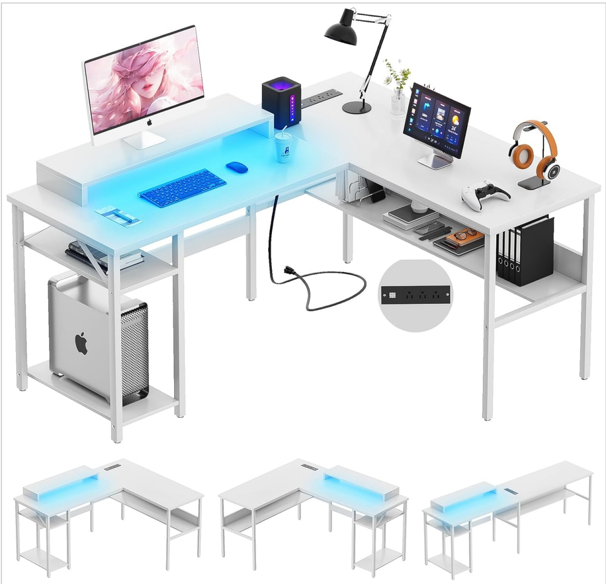
Image 1.1: The Unikito L-Shaped Computer Desk, showcasing its features including the monitor stand, integrated power outlets, and RGB LED lighting.