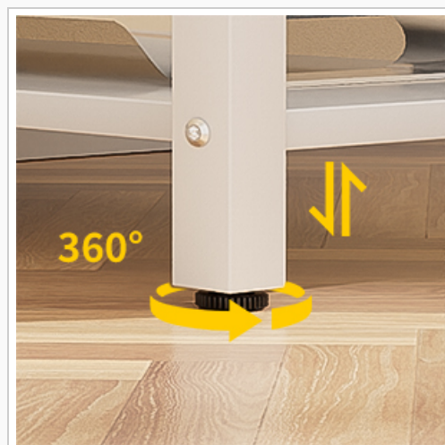
Image 4.3: Illustration of the adjustable foot pads for leveling the desk.

Once assembled, adjust the non-slip foot pads at the base of the desk legs to ensure stability on uneven floors. Rotate them clockwise or counter-clockwise until the desk is level and stable.