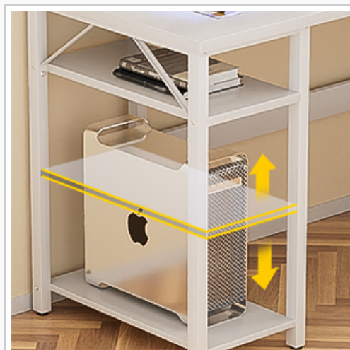
Image 5.3: The monitor stand providing elevated display and under-storage.

The flexible monitor stand elevates your display to an ergonomic height, helping to reduce neck strain and improve posture. It also creates additional storage space underneath for keyboards, mice, or other small items.