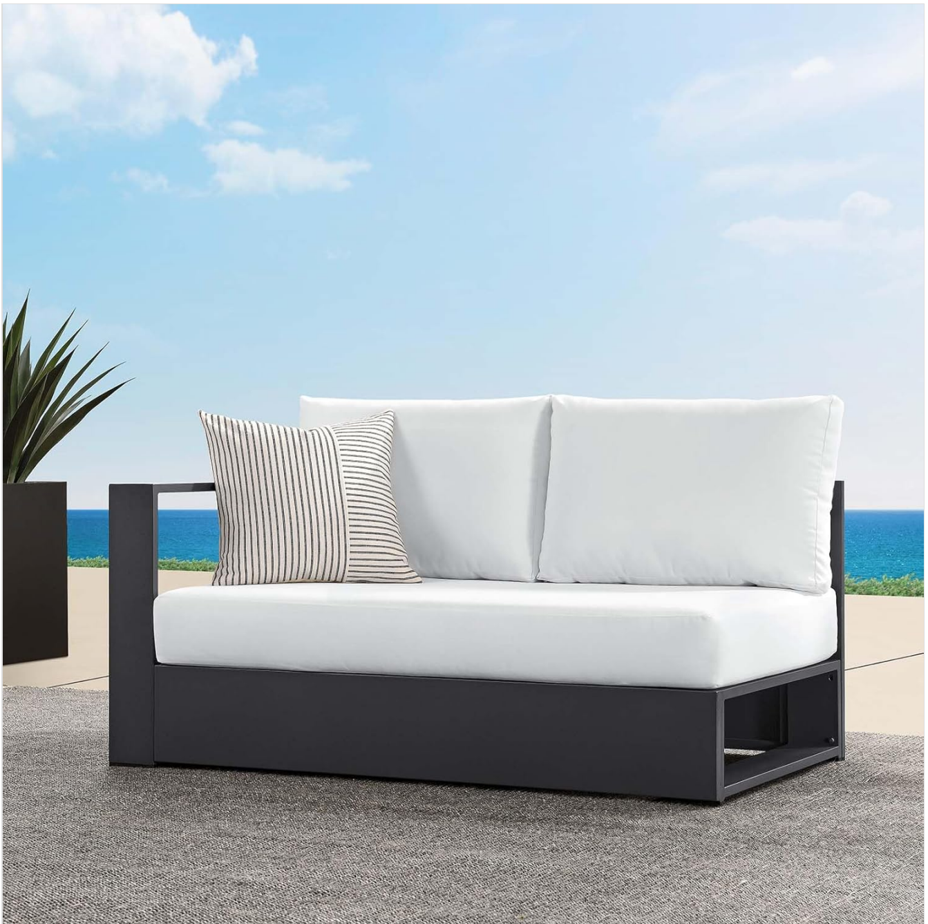
Figure 4.2: Fully assembled Modway Tahoe Left-Facing Outdoor Patio Loveseat.