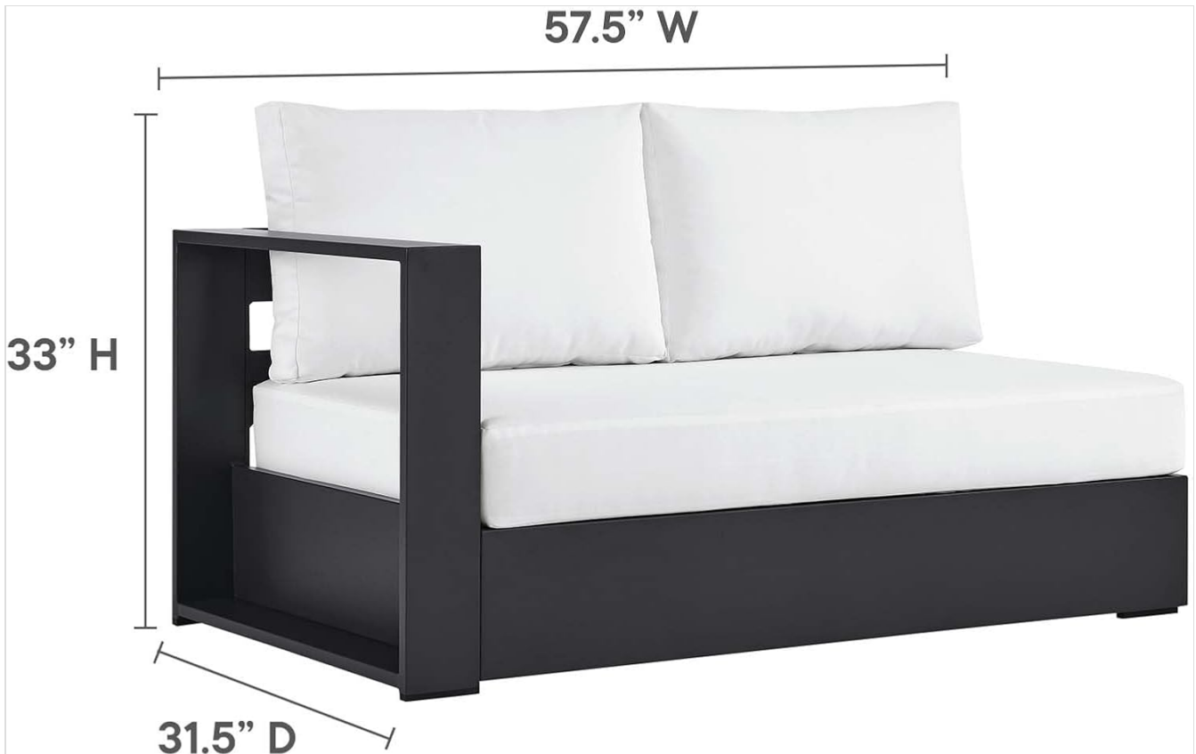
Figure 4.1: Loveseat dimensions for reference during assembly. The loveseat measures 57.5 inches wide, 33 inches high, and 31.5 inches deep.