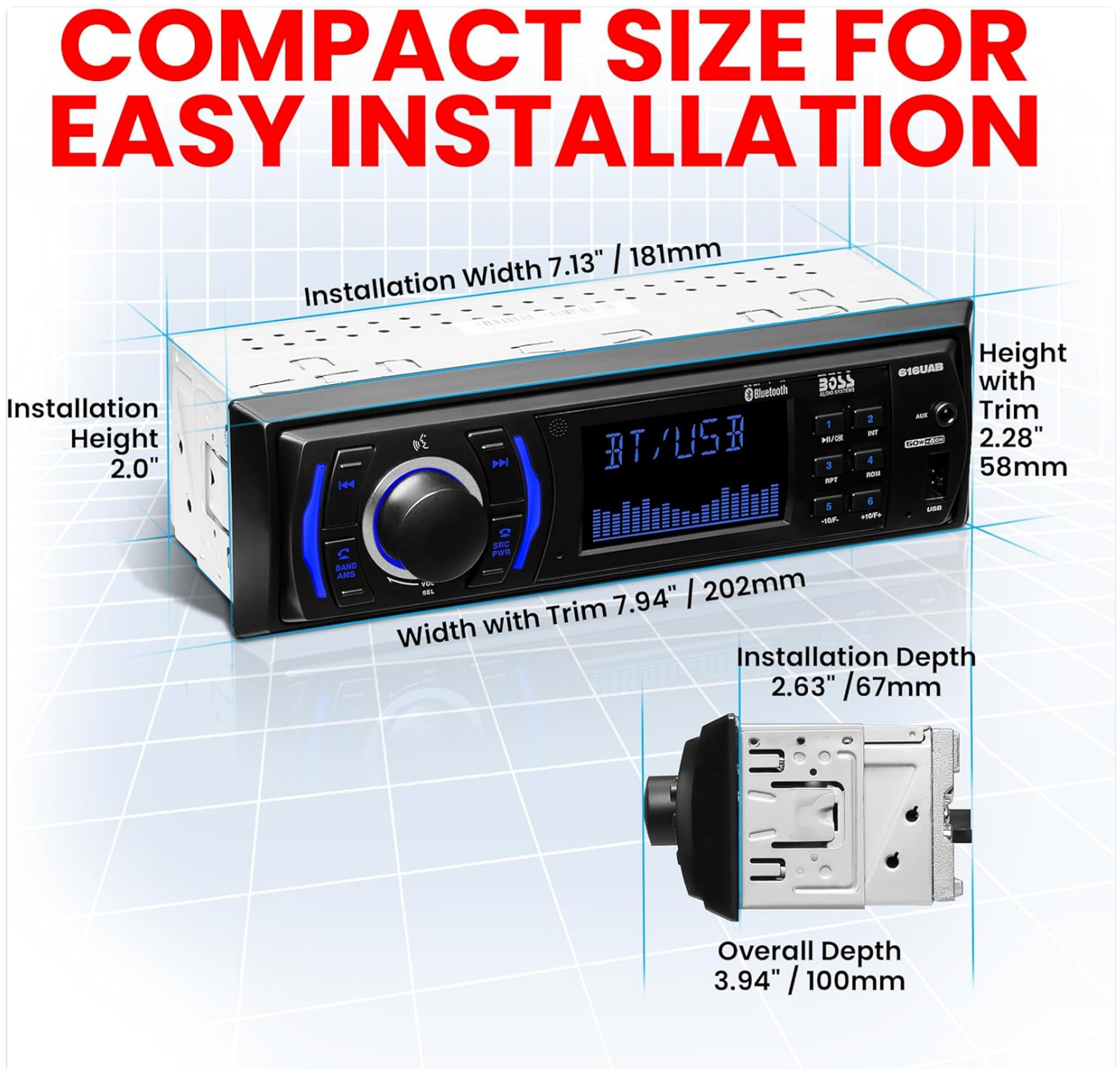
Figure 2: Receiver dimensions for installation. Installation Width: 7.13" (181mm), Installation Height: 2.0", Height with Trim: 2.28" (58mm), Width with Trim: 7.94" (202mm), Installation Depth: 2.63" (67mm), Overall Depth: 3.94" (100mm).

Before installation, ensure that the dimensions of the 616UAB receiver are compatible with your vehicle's dashboard opening. Refer to Figure 2 for detailed measurements.