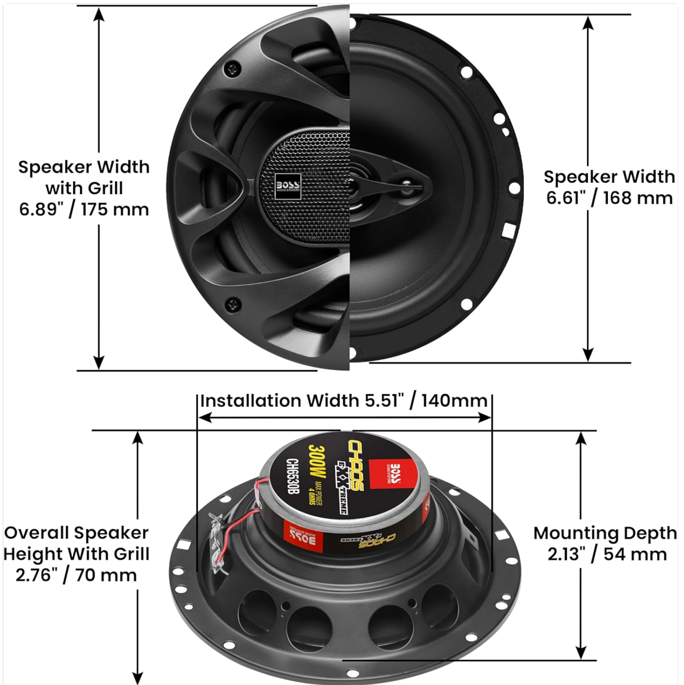
Figure 4: Speaker dimensions for installation. Speaker Width with Grill: 6.89" (175mm), Speaker Width: 6.61" (168mm), Installation Width: 5.51" (140mm), Overall Speaker Height With Grill: 2.76" (70mm), Mounting Depth: 2.13" (54mm).

The CH6530B speakers are designed for easy integration into standard 6.5-inch speaker openings. Refer to Figure 4 for detailed speaker dimensions and mounting depth requirements. Ensure proper wiring polarity when connecting speakers to the receiver or amplifier.