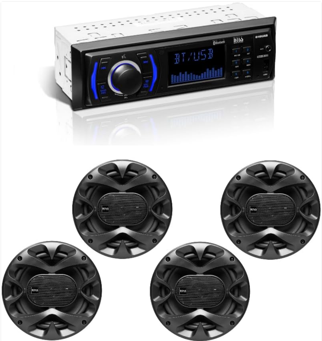
Figure 1: BOSS Audio Systems 616UAB Receiver and CH6530B Speakers Kit.