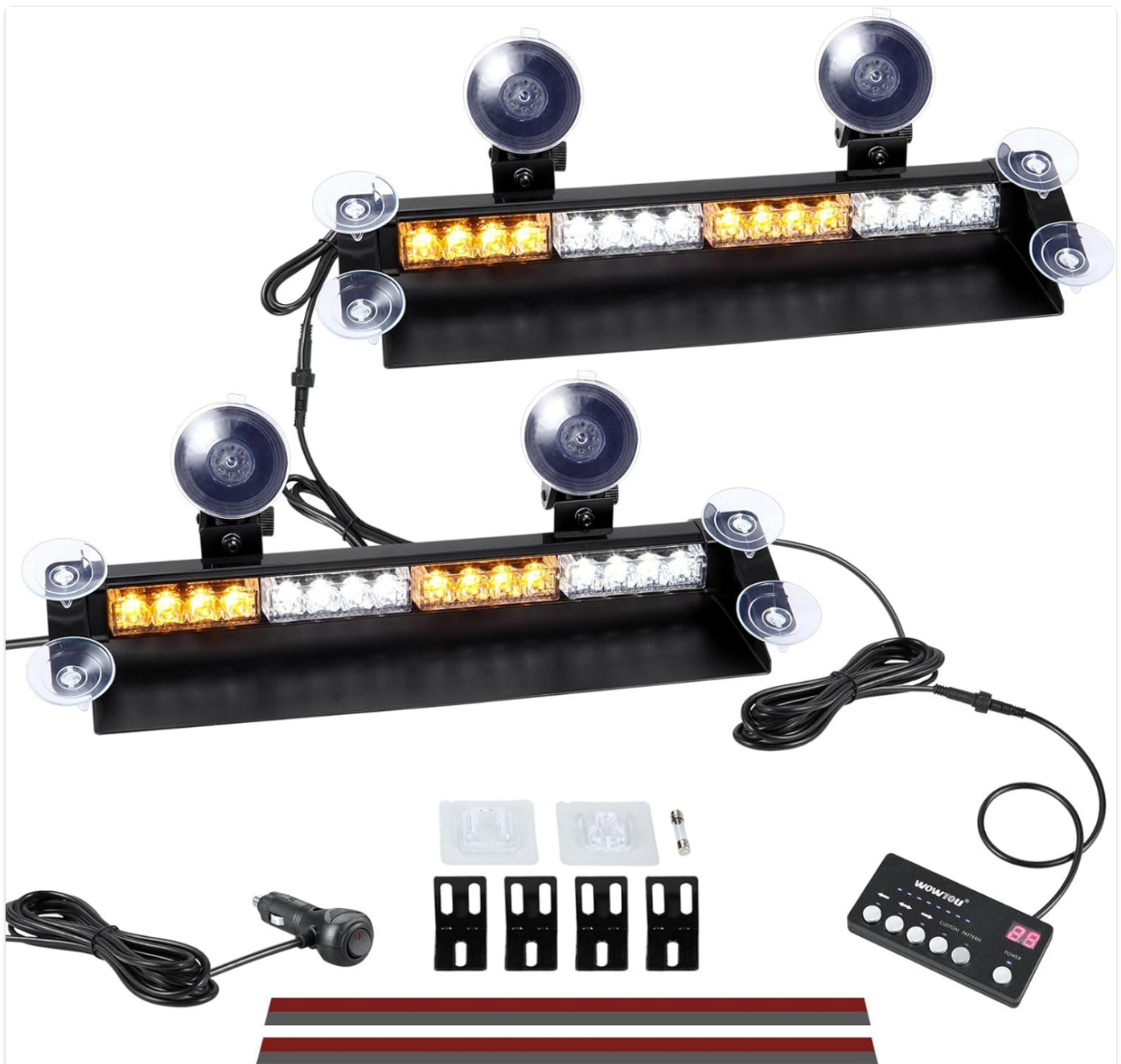
Figure 1: Overview of the WOWTOU 2-in-1 LED Amber White Dash Strobe Light Bar, including the main unit, control panel, and various mounting accessories.