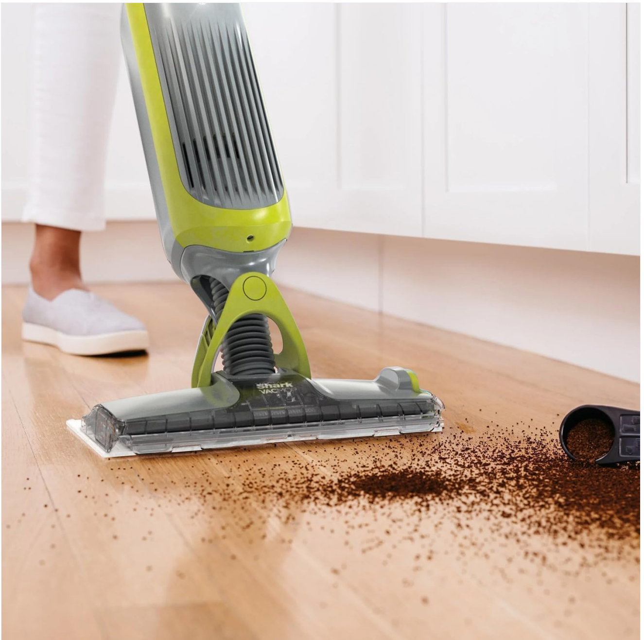
Image: The VACMOP effectively collecting dry debris from a hard floor surface.