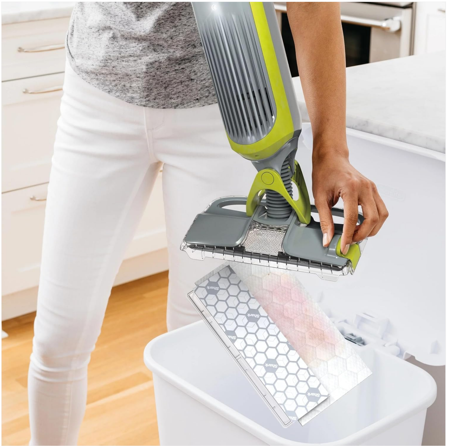
Image: A user demonstrating the no-touch disposal of a used VACMOP pad into a trash receptacle.