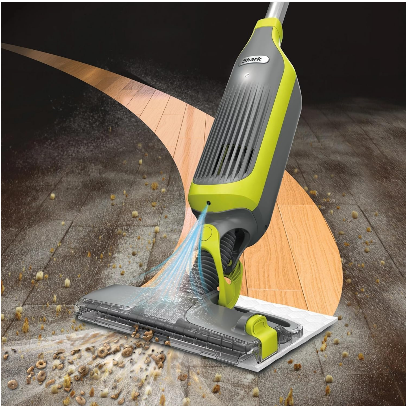
Image: The VACMOP in action, spraying cleaning solution to tackle wet messes.