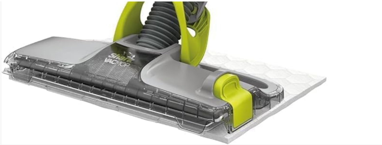
Image: The Shark VM200 VACMOP unit, showing its full assembly.