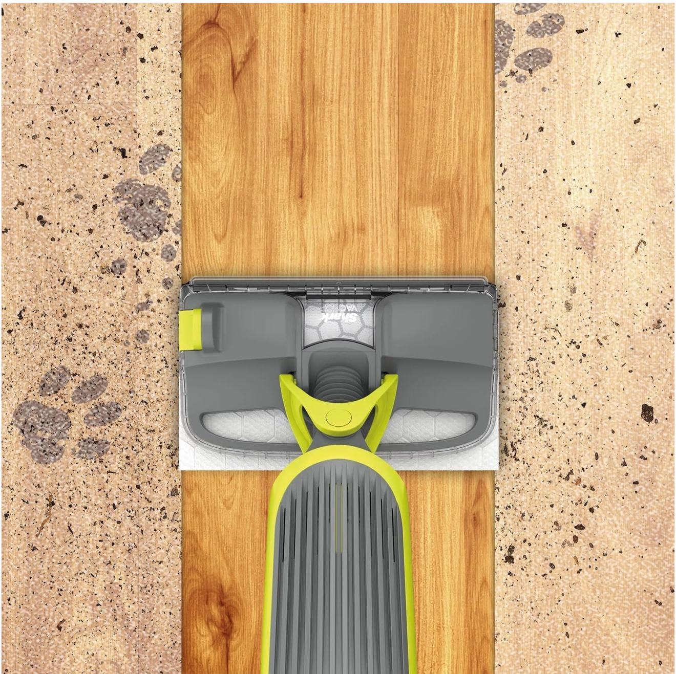
Image: An overhead perspective demonstrating the VACMOP's cleaning effectiveness on a soiled floor.