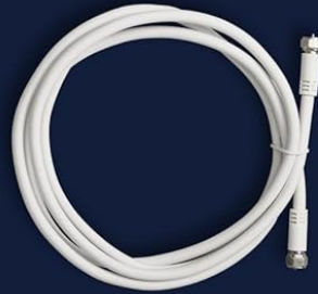
6' Coaxial Cable