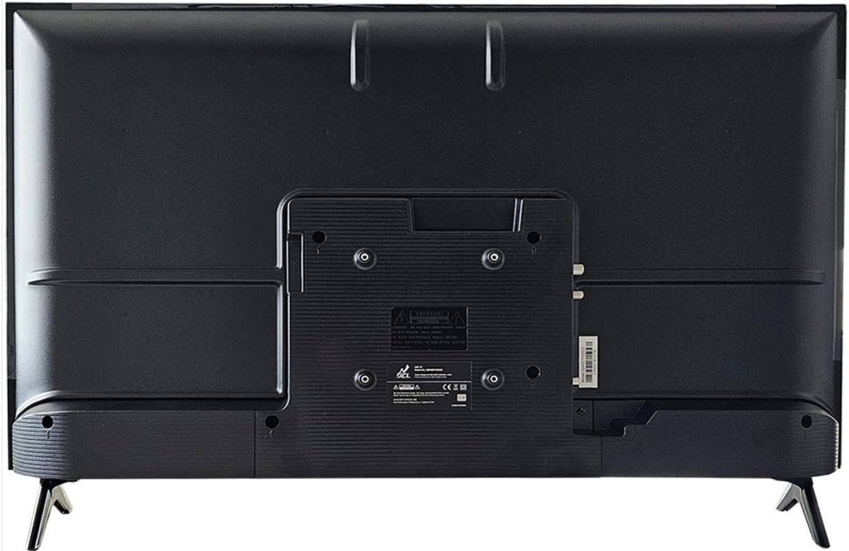
Image: Rear view of the JCL 32HDDTV2023 television, highlighting the VESA mounting points and various input/output ports.

This TV supports VESA 100 x 100mm wall mounts. Ensure you use a compatible wall mount bracket and follow the instructions provided with the wall mount. Remove the stand before wall mounting.