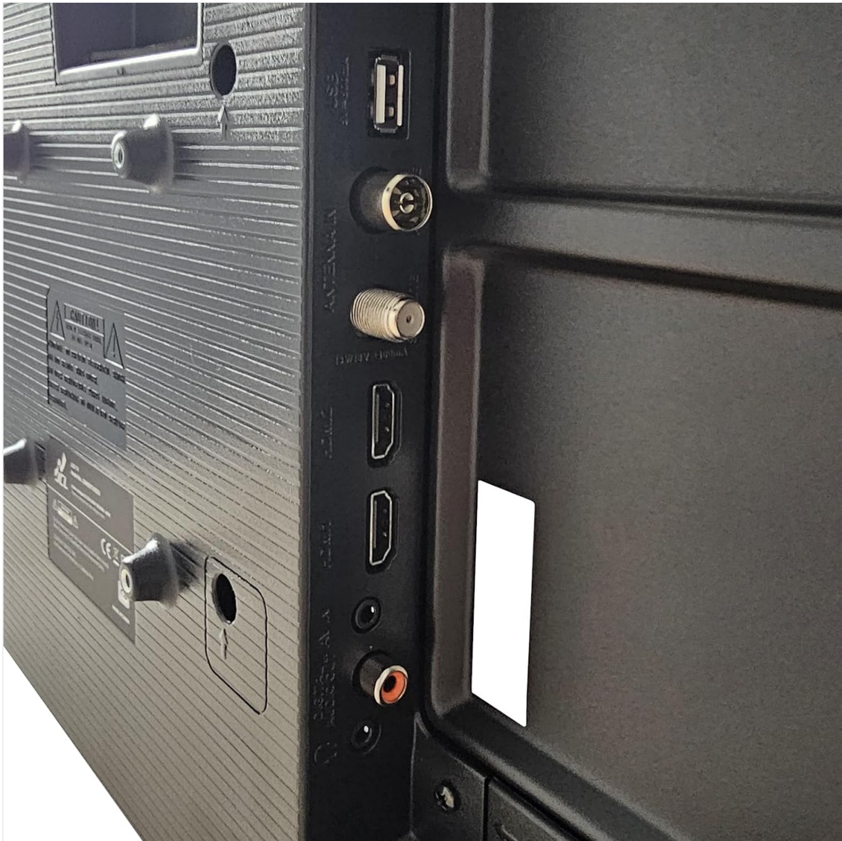
Image: A close-up view of the connectivity panel on the JCL 32HDDTV2023 TV, showing ports such as USB, Antenna, HDMI, and Composite Video/Audio inputs.