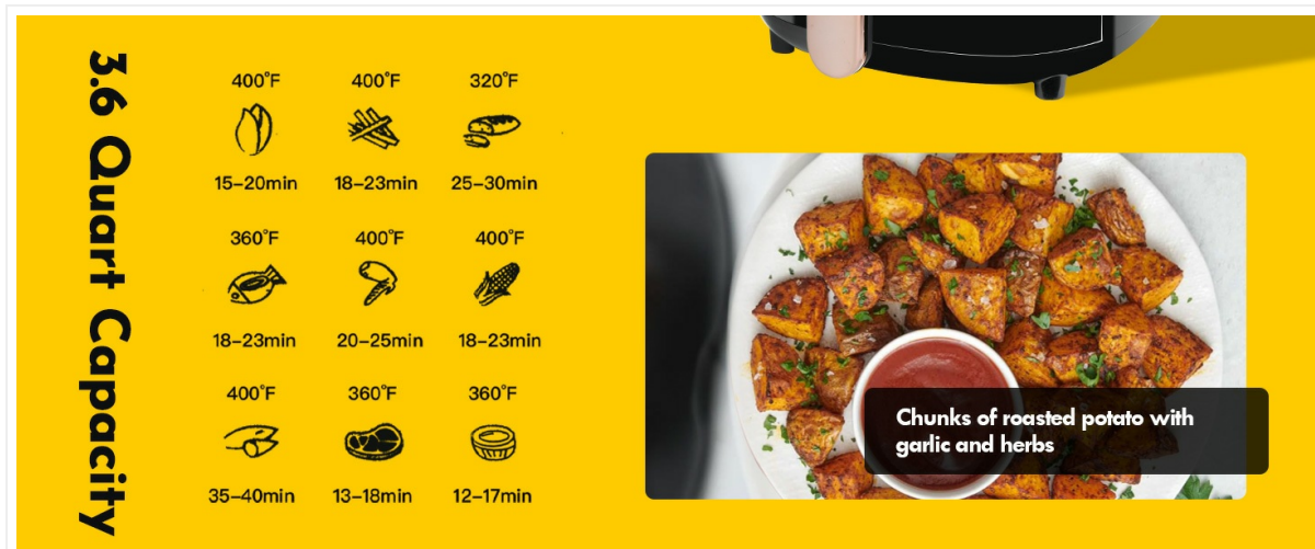
Figure 6.1: A visual guide for recommended cooking times and temperatures for common air fryer foods.