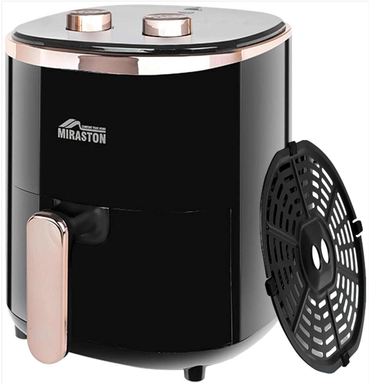
Figure 3.1: Main unit of the MIRASTON 3.6QT Air Fryer with its removable crisper tray.

The MIRASTON 3.6QT Air Fryer is designed for compact use while offering ample cooking capacity. It features intuitive knob controls for temperature and time settings.