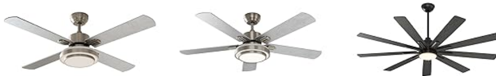
Image: Various components of the ceiling fan, including the canopy, down rod, and blades.