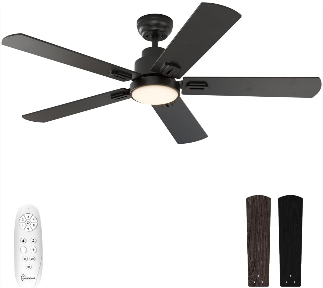
Image: warmiplanet 52 Inch Indoor Ceiling Fan, showcasing its sleek design and integrated LED light.