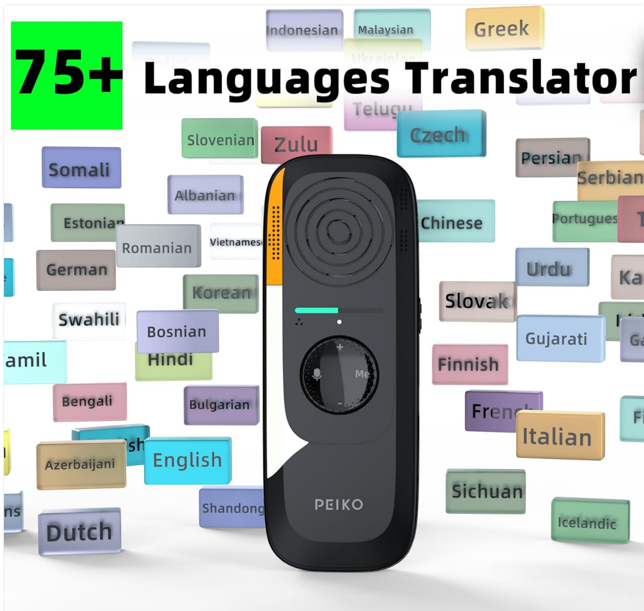
Figure 2.3: Language Support Overview

This image visually represents the extensive language support of the Peiko Trbox, showing the device surrounded by numerous language bubbles.