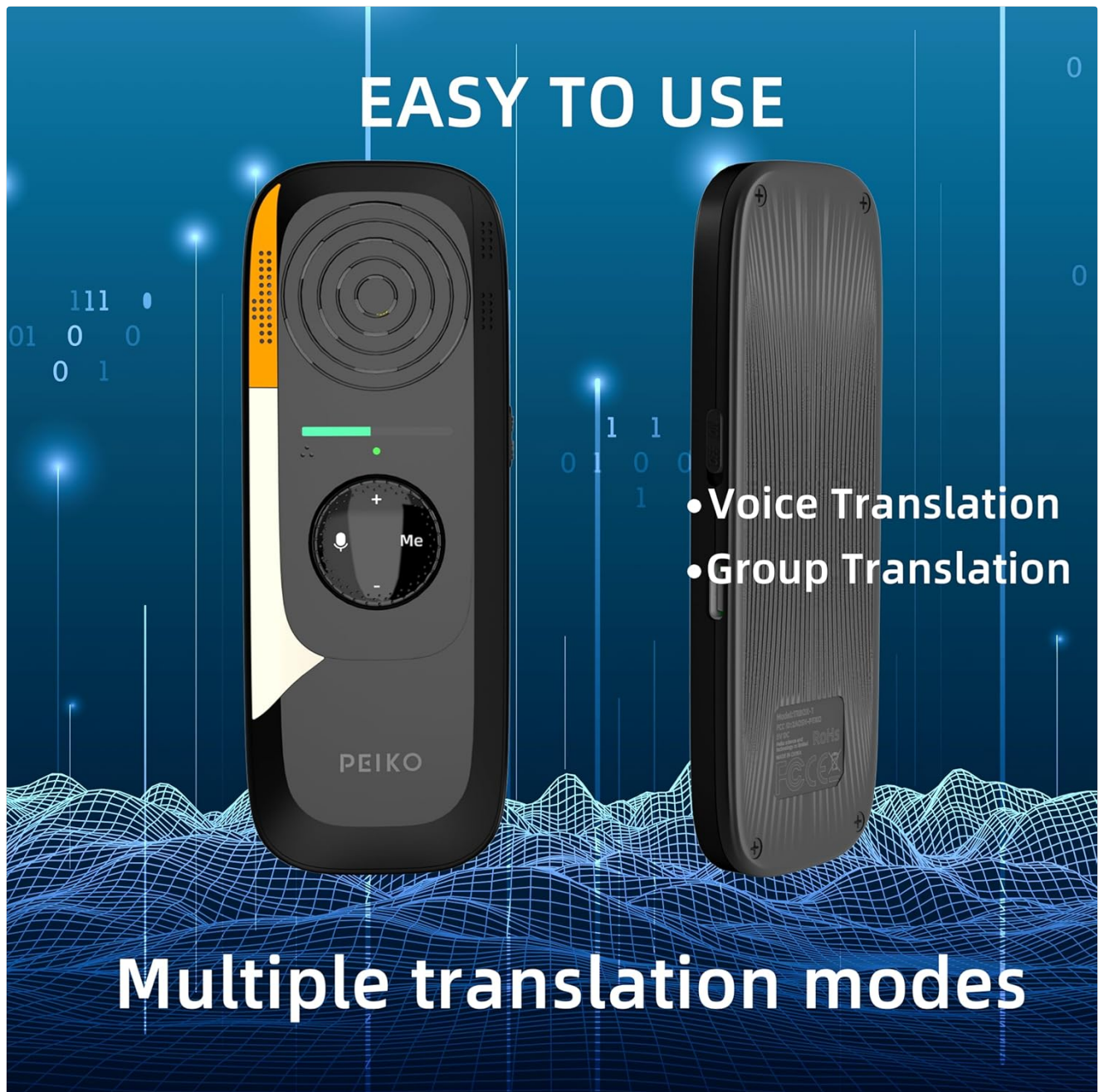
Figure 4.1: Translation Modes

This image illustrates the two primary translation modes of the Peiko Trbox: Voice Translation for direct conversations and Group Translation for multi-participant communication.