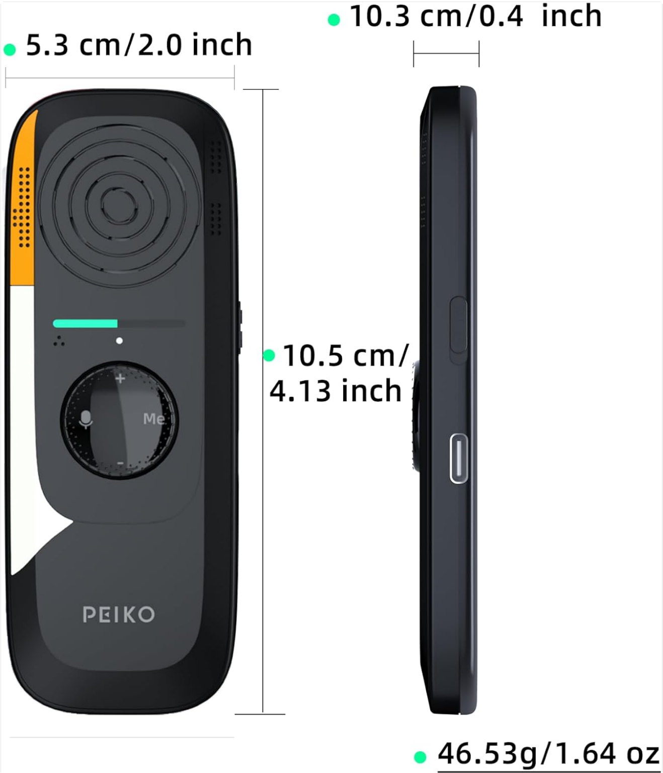
Figure 7.1: Device Dimensions