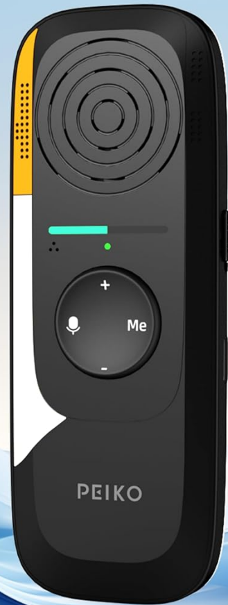
Figure 2.4: Real-Time Translation Performance

This image highlights the high accuracy (98%) and rapid response time (0.2s) of the Peiko Trbox for real-time translation.