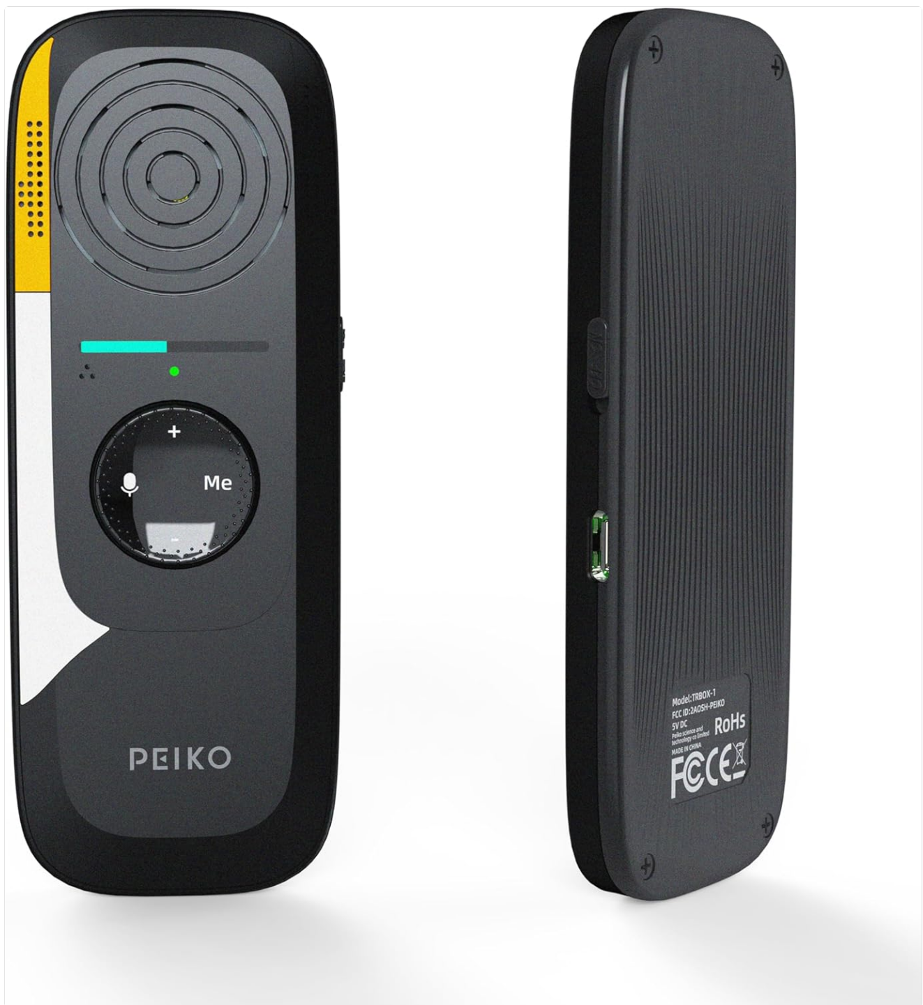
Figure 2.1: Front and Back View of the Peiko Trbox

This image displays the sleek design of the Peiko Trbox, showing both the front with its control buttons and speaker, and the back panel.