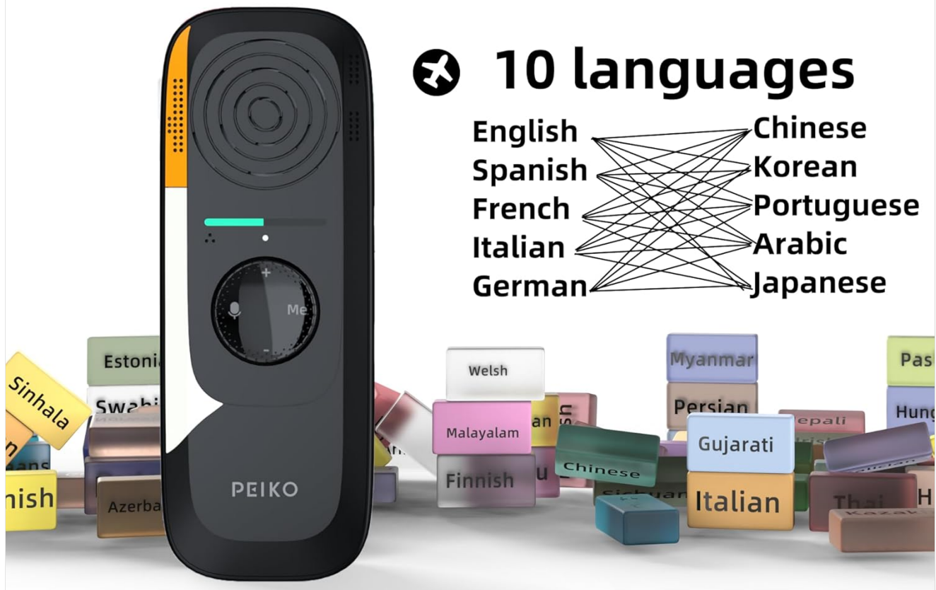
Figure 2.5: Offline Translation Languages

This image illustrates the 10 languages supported for offline translation by the Peiko Trbox, indicating its utility even without an internet connection.