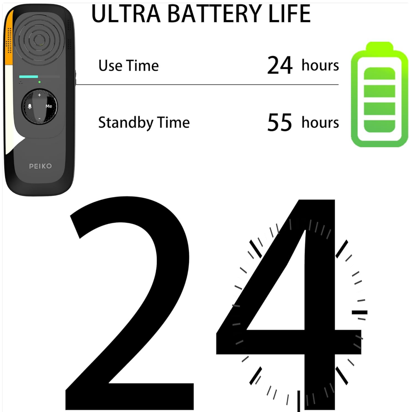
Figure 2.6: Ultra Battery Life

This image displays the impressive battery life of the Peiko Trbox, showing 24 hours of use time and 55 hours of standby time.