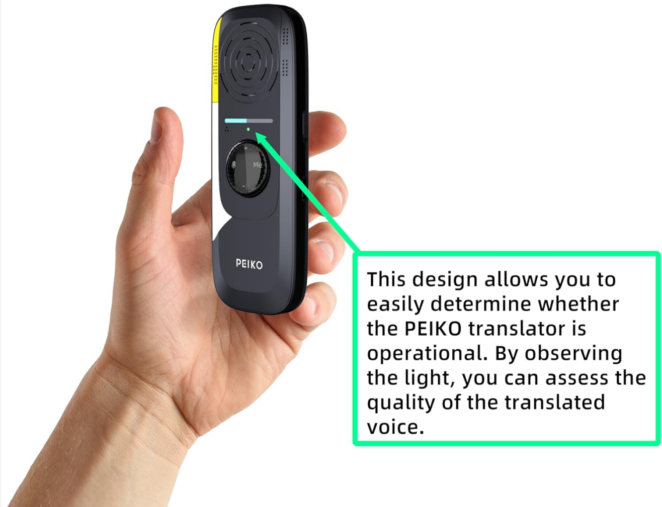
Figure 3.1: Quick Setup Guide

This image provides a visual step-by-step guide for setting up the Peiko Trbox, from downloading the app to initiating translation.